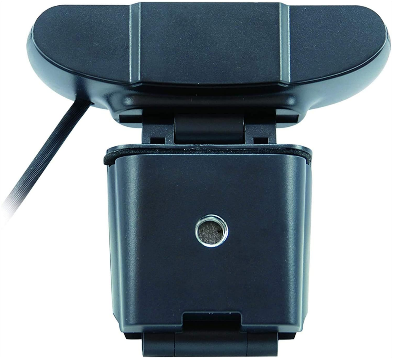
Image: The adjustable base of the AMDIS04 webcam, designed for stable placement on a desk or attachment to a monitor.