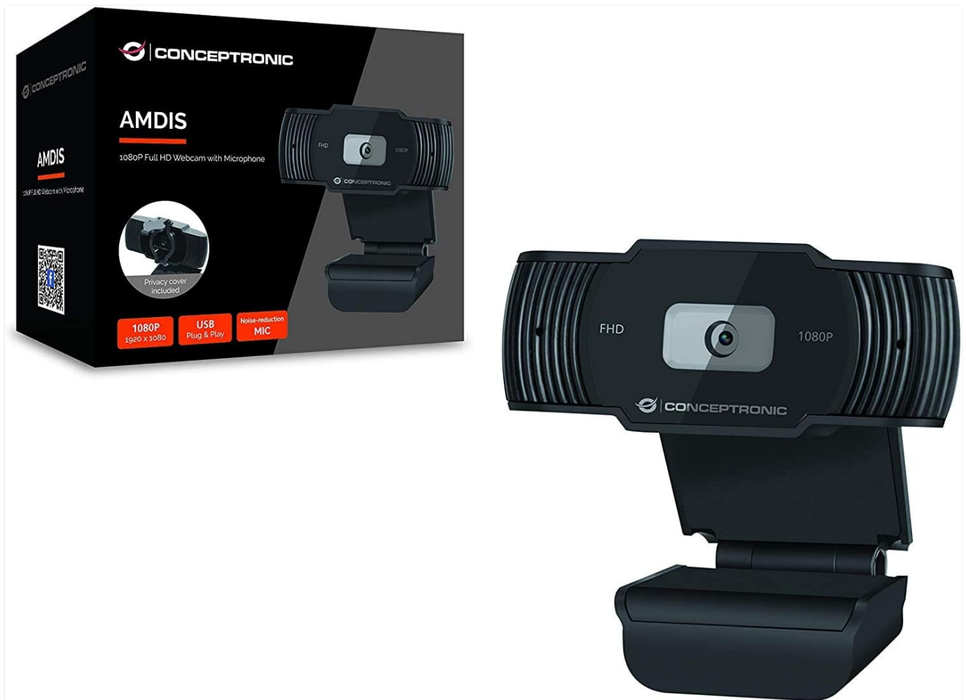
Image: The AMDIS04 webcam shown alongside its retail box, highlighting key features like 1080P resolution, USB plug & play, and noise-reduction microphone.

Please check the package contents upon unboxing to ensure all items are present: