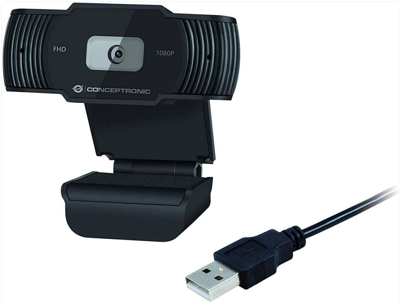
Image: The AMDIS04 webcam with its integrated USB cable, ready for connection to a computer.