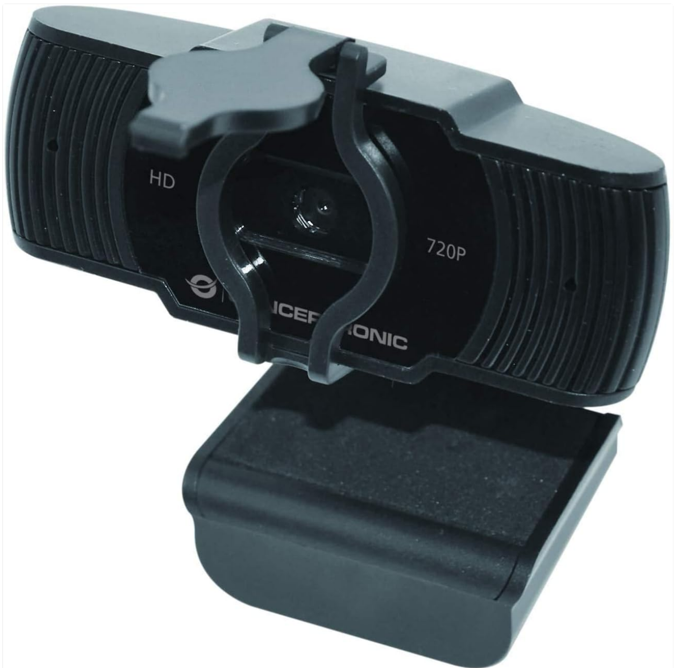
Image: The AMDIS04 webcam with the privacy cover slid over the lens, providing physical privacy when the camera is not in use.