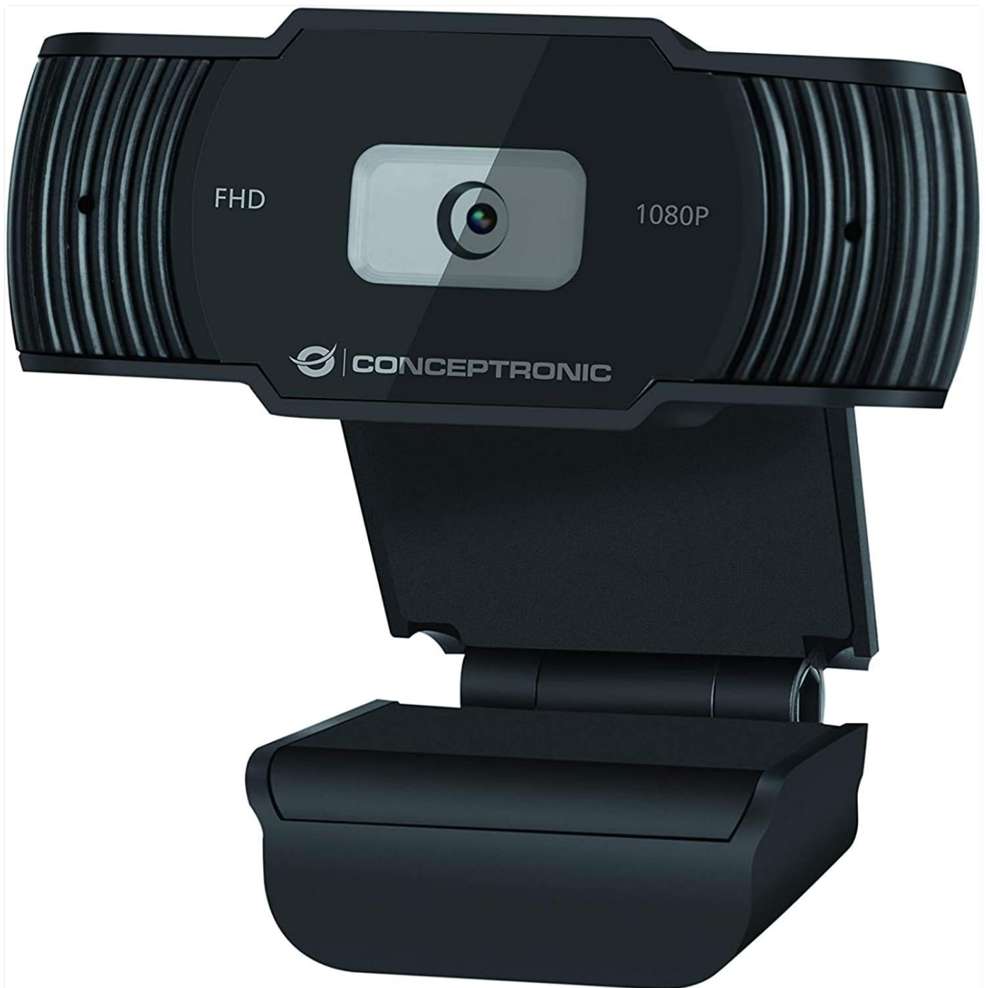
Image: Front view of the AMDIS04 webcam, showing the lens and "FHD 1080P" indicators.

The Conceptronic AMDIS04 webcam is designed for ease of use with minimal manual controls. Most functions are managed through your computer's operating system or the specific application you are using.