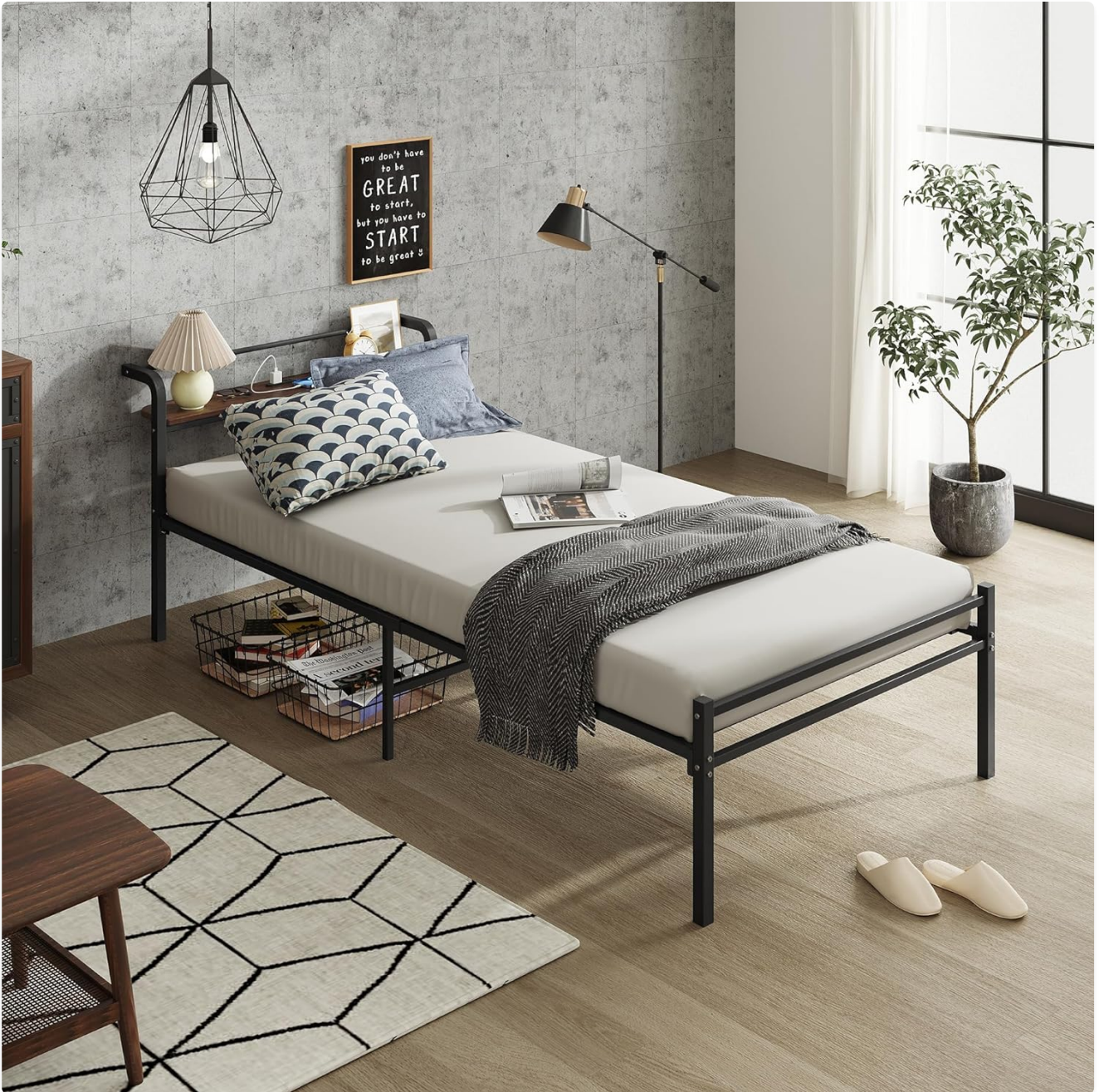
Image: Visual guide for bed frame assembly.