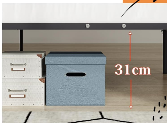
Image: Demonstration of the spacious under-bed storage area.

お部屋を少しでも広く使いたいという方や、ひとり暮らしでスペースの限られた方など、スペースを少しも無駄せずに活用出来ます。