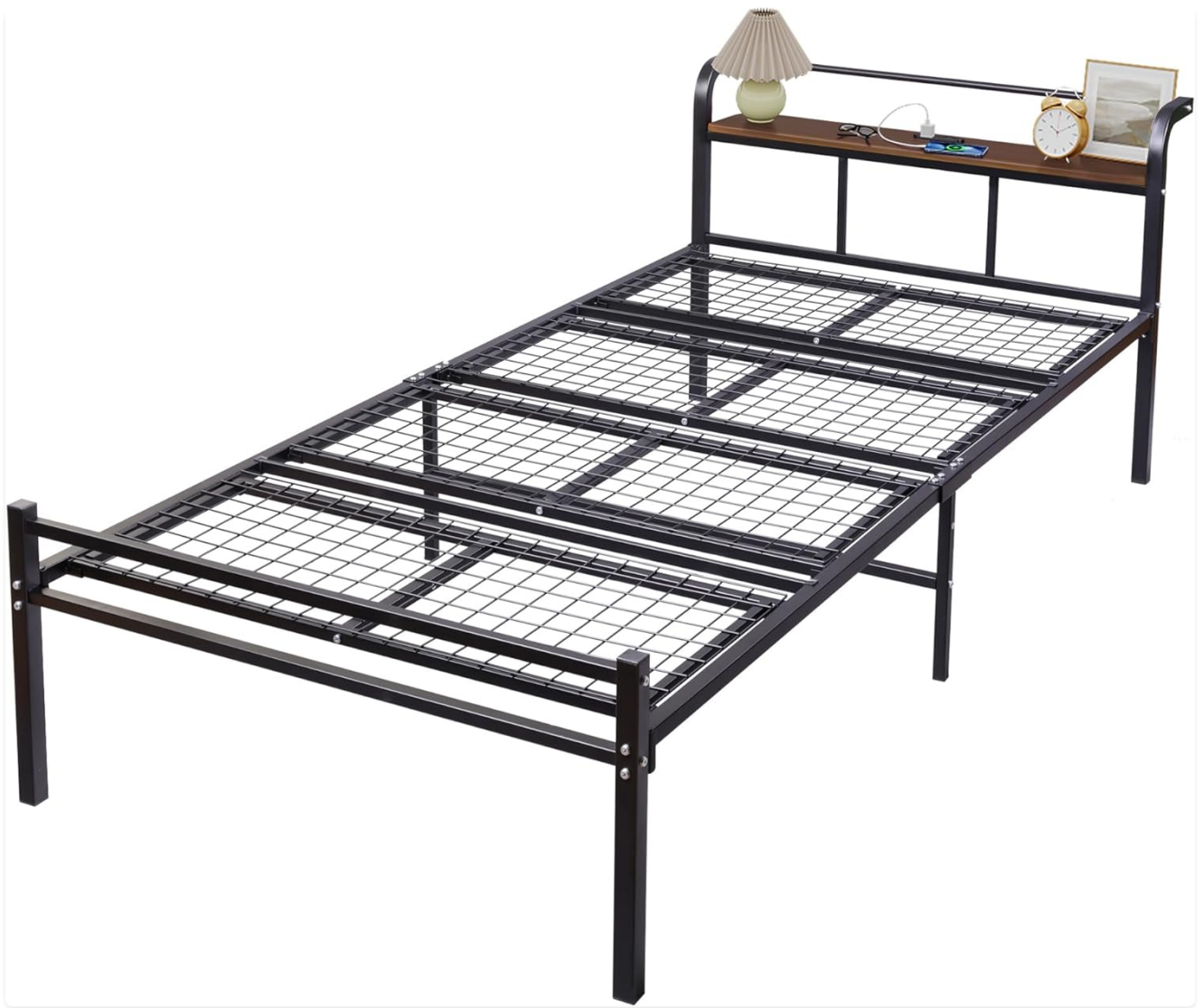
Image: Overall view of the WLIVE Single Bed Frame.