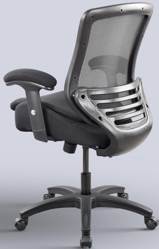
Image 5.2: Diagram highlighting the back and lumbar support features designed for ergonomic comfort.