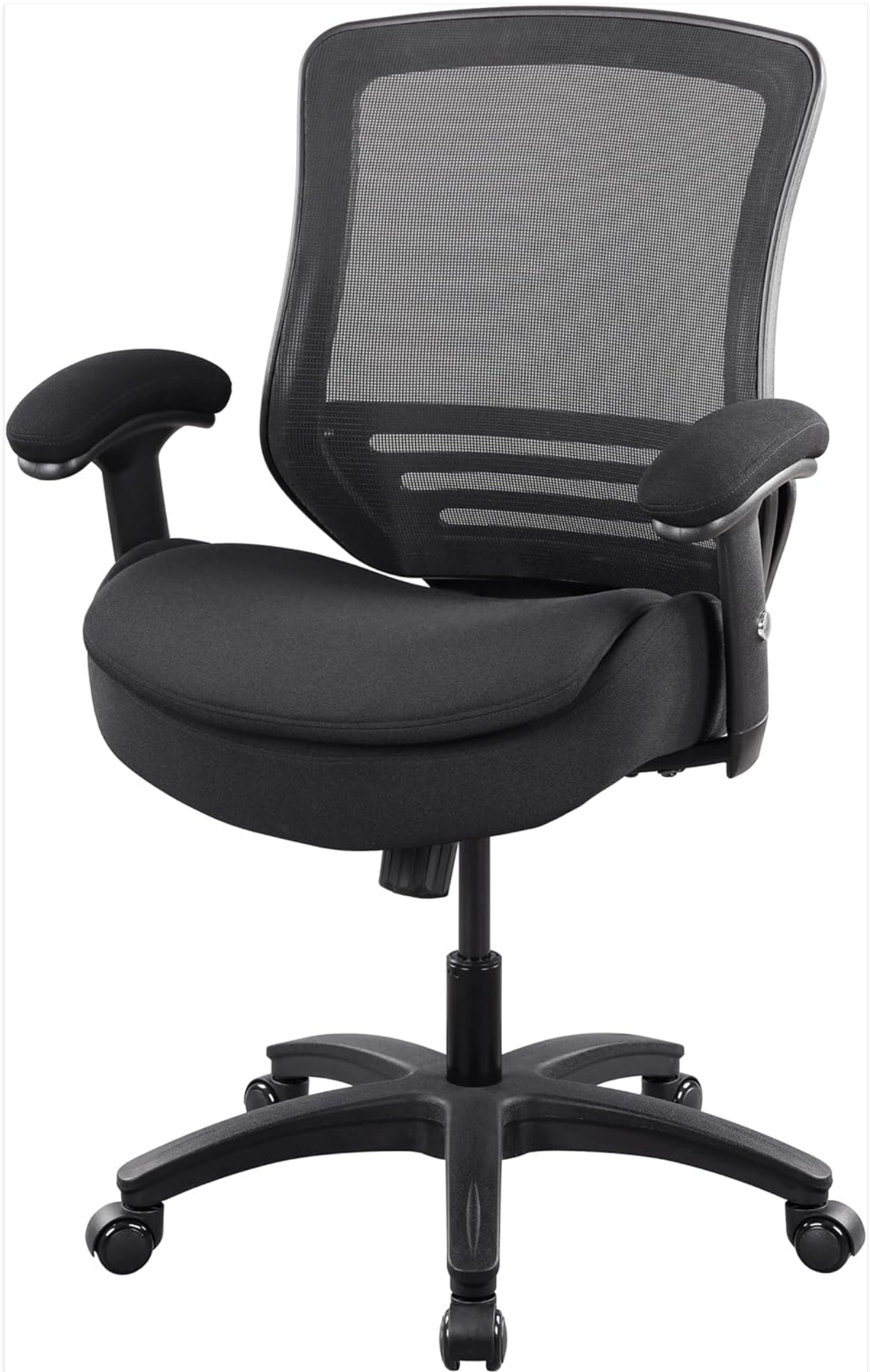
Image 1.1: Front view of the LONGBOSS LBS-2810 Ergonomic Office Chair, showcasing its mesh back, double seat cushion, and adjustable armrests.