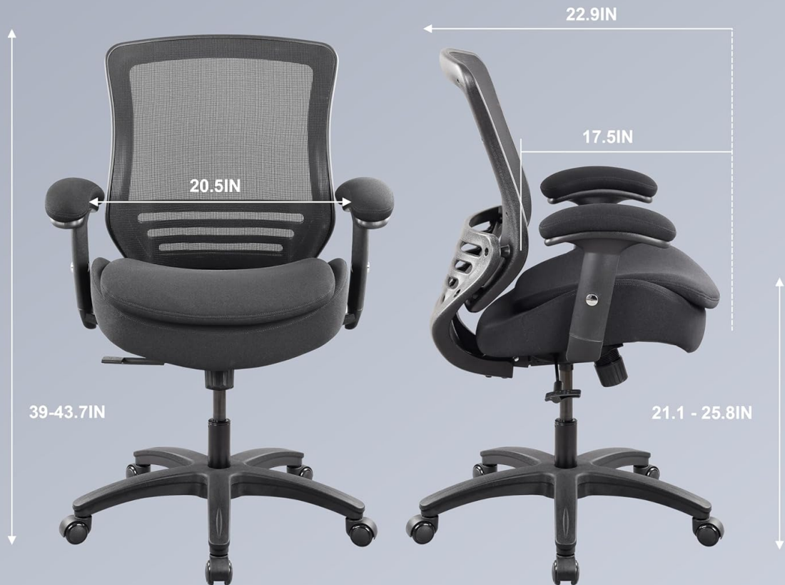
Image 8.1: Detailed product dimensions including seat width, back height, and overall chair height range.