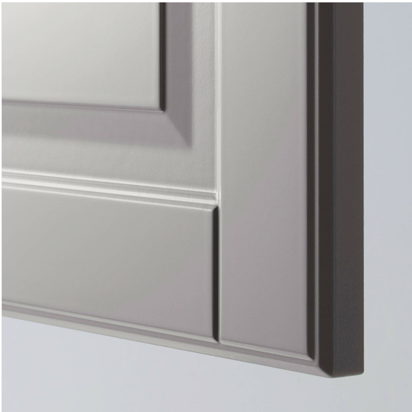
Image: A detailed shot of the BODBYN drawer front's edge, demonstrating the craftsmanship and finish quality.