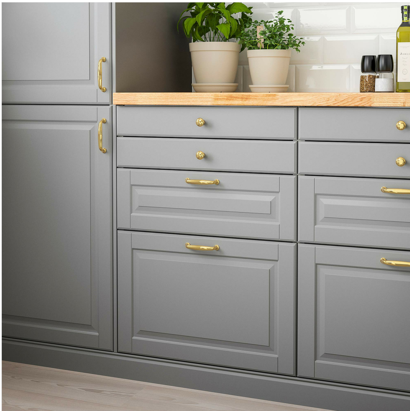
Image: A close-up view of installed BODBYN drawer fronts, illustrating their fit and the appearance of handles.