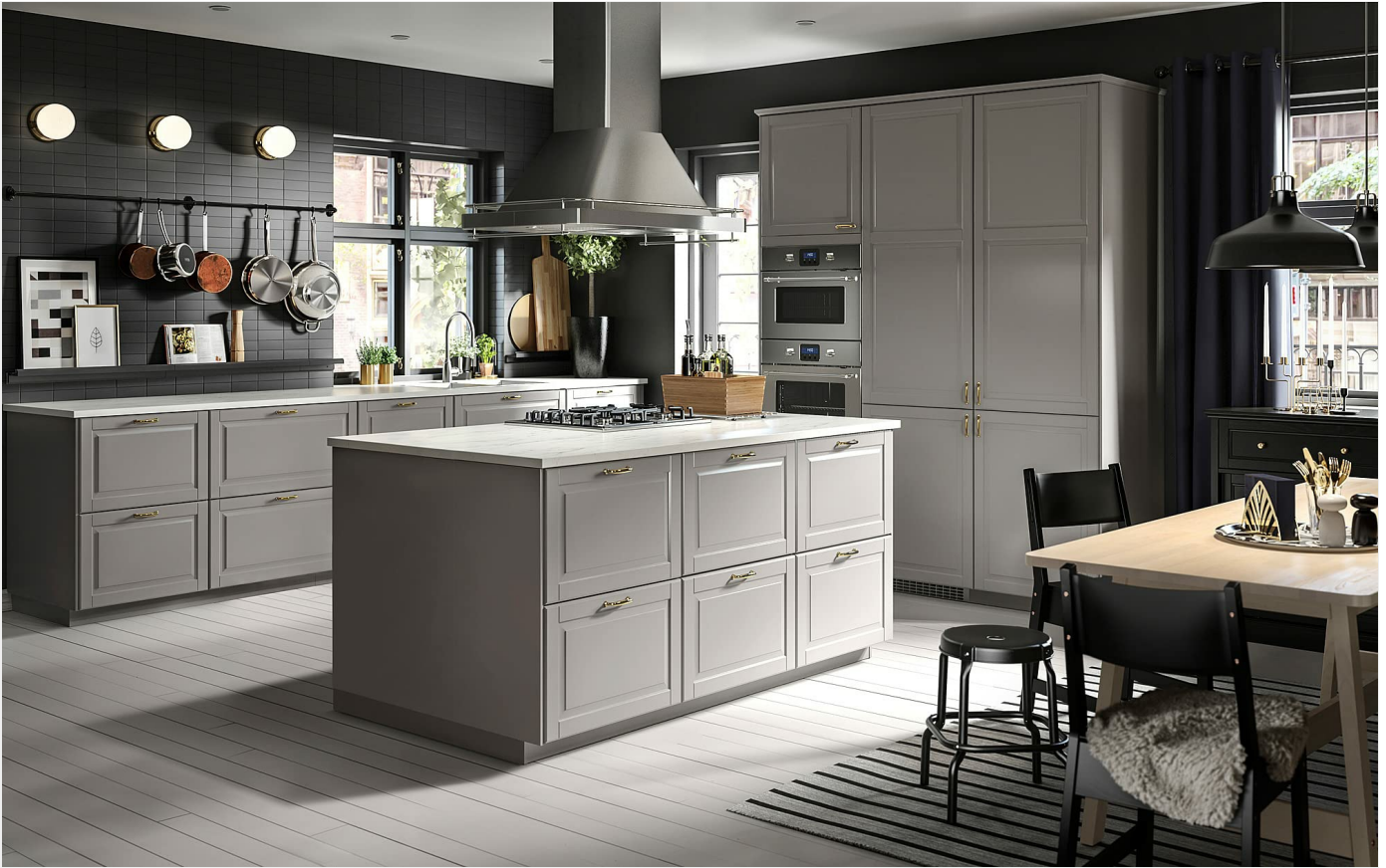
Image: An example of BOBBYN drawer fronts and cabinet doors installed in a contemporary kitchen setting, demonstrating their aesthetic appeal.

5. Install Handles/Knobs: If applicable, drill holes and install your chosen handles or knobs onto the drawer front.