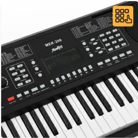
Image: The Moukey MEK-200 keyboard with a pair of headphones connected, indicating the private practice feature.

speakers will automatically mute. Connect a microphone to the MIC jack to sing along with your music.