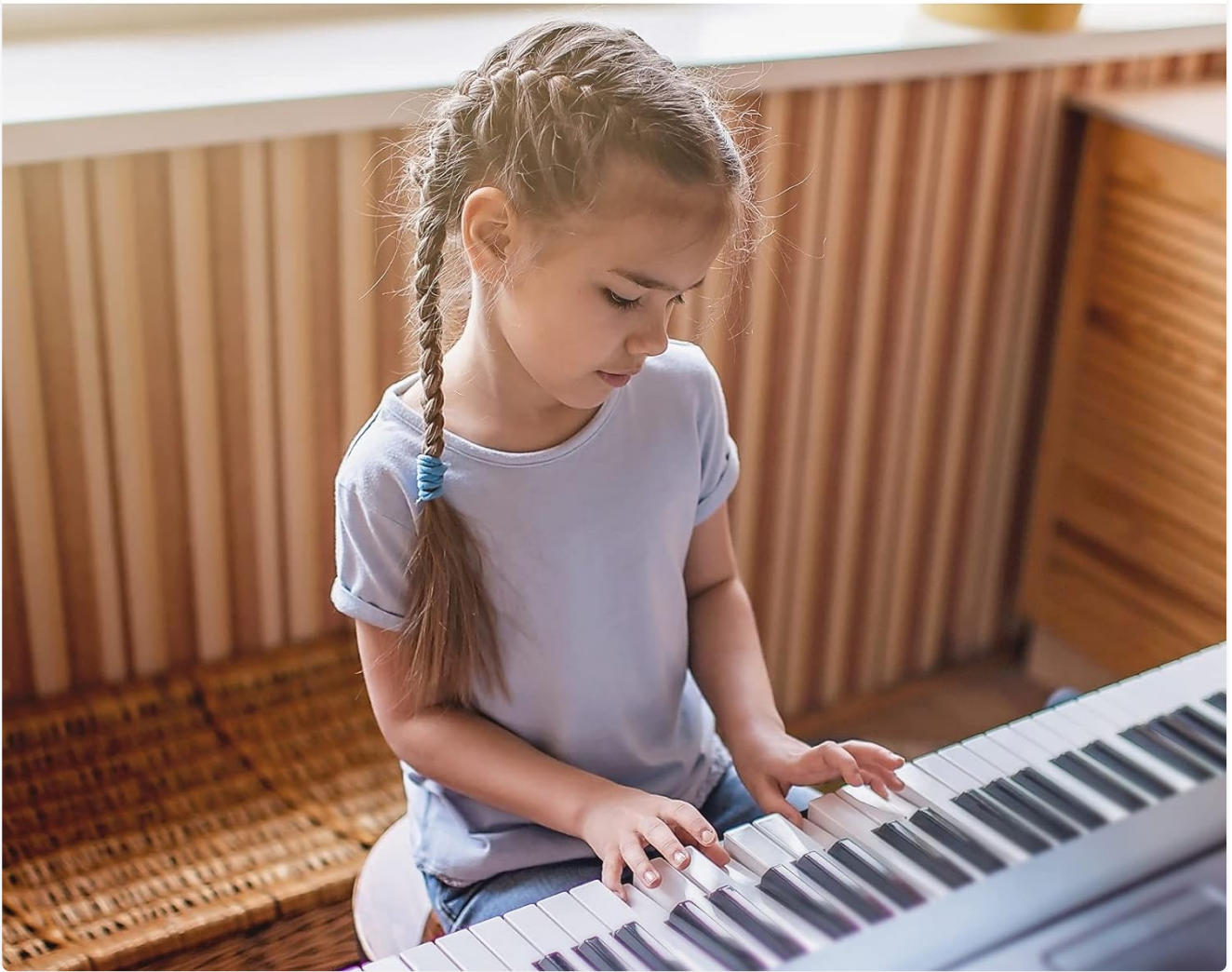
Image: A young child playing the Moukey MEK-200 keyboard, demonstrating the intelligent teaching mode feature.

Equipped with two elite teaching modes, perfect for beginners