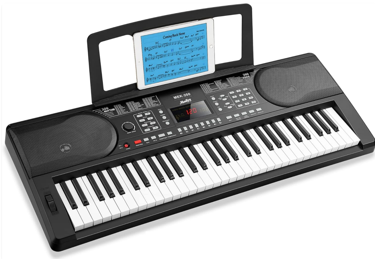
Image: The Moukey MEK-200 61-Key Electronic Piano Keyboard with a music stand holding a tablet displaying sheet music.

Thank you for choosing the Moukey MEK-200 61-Key Electronic Piano Keyboard. This versatile instrument is designed for beginners and experienced players alike, offering a rich array of features including 300 rhythms, 300 tones, 50 demo songs, and an intelligent teaching mode. This manual provides detailed instructions for setup, operation, maintenance, and troubleshooting to ensure you get the most out of your new keyboard.