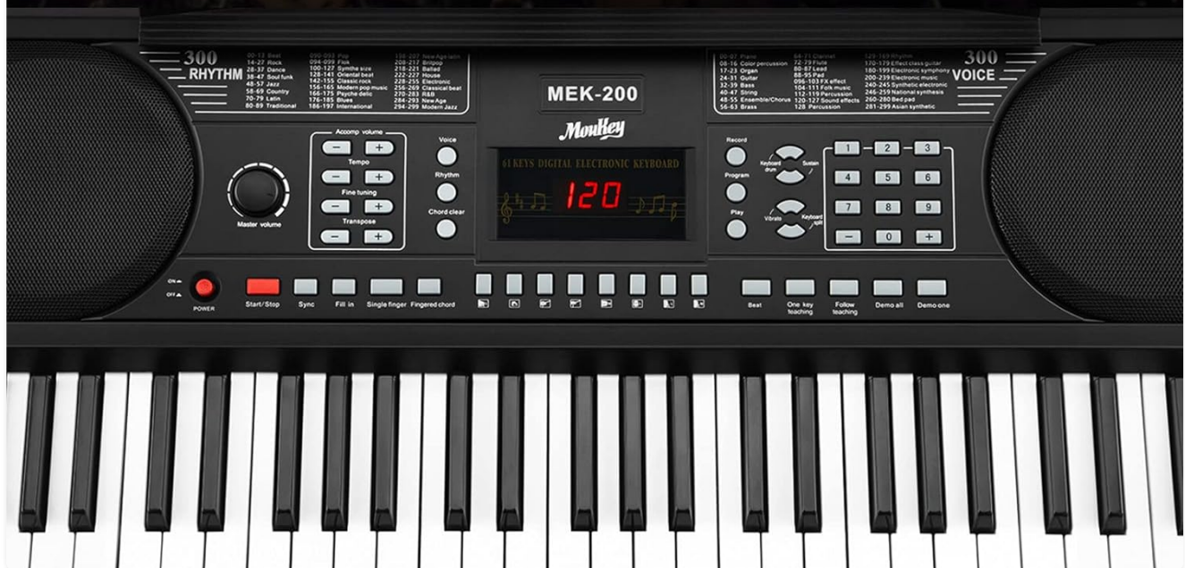
Image: A close-up of the Moukey MEK-200's control panel, emphasizing the sections for 300 rhythms, 300 voices (tones), 50 demo songs, and 8 percussion sounds.