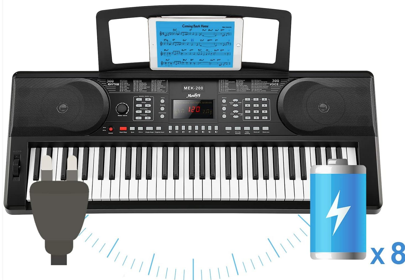
Image: The Moukey MEK-200 keyboard illustrating its dual power supply capabilities, showing both an AC power plug and a battery icon with 'x8' indicating the use of eight D-type batteries.

D-type Batteries Mode for outdoor activities, Power Supply Mode for indoor party performance