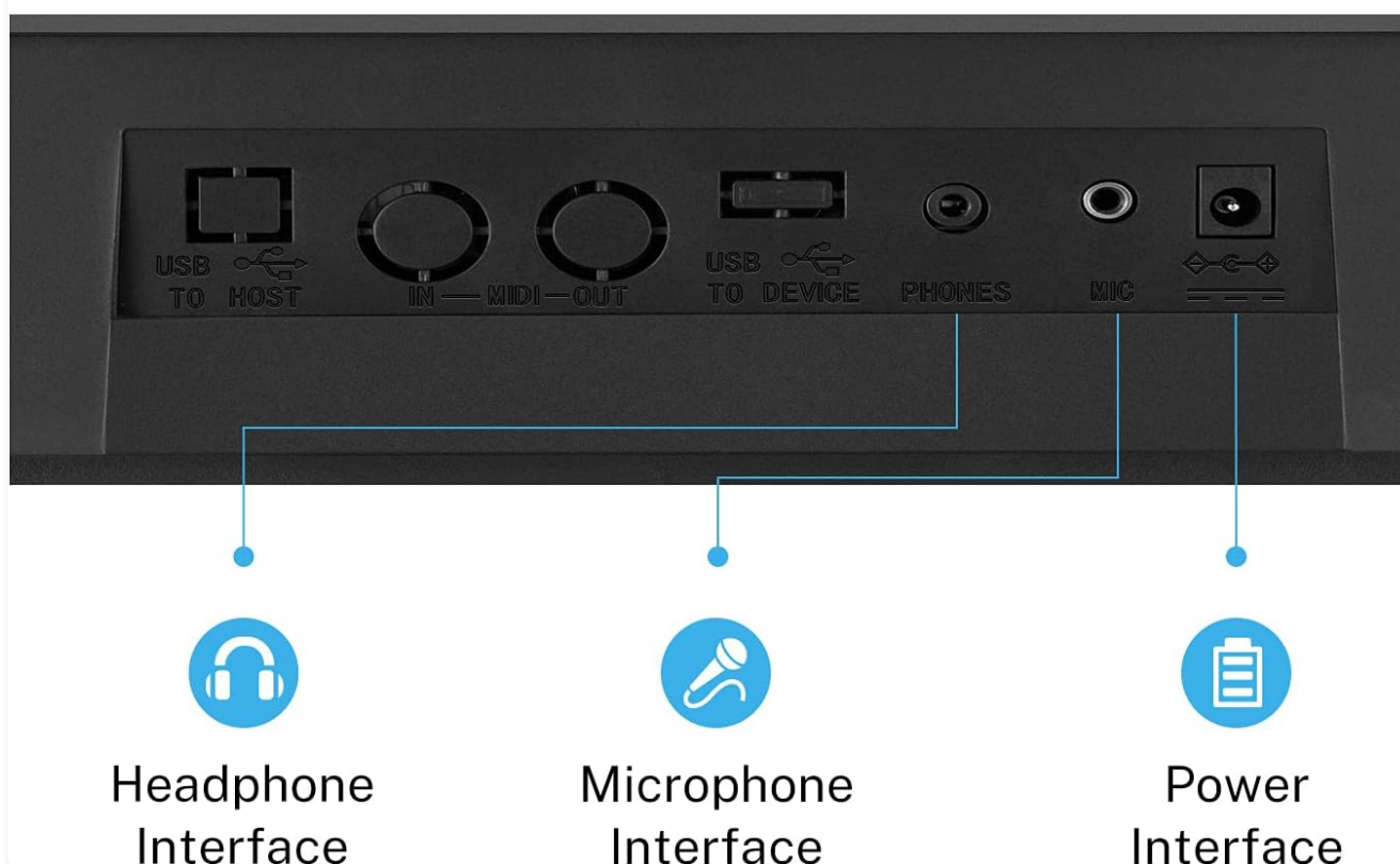
Image: A close-up view of the rear panel of the Moukey MEK-200, highlighting the headphone, microphone, and power input interfaces, along with USB and MIDI ports.