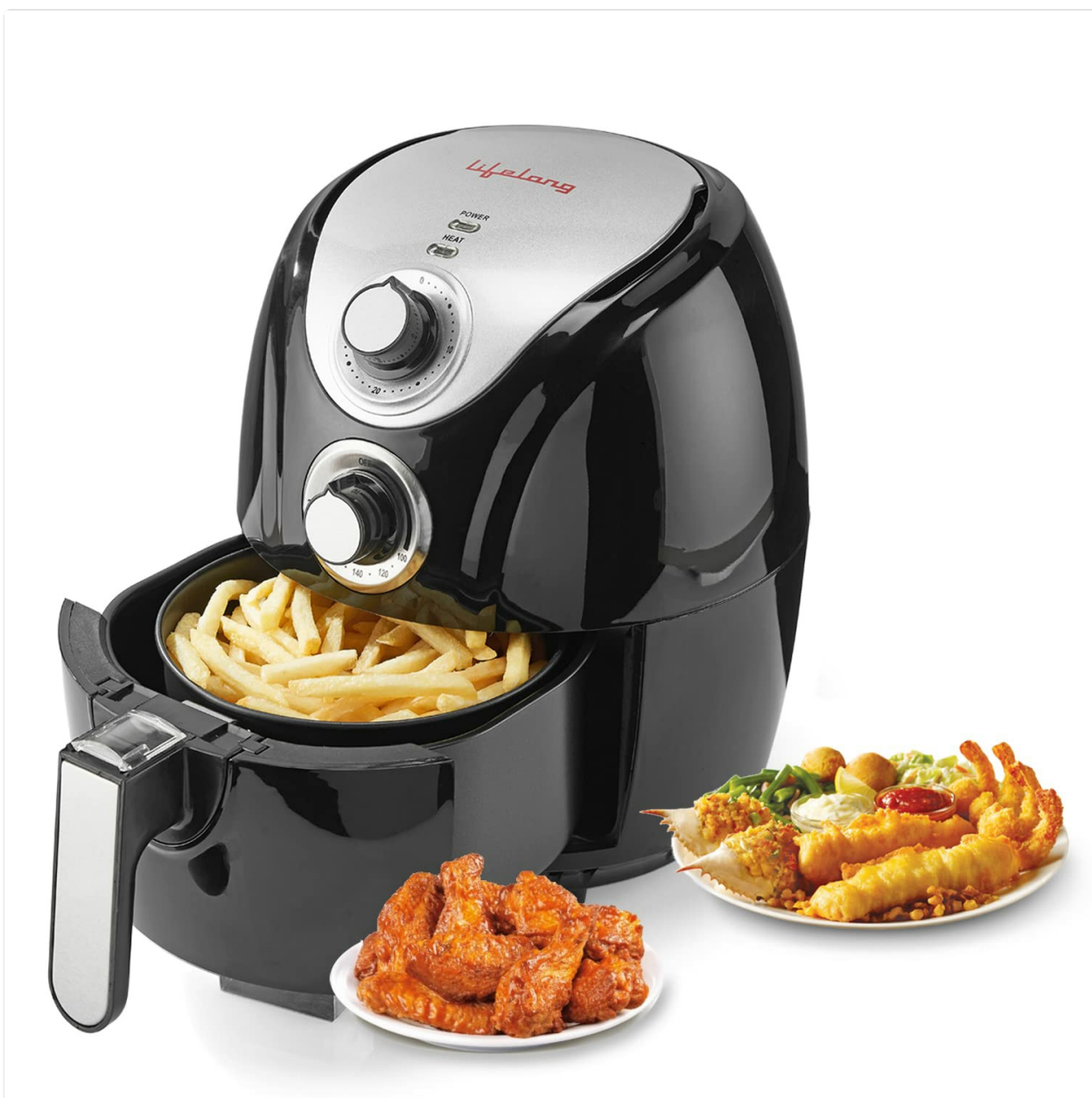
Image: The Lifelong LLHF21 HealthyFry Air Fryer, showcasing its main unit, handle, and food basket filled with fries, alongside plates of various air-fried dishes.