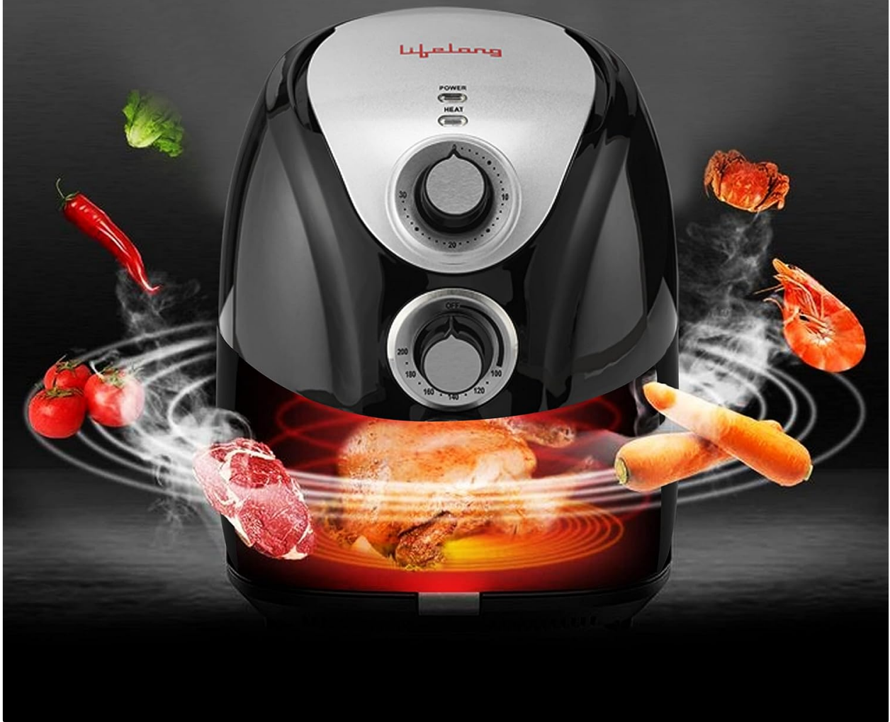
Image: An illustrative diagram demonstrating the 360-degree hot air circulation system within the air fryer, which ensures food is cooked thoroughly and evenly.