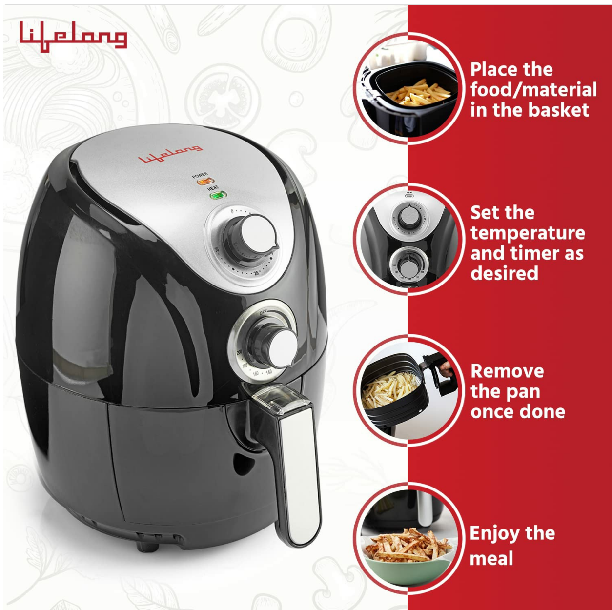
Image: Visual guide illustrating the simple four-step process for using the air fryer: placing food, setting controls, removing the pan, and serving the meal.