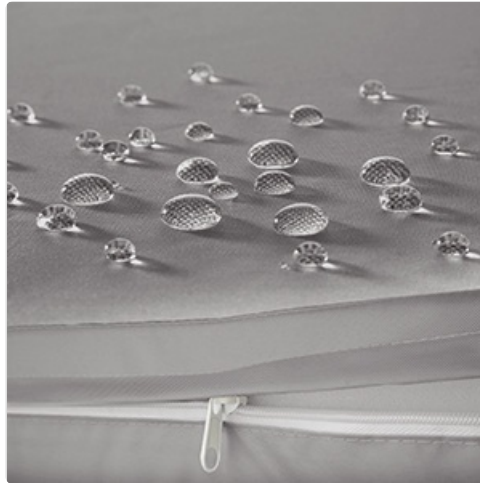
Image: Close-up of the water-resistant cushion fabric, showing water droplets beading on the surface and a zipper for easy removal.