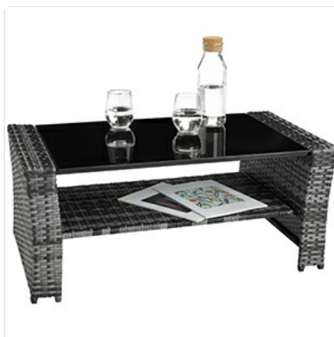
Image: The assembled coffee table with its glass top, suitable for drinks and small items.