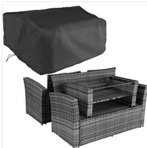
Image: The lounge set covered with its black protective cover, demonstrating protection against elements.