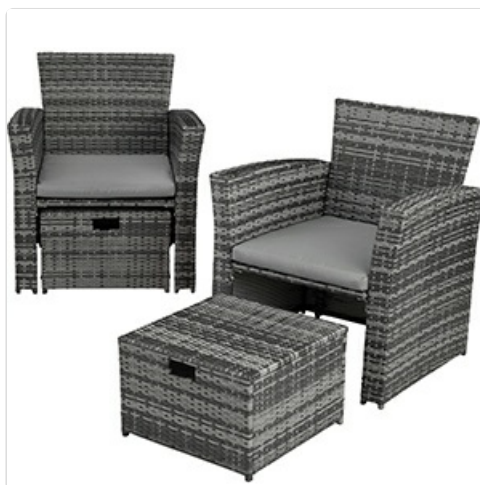
Image: Assembled armchairs and a stool, ready for use.