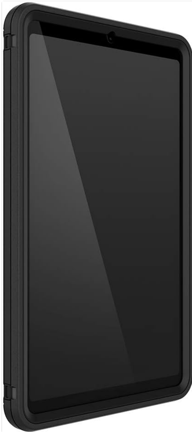
Figure 5: Side profile of the case with the tablet, demonstrating the slim yet protective design and accessible buttons.