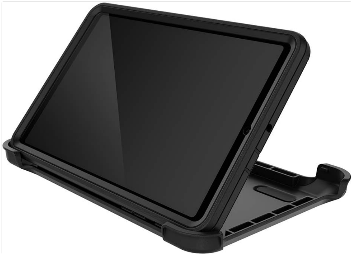
Figure 6: The OtterBox Defender Series case with its protective stand deployed, providing a stable viewing angle for the tablet.