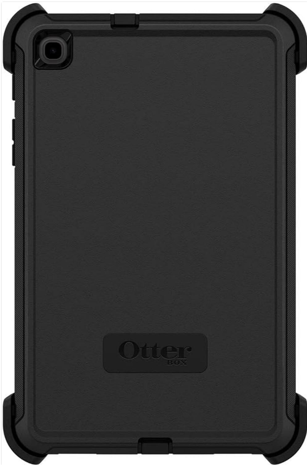
Figure 4: Back view of the case with the tablet, illustrating the precise cutouts for the camera and ports.