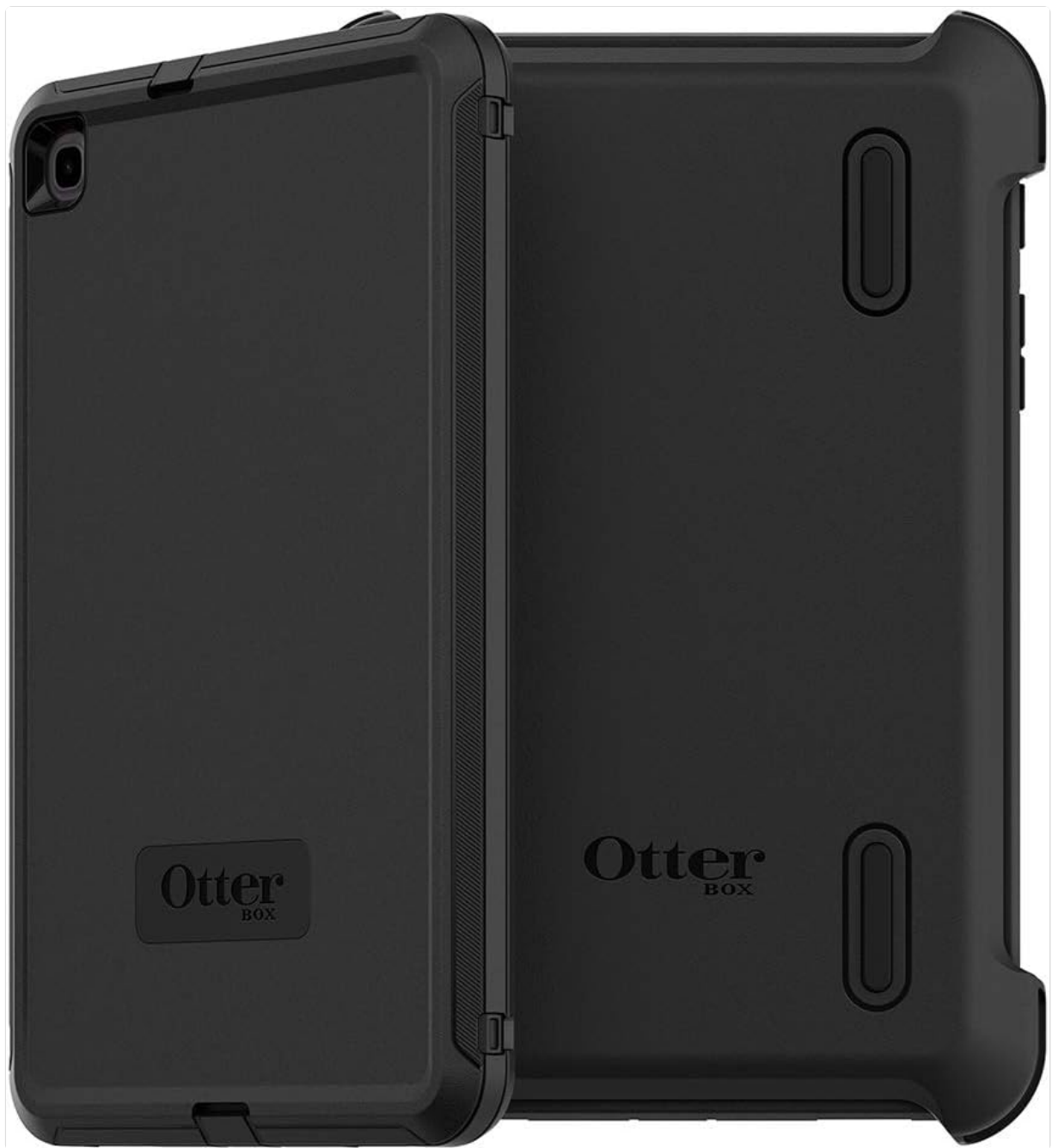
Figure 1: Front and back view of the OtterBox Defender Series case, showcasing its robust design.