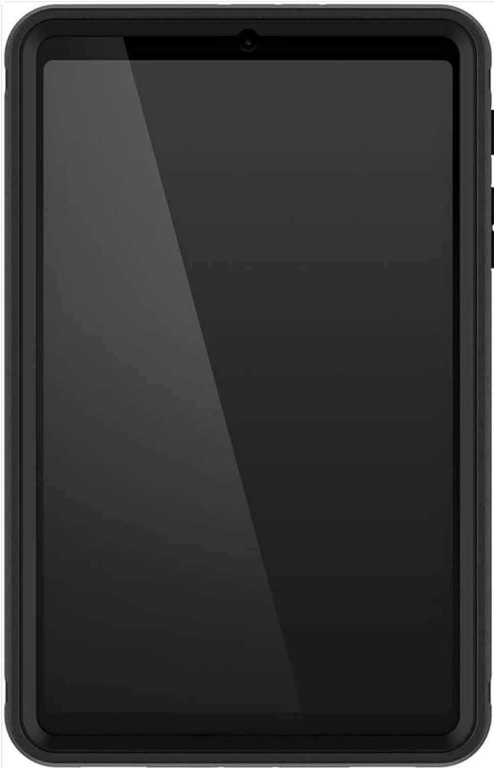
Figure 3: Front view of the case with a Samsung Galaxy Tab A 8.4 (2020) installed, showing the integrated screen protector.