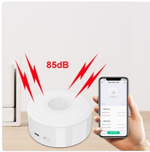
Image 3.4: The Siren Alarm provides instant push notifications when motion is detected, with an alarm volume up to 85dB.