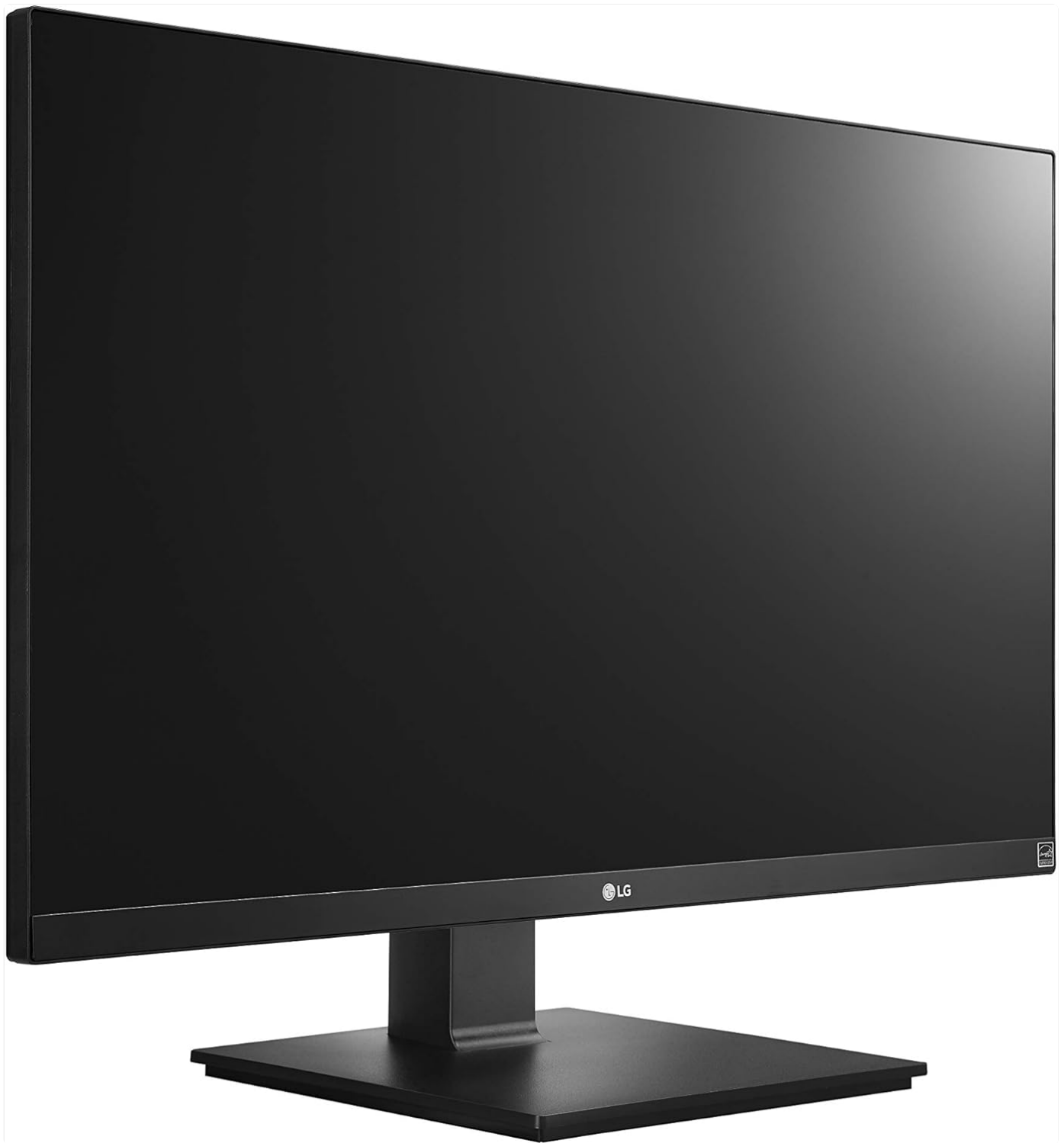
Figure 2: Assembled LG 27UK670-B monitor.