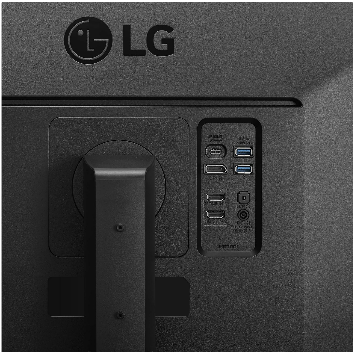
Figure 3: Rear view of the monitor with port connections.