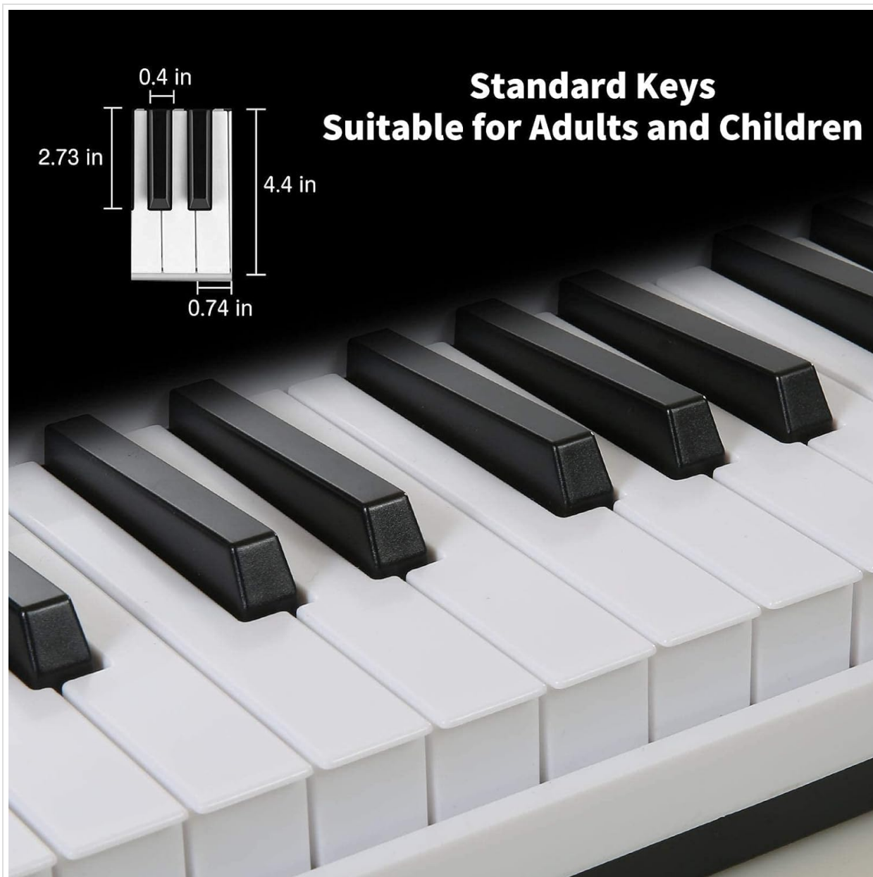
Figure 3.4: This image displays the dimensions of the standard keys, indicating suitability for both adults and children.