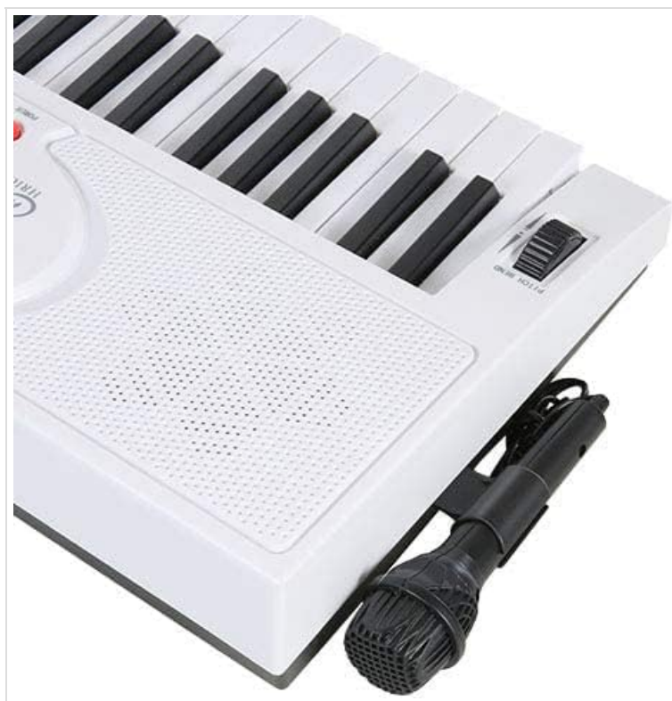
Figure 3.6: The included microphone connected to the side input of the electronic keyboard.