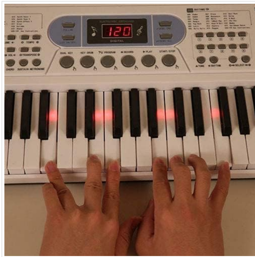
Figure 7.5.2: A user's hands positioned over the lighted keys, demonstrating interaction with the teaching mode.