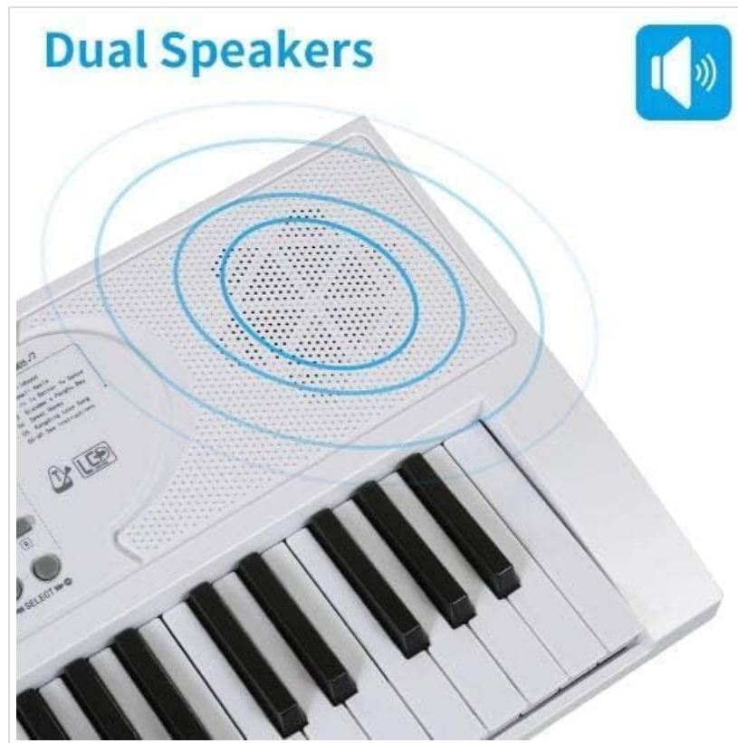
Figure 3.5: The keyboard features dual speakers for clear audio output, as indicated by the sound wave graphic.