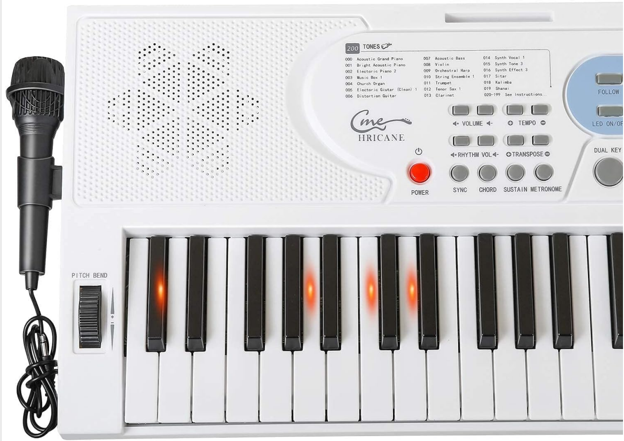
Figure 7.5.1: The keyboard displaying lighted keys in teaching mode, guiding the user on which notes to play.

follow along as keys light up in teaching mode and play your way to proficiency.