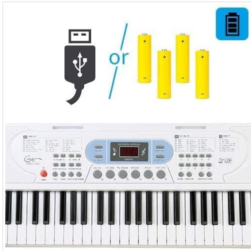
Figure 5.1: Illustration of the two power supply methods: USB connection or batteries.