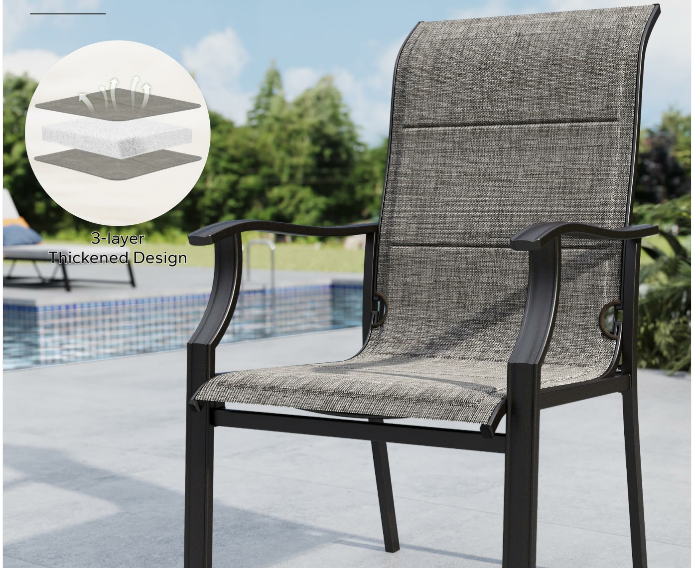
Image: Close-up view of the chair's seat, illustrating the luxurious padding and 3-layer thickened design for enhanced comfort.