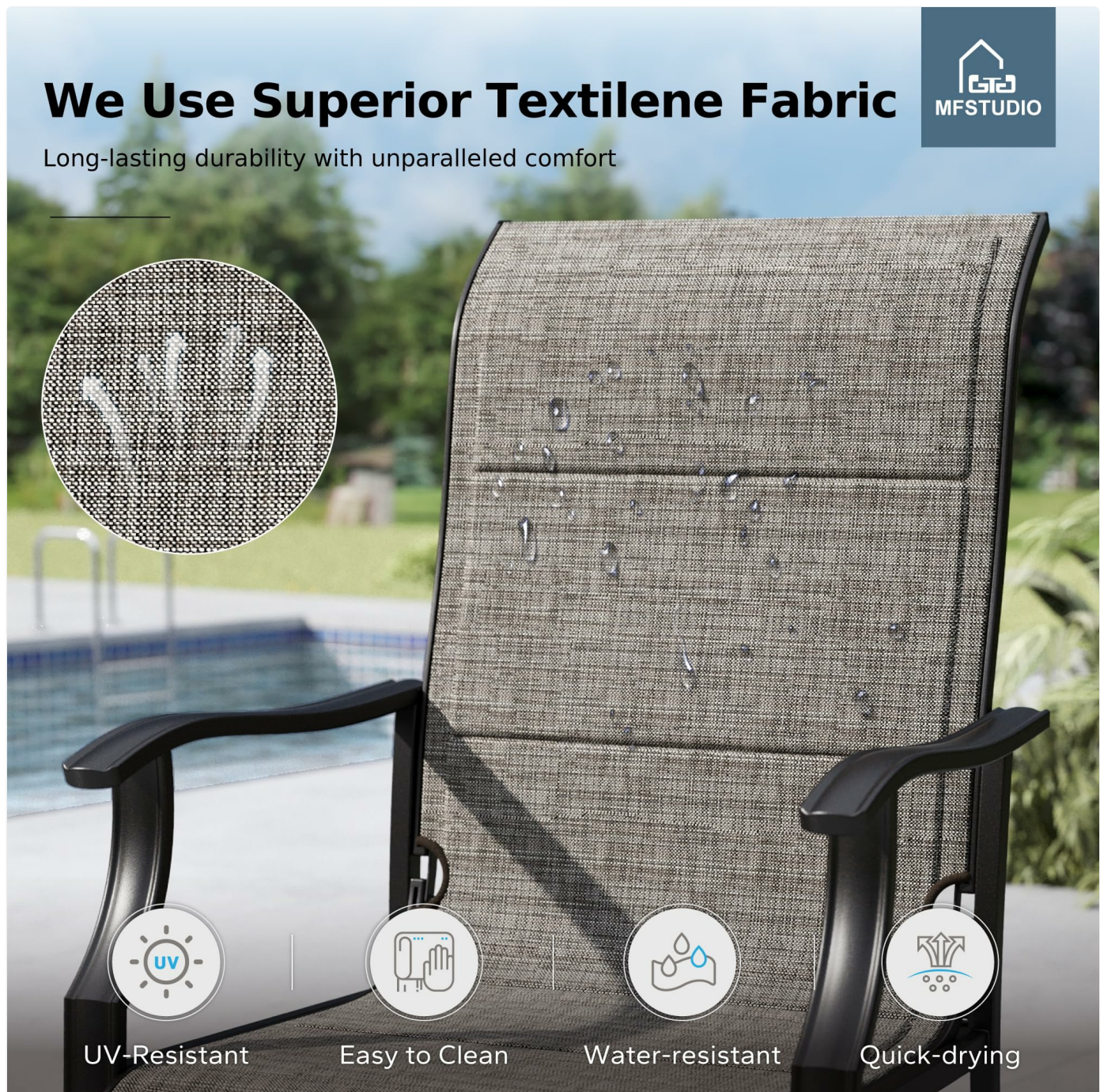
Image: Close-up of the superior Textilene fabric, demonstrating its water-resistant properties with visible water droplets, and highlighting its UV-resistant, easy-to-clean, and quick-drying features.