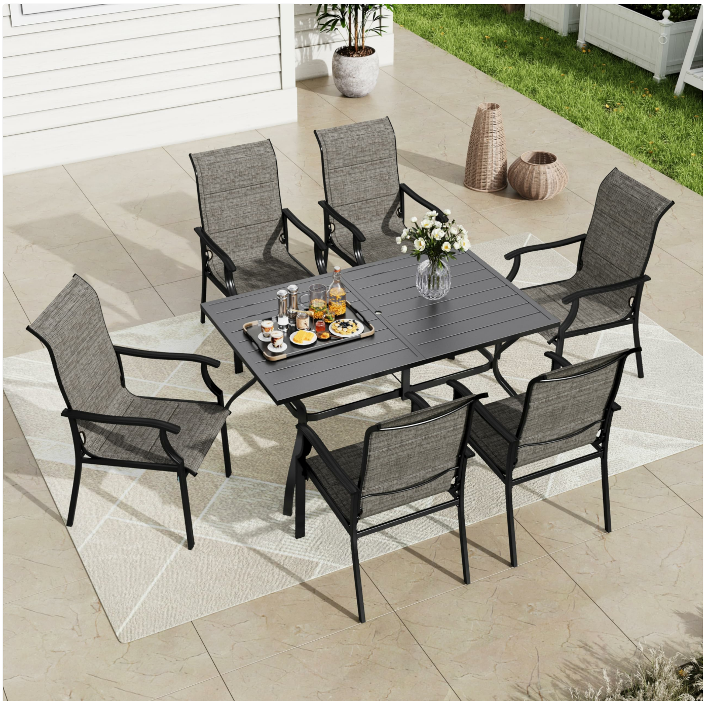
Image: The complete MFSTUDIO 7-Piece Patio Dining Set, featuring a rectangular table and six chairs, arranged on an outdoor patio.