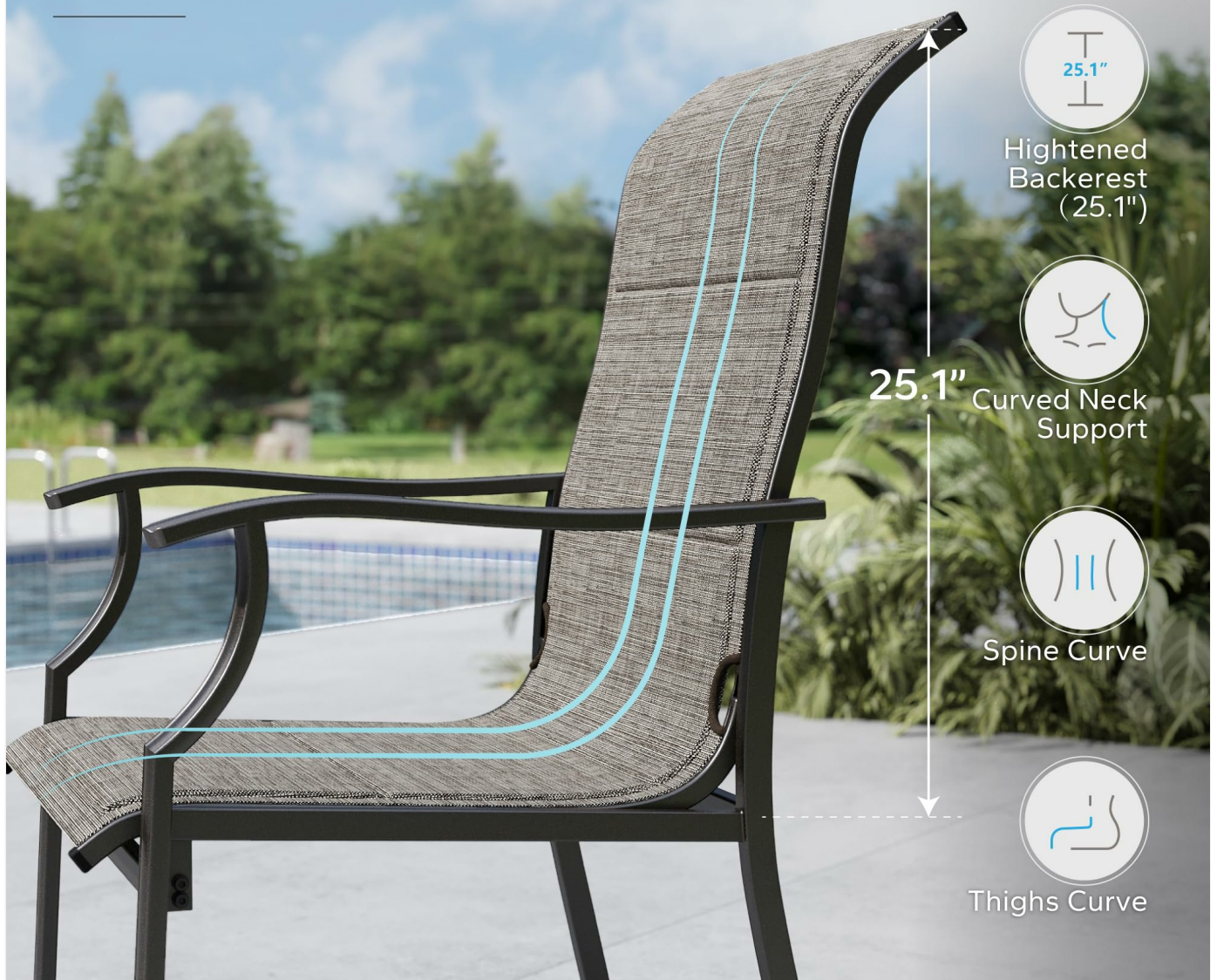
Image: Detail of the chair's ergonomic high back design, highlighting its 25.1-inch heightened backrest and curved support for comfort.