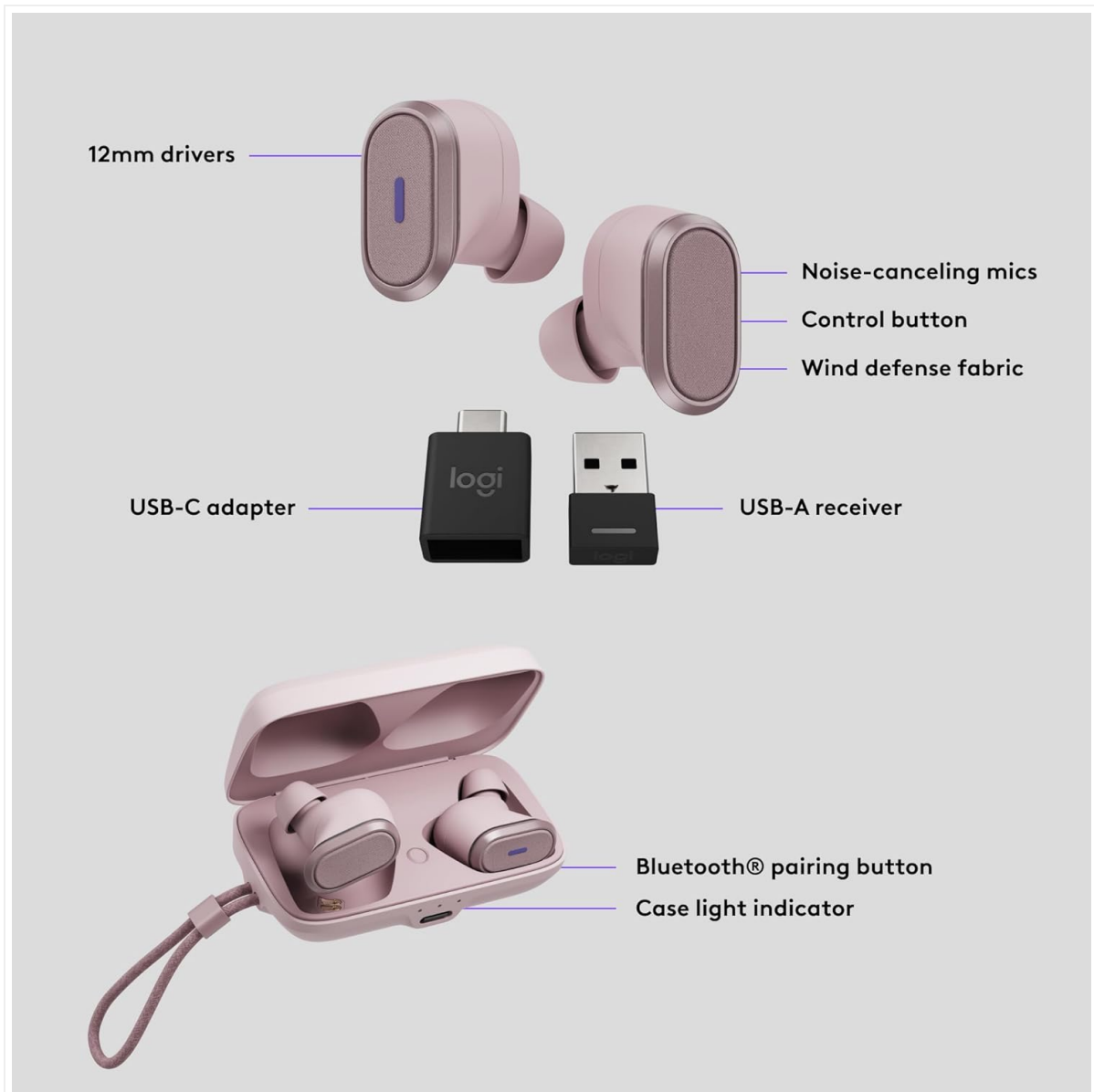
Figure 4: Experience immersive audio with Hybrid ANC.