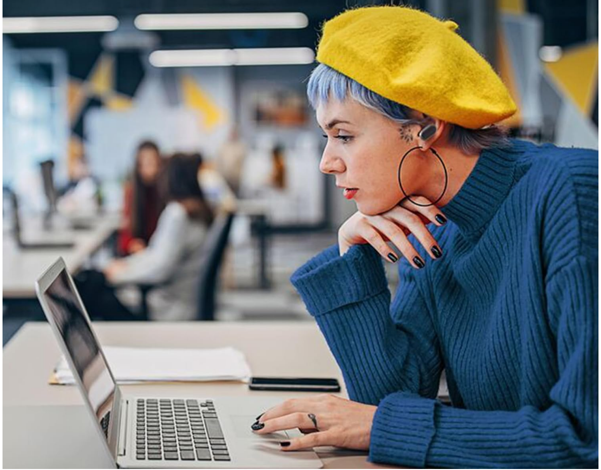
Figure 5: Crystal clear voice for professional calls.