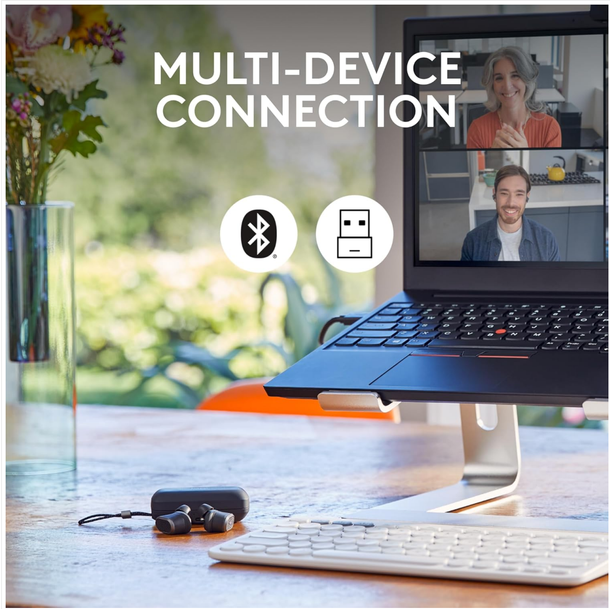
Figure 1: Included components of the Logitech Zone True Wireless Earbuds.