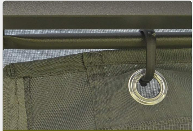
Plastic Pull Ring for conveniently fixing the curtains onto the frame