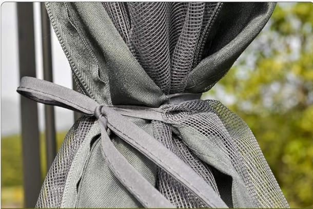
Curtain Straps tie to the curtain easily