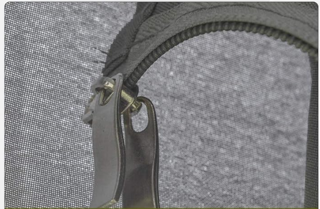
Double-sided Zipper easy to access

A detailed view of the gazebo's corner frame, featuring a built-in triangular shelf for decorative items or small storage.