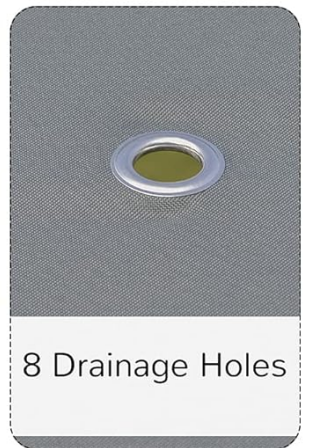
8 Drainage Holes