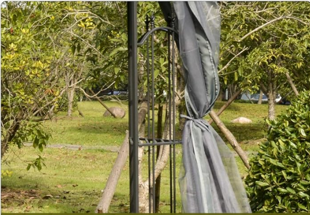
Mesh Side Walls provide good ventilation