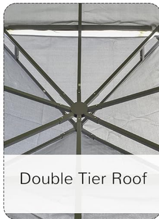
Double Tier Roof