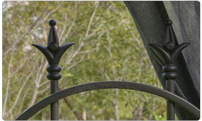
Novel Arrow-shaped Design beautiful and unique appearance