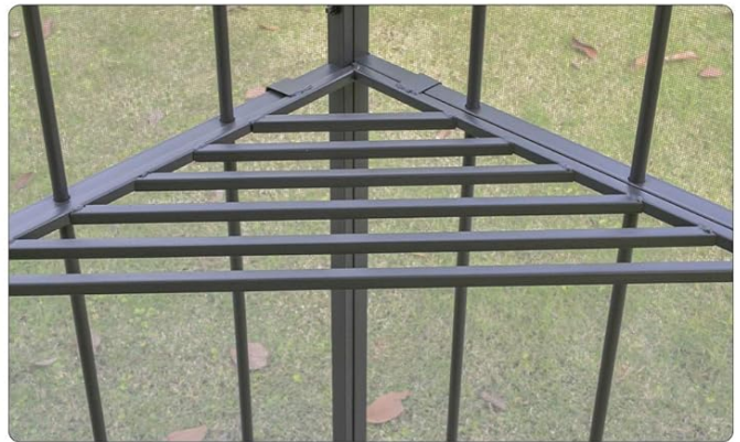
Triangular Storage Shelf for adding stability and convenience

This image illustrates the functionality of the mesh sidewalls, including the plastic pull rings for securing curtains, the curtain straps for tying them back, and the double-sided zipper for easy access.