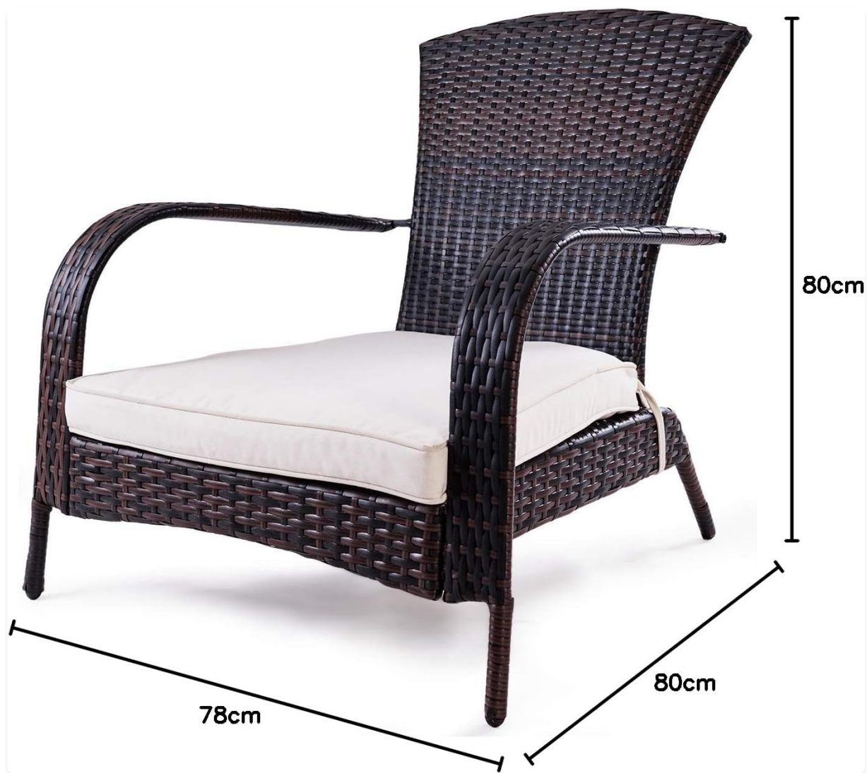
Image: Front-side view of the DREAMADE Rattan Garden Armchair with its removable cushion. This image showcases the overall design and the rich brown rattan weave.