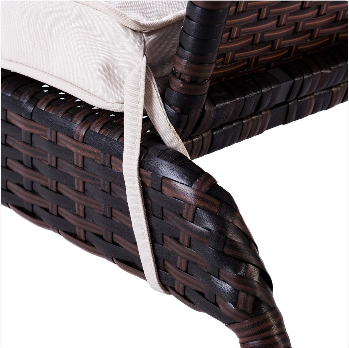
Image: Detail of the cushion tie, showing how it secures the removable cushion to the armchair frame for stability and comfort.

After assembly, gently test the armchair for stability before full use.