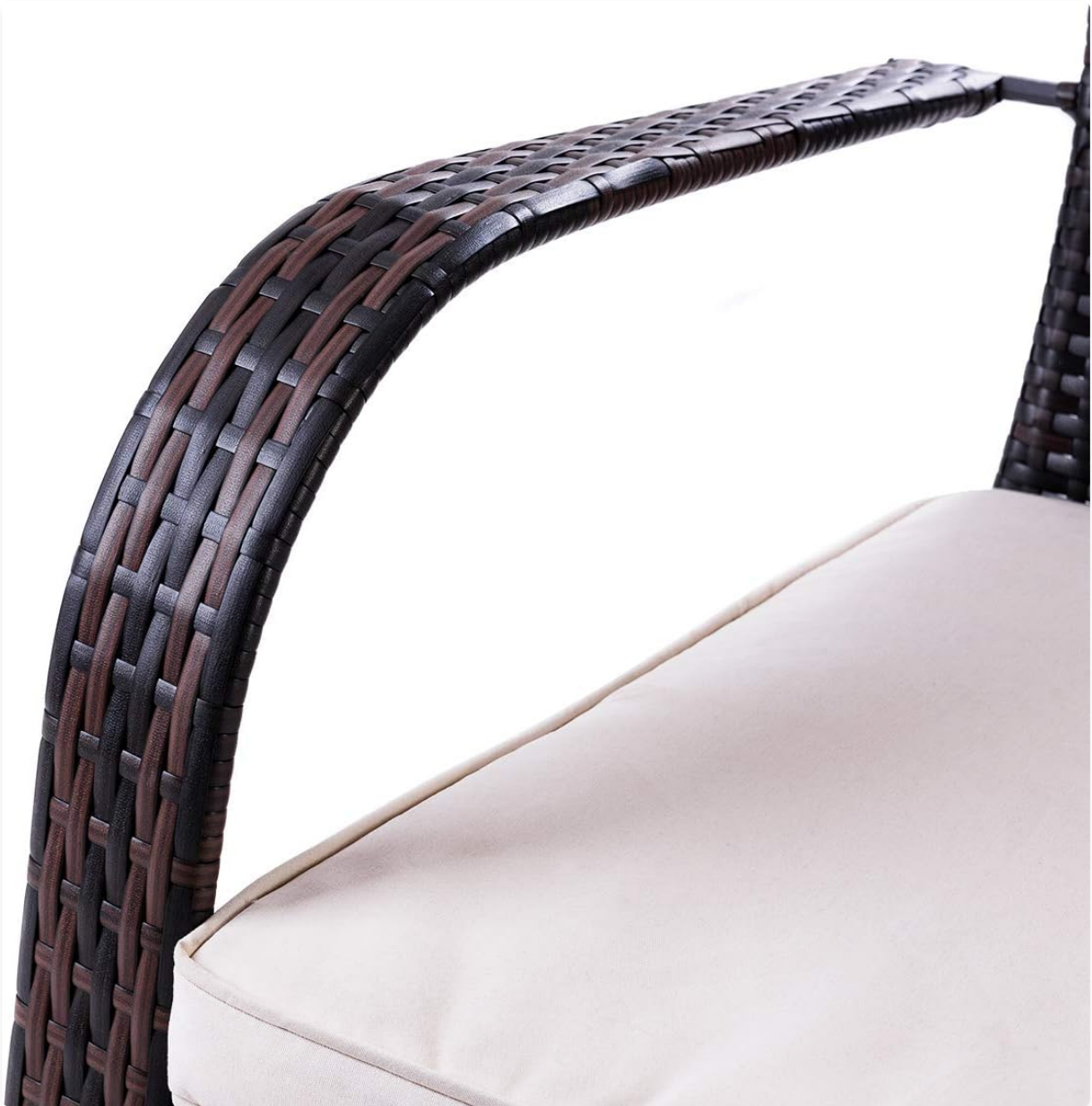
Image: A close-up view of the armchair's curved armrest, showcasing the smooth finish and comfortable design for arm support.