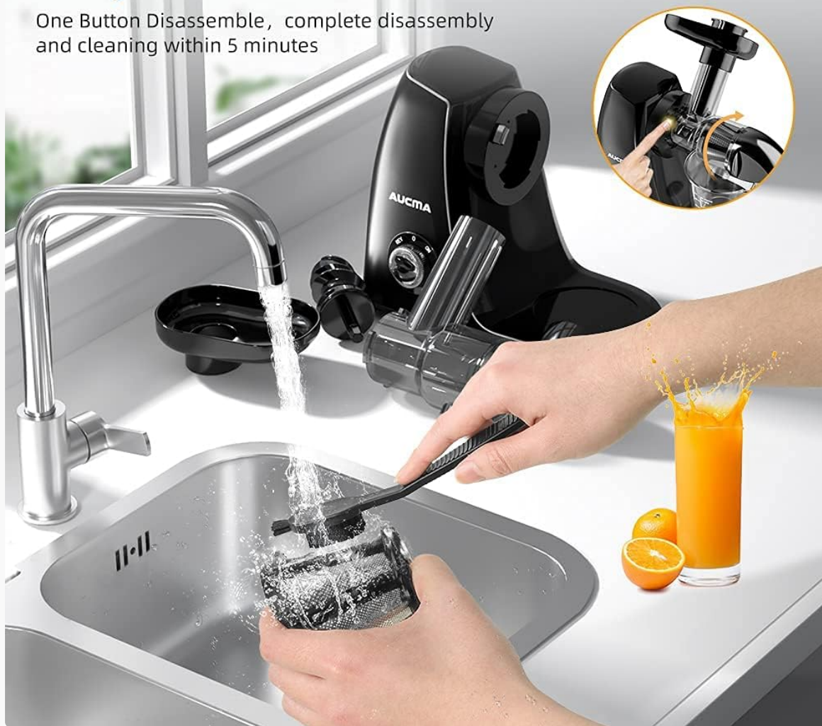
Image: Easy disassembly and cleaning with the included brush ensures hygiene and extends product life.

One Button Disassemble, complete disassembly and cleaning within 5 minutes