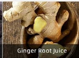
Ginger Root Juice

Image: The Aucma Juicer is capable of extracting juice from a wide variety of soft and hard fruits and vegetables.