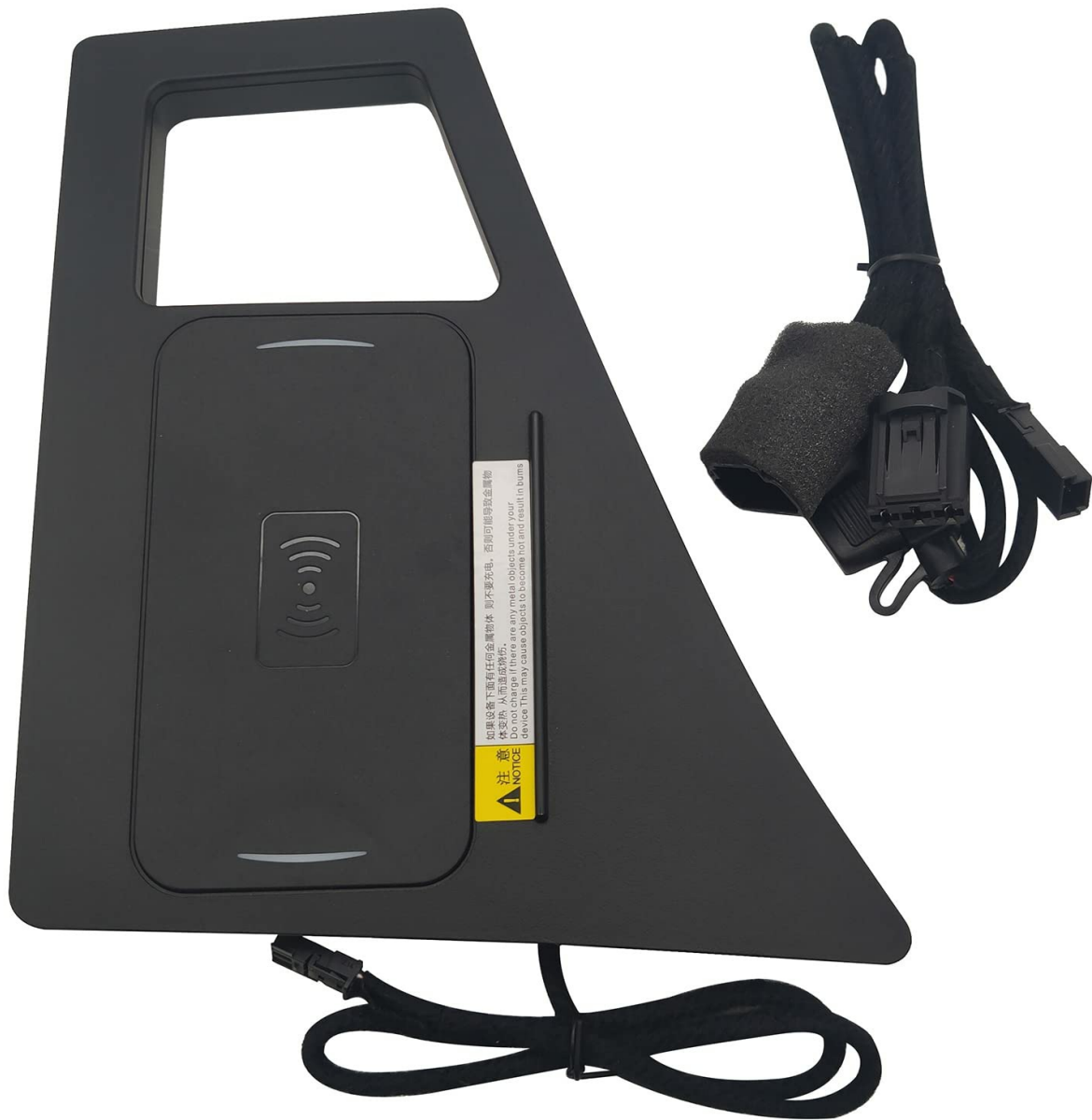
Figure 1: ASVEGEN Wireless Charger and Installation Area

The image displays the ASVEGEN wireless charger unit alongside an illustration of its designated installation spot within the Audi Q7's center console. The charger is a black, custom-fit mat with a wireless charging symbol, and a cable for power connection. The installation area is highlighted in red, indicating where the charger will be integrated.