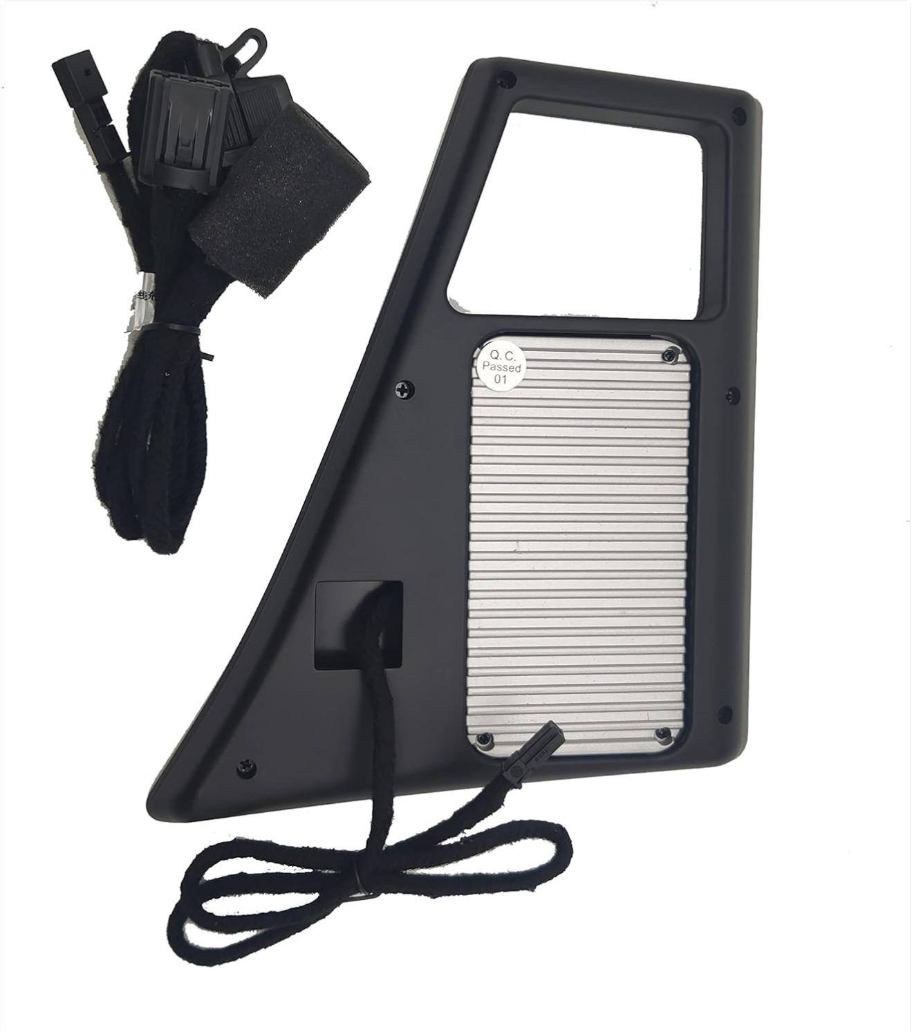
Figure 3: Charger Wiring

11. Reassemble: Put all removed components back in place, ensuring they are securely fastened.