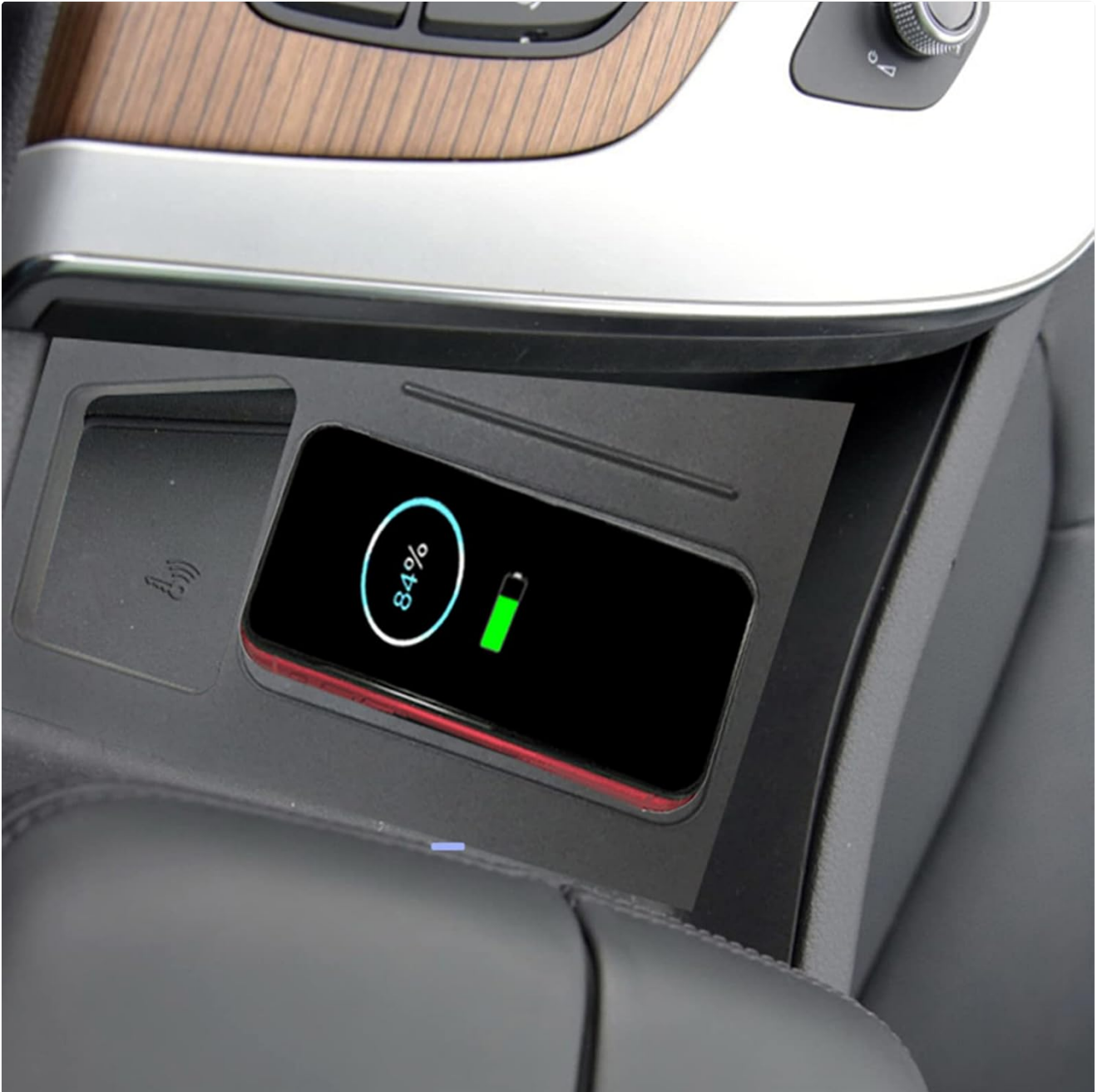
Figure 4: Phone Charging in Console

The image shows a smartphone placed on the ASVEGEN wireless charger, which is seamlessly integrated into the Audi Q7's center console. The phone's screen displays a charging icon and battery percentage, indicating active wireless charging.