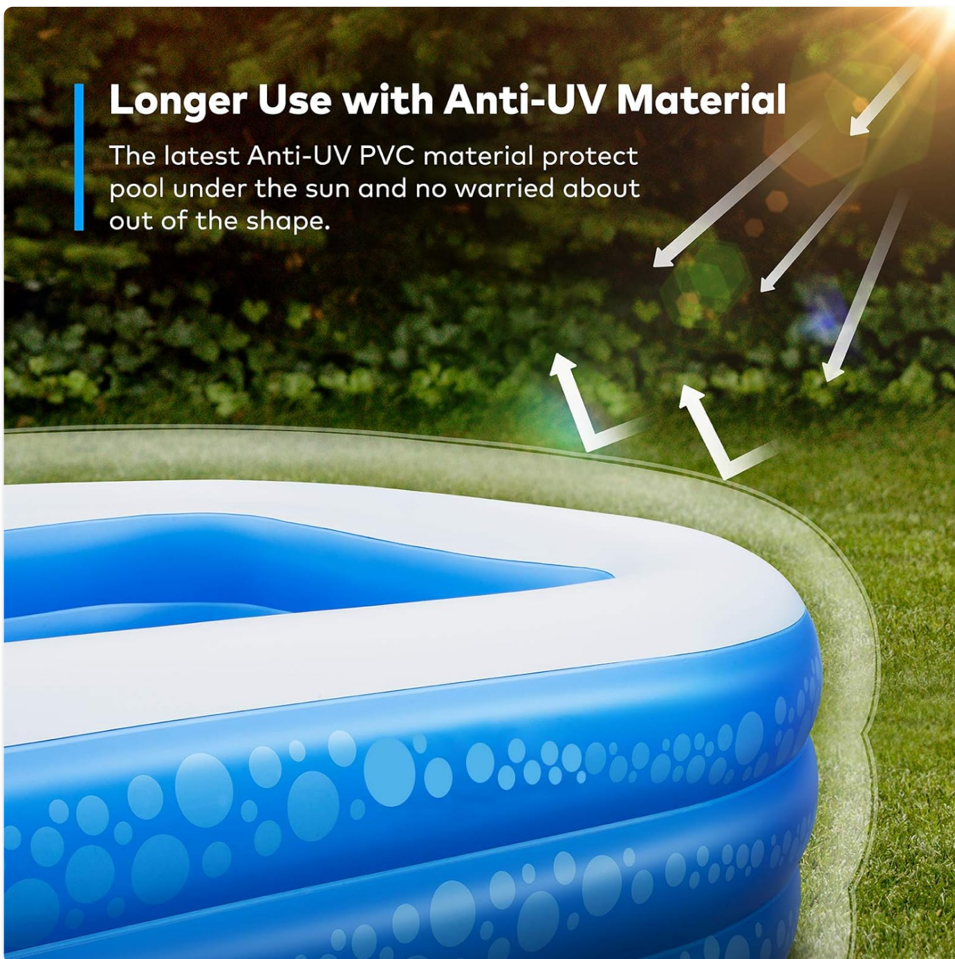
Image: A close-up of the pool's edge on grass, highlighting the anti-UV PVC material designed to protect the pool from sun damage and maintain its shape.

The latest Anti-UV PVC material protect pool under the sun and no worried about out of the shape.