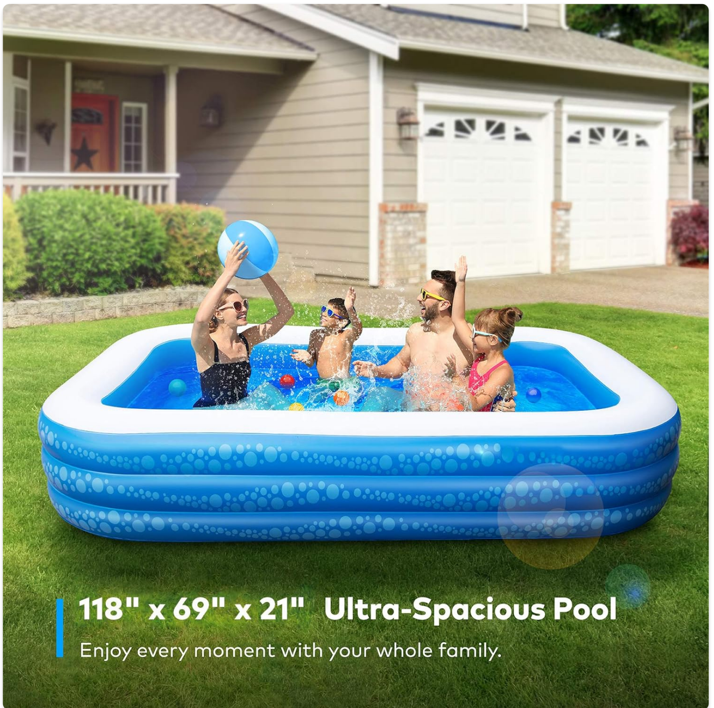
Image: A family, including two adults and two children, enjoying the large inflatable swimming pool in a backyard setting.