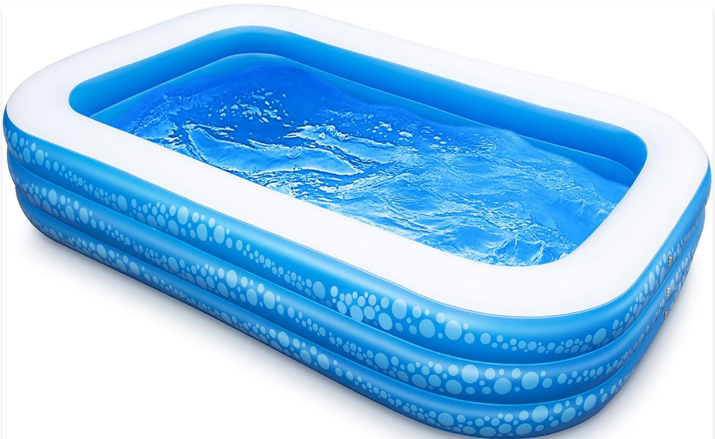
Image: The Hesung Portable Inflatable Swimming Pool, a large rectangular blue and white pool filled with clear water, ready for use.

Thank you for choosing the Hesung Portable Inflatable Swimming Pool. This manual provides essential information for the safe and efficient use, setup, maintenance, and troubleshooting of your new pool. Please read all instructions carefully before assembly and use to ensure a safe and enjoyable experience for all users.