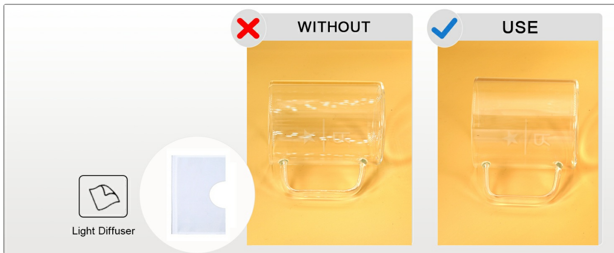
Figure 4.4: Effect of the light diffuser on reducing reflections on transparent objects.