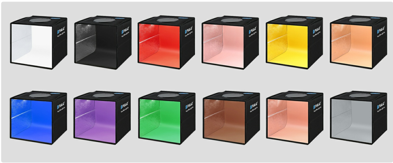
Figure 4.2: Various backdrop colors available for different photography scenes.