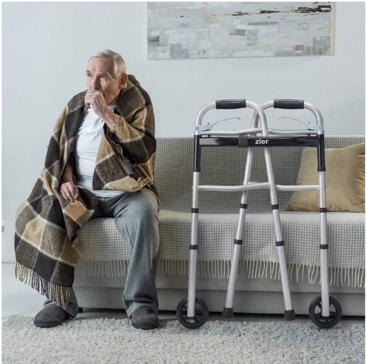
The walker folds compactly for convenient storage when not in use, such as beside a couch.