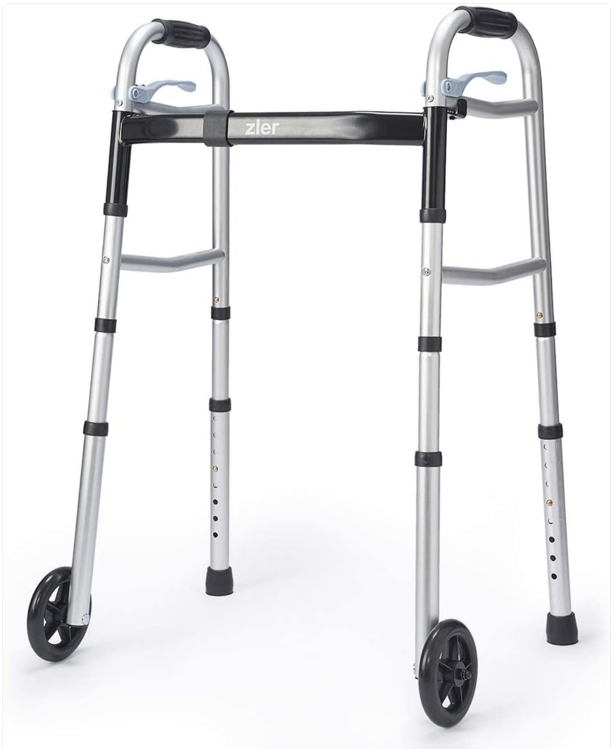
An overview of the Zler Narrow Folding Walker, showcasing its main structure and components.