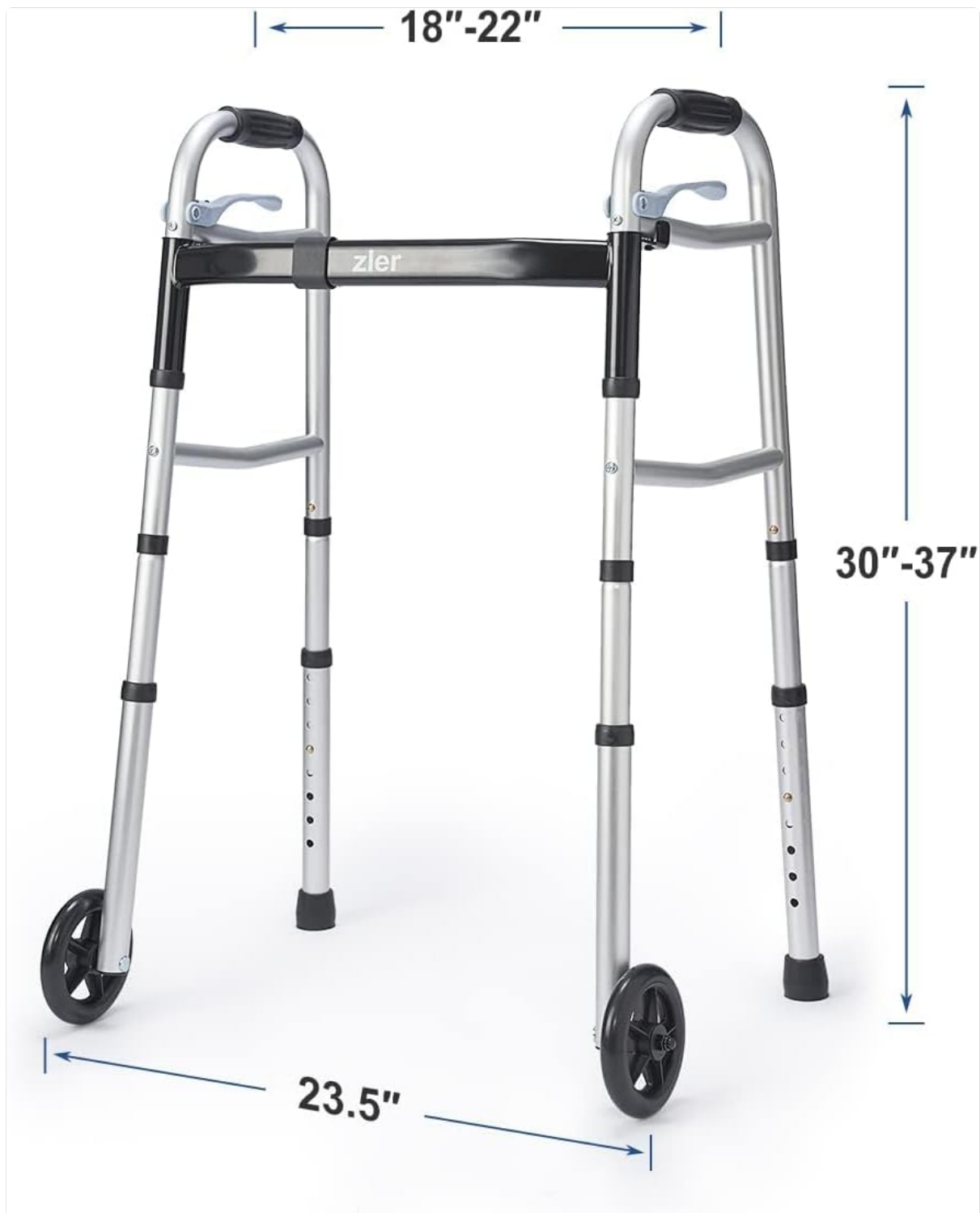
Detailed dimensions of the Zler Narrow Folding Walker, including adjustable width and height ranges.