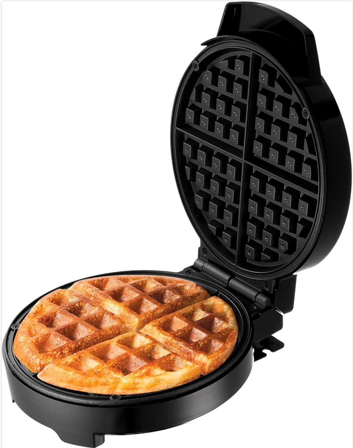
Image: The Lumme Electric Waffle Maker shown open with a cooked waffle, alongside a plate of waffles with fruit and syrup.

The Lumme Electric Waffle Maker is designed for convenient and efficient preparation of individual waffles, paninis, and hash browns. Its non-stick cooking plates ensure easy food release and simple cleaning.