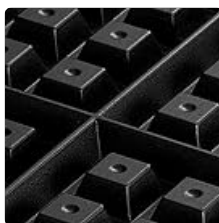
Image: A detailed view of the Lumme Waffle Maker's non-stick cooking plates, emphasizing their design for easy cleaning.