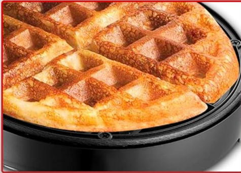
Easy to use