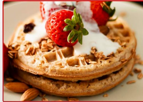
Perfect waffles every single time

Image: A close-up view of the Lumme Waffle Maker's top surface, highlighting the power and ready indicator lights and the Lumme brand logo.