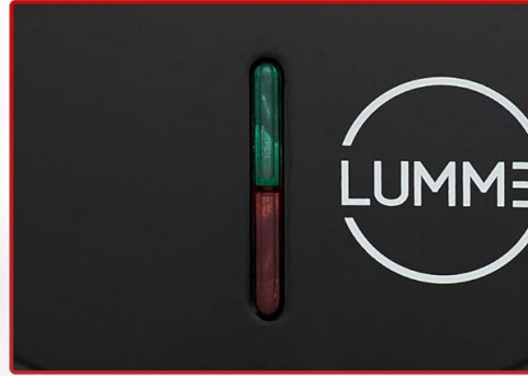
Convenient power and ready light indicators