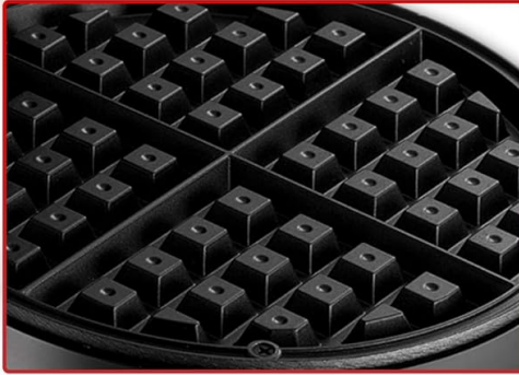
Extra deep non-stick coating plates