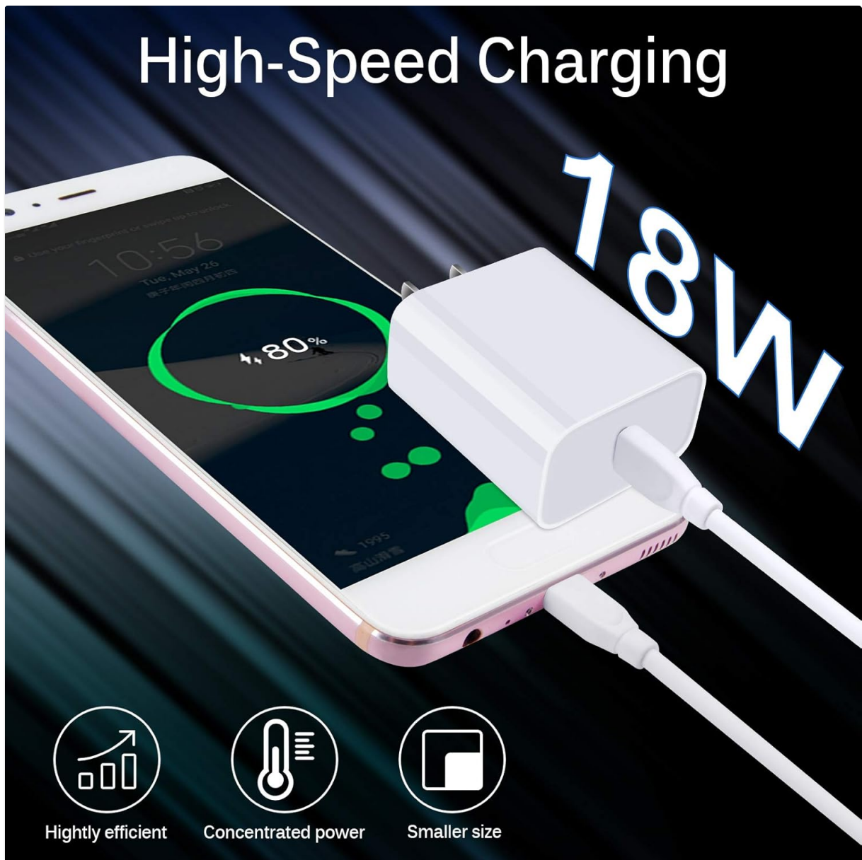
Figure 4: High-Speed Charging

This image highlights the 18W power output for high-speed charging, emphasizing its efficiency, concentrated power delivery, and smaller size.