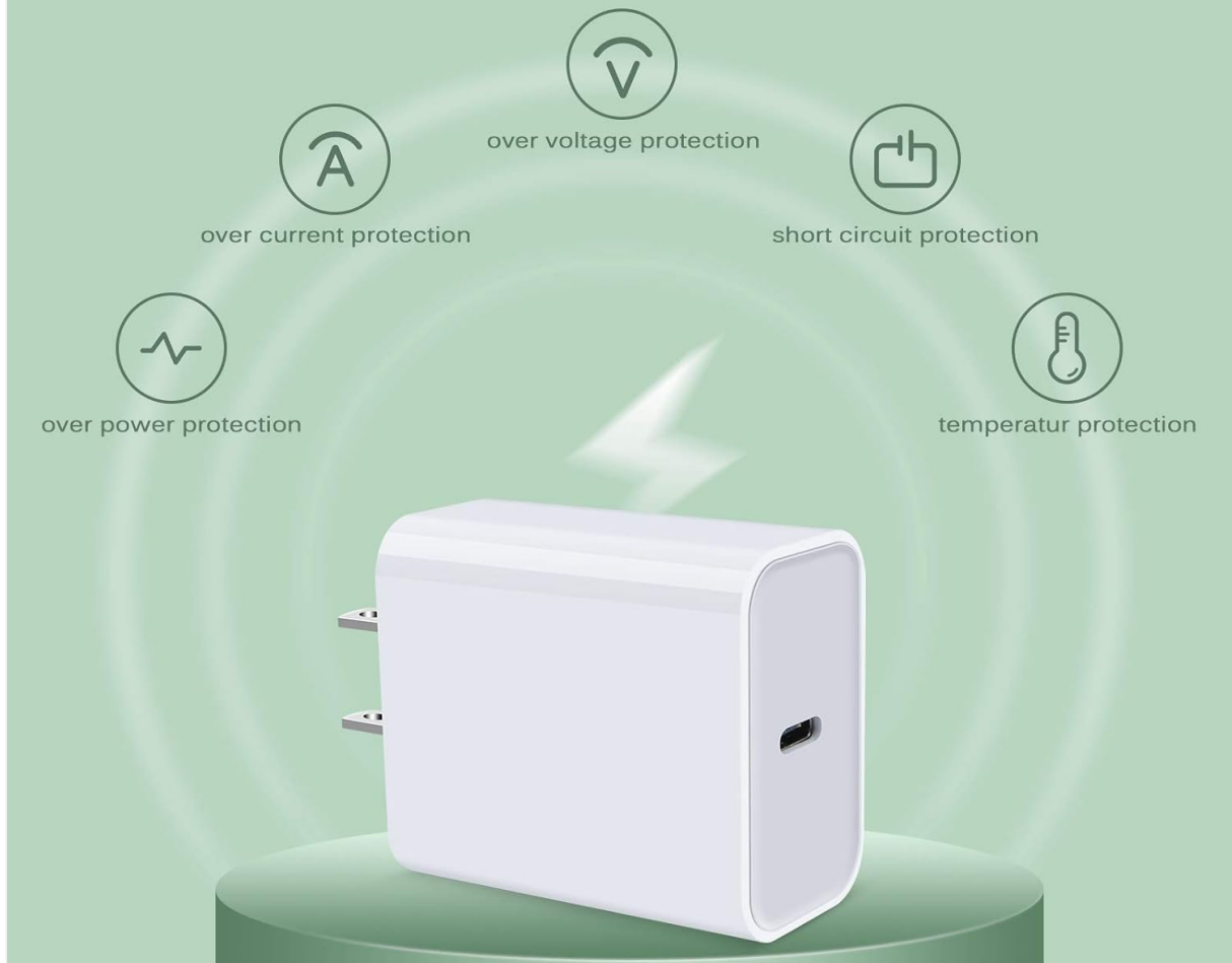
Figure 5: Intelligent Control Protections

This image illustrates the intelligent control features of the charger, including protection against over voltage, over current, short circuit, over power, and temperature fluctuations, all designed to prevent overcharging and ensure device safety.