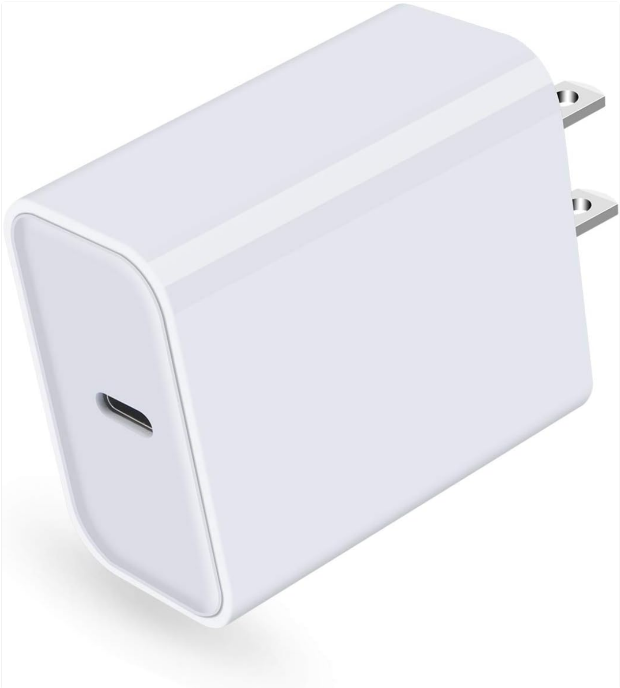
Figure 1: REPIND 18W USB C Wall Charger (Ivory White)

This image displays the compact and sleek design of the REPIND 18W USB C Wall Charger in Ivory White, highlighting its single USB-C output port and standard US plug prongs.