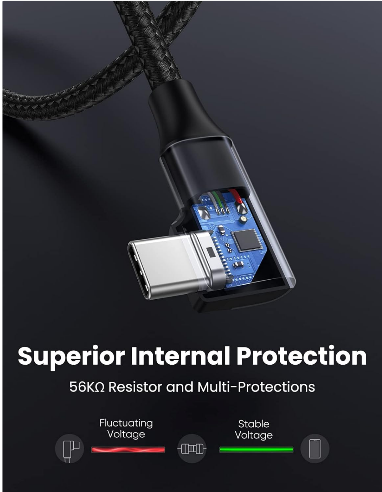
Figure 6.1: Superior internal protection for stable voltage.

The UGREEN USB A to USB C 3.0 Right Angle Cable is designed with safety in mind. It features superior internal protection, including a 56K \Omega resistor and multi-protections against fluctuating voltage, ensuring stable and safe charging for your devices. The cable is UL certified, meeting recognized safety standards.