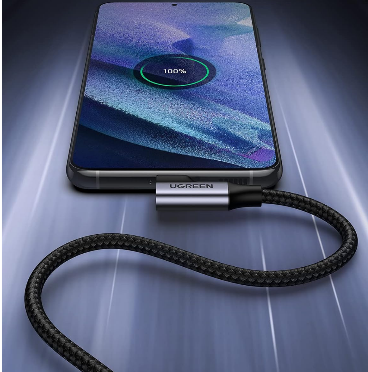
Figure 3.1: Connecting the cable for fast charging a smartphone.