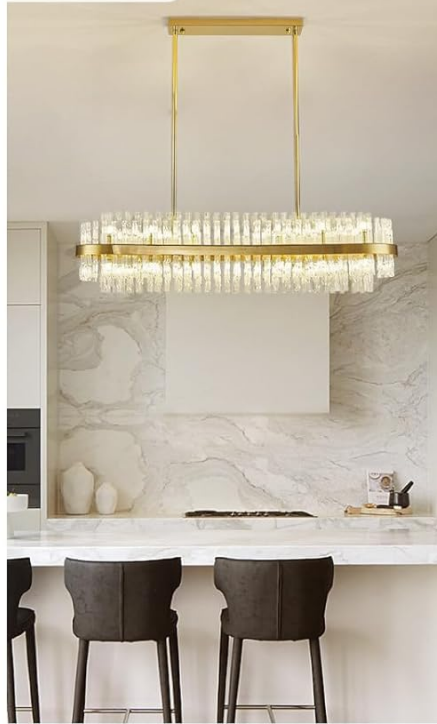
Neutral Light (4500K)