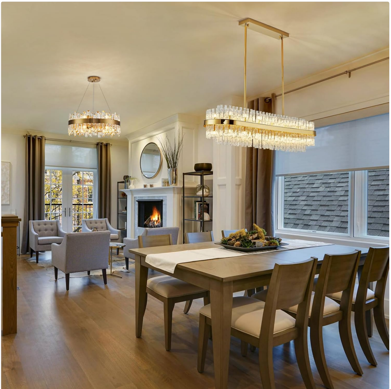
Image: The Siljoy 47-inch Gold Rectangular Crystal Chandelier elegantly installed in a modern dining room and living room, showcasing its rectangular design and crystal elements.