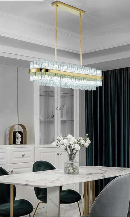
Cool Light (6000K)