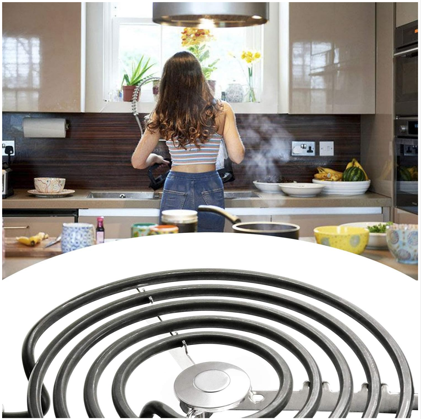
Figure 3.1: The burner in typical use, heating cookware for cooking.