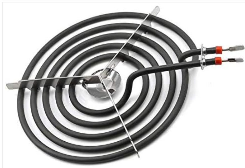
Figure 1.1: The APPLIANCEMATES WB30T10074 Electric Range Burner, an 8-inch coil heating element.

The APPLIANCEMATES WB30T10074 Electric Range Burner is an 8-inch surface heating element designed as a direct replacement part for various GE and Hotpoint electric ranges. This heavy-duty coil element is engineered to efficiently transfer heat to your cooking area, ensuring reliable and consistent performance for your stove. It features a "Y" shaped bracket for proper seating and connection.