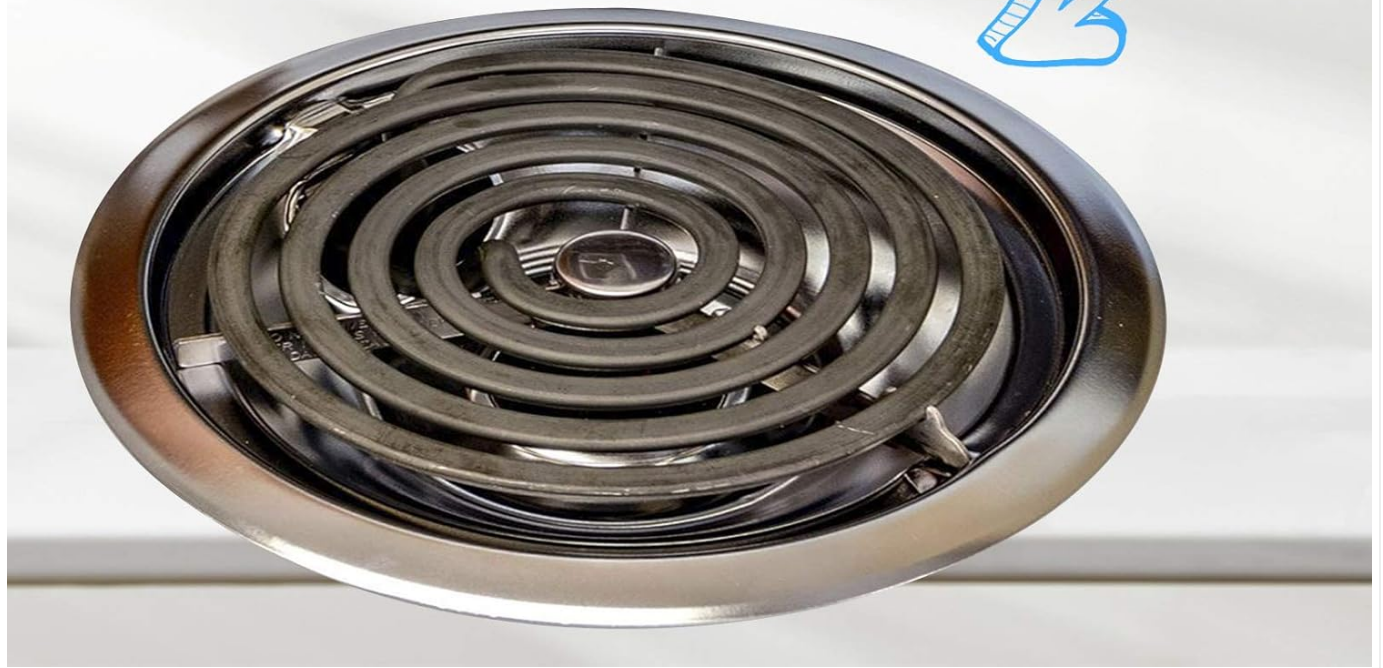
Figure 2.1: The installation process is designed for DIY repair, requiring no special tools.