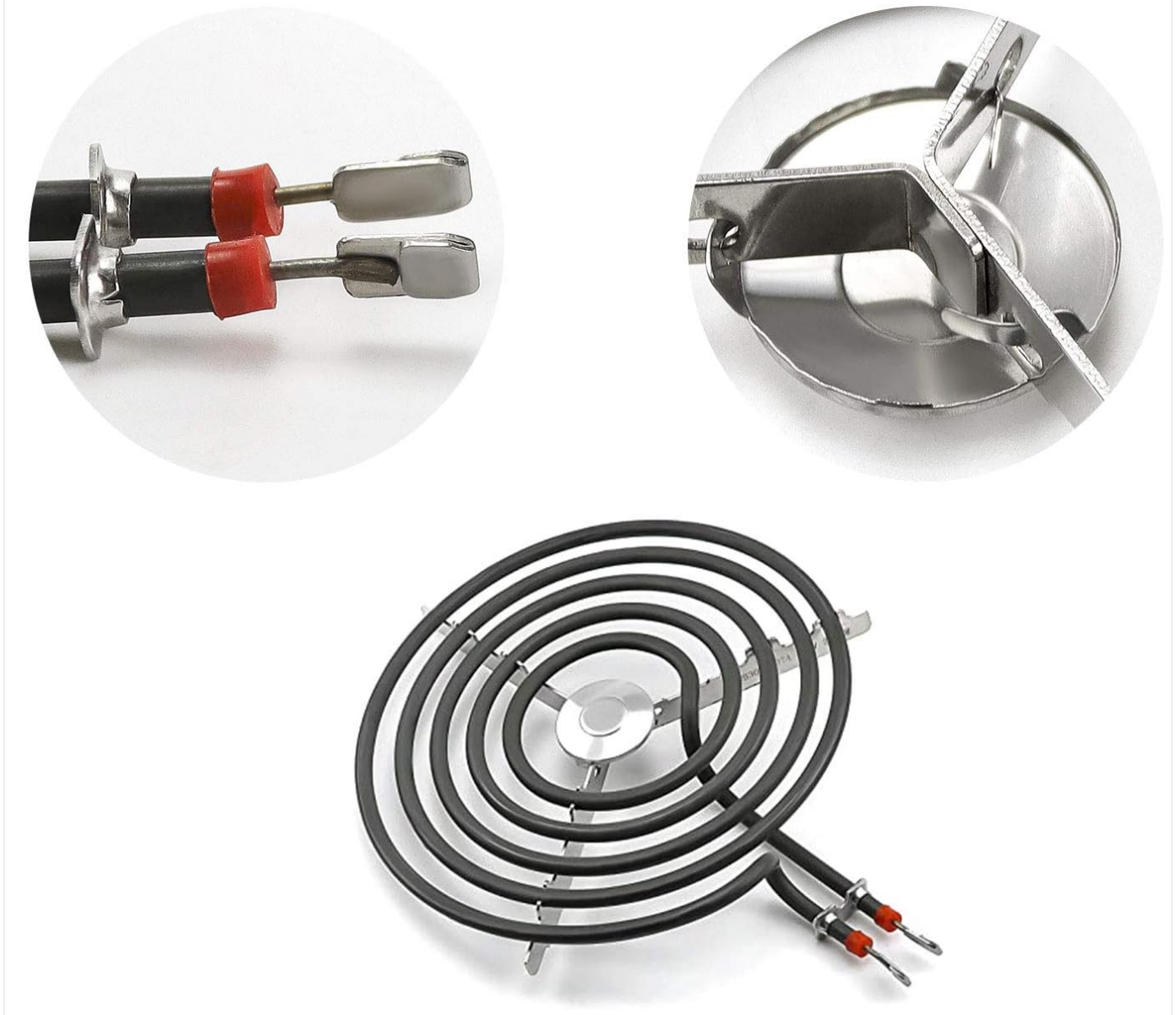
Figure 6.2: Detailed view of the burner's terminals and support bracket.