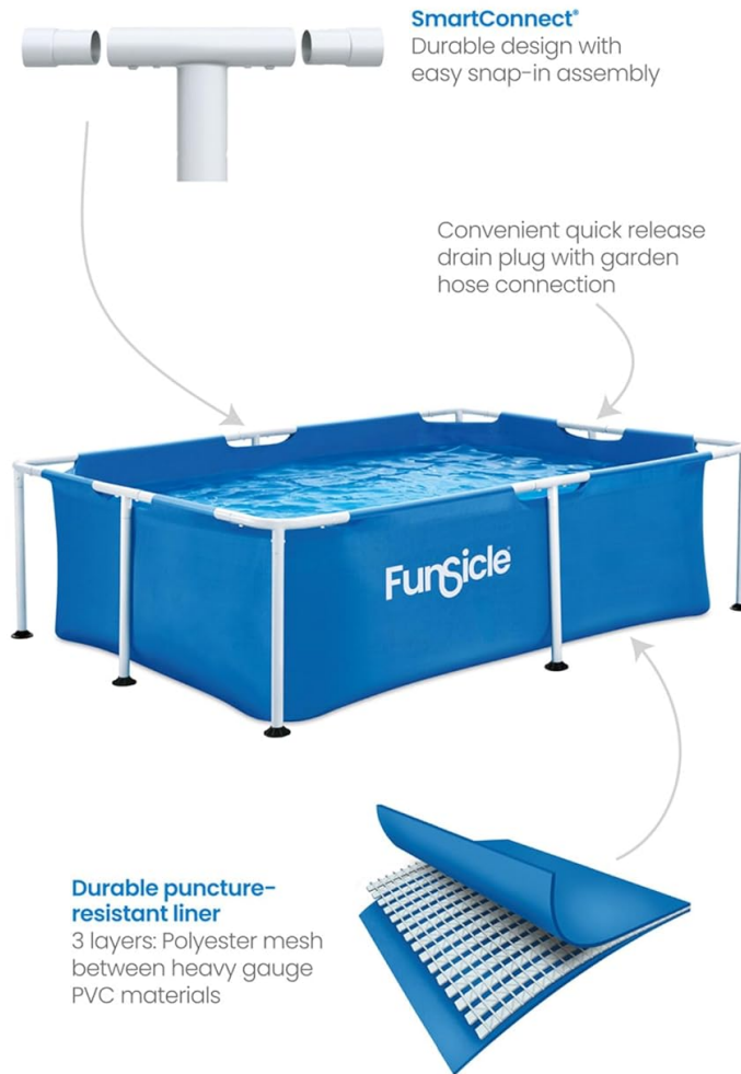
Figure 1: Key features of the Funsicle Activity Lap Pool, including the SmartConnect frame for easy assembly, the convenient quick-release drain plug with garden hose connection, and the durable puncture-resistant liner composed of three layers: polyester mesh between heavy gauge PVC materials.