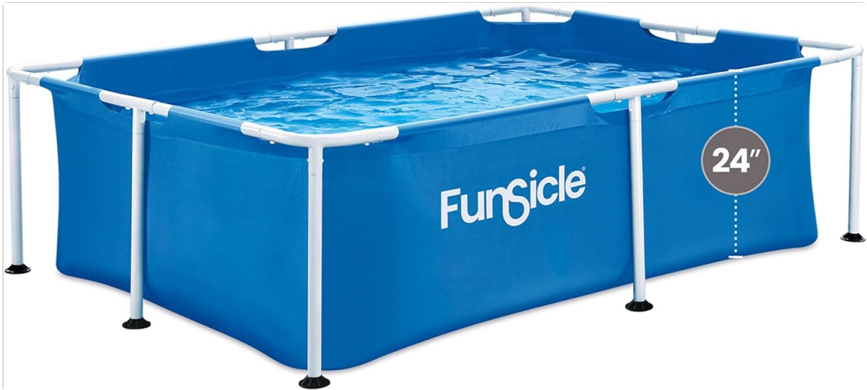
Figure 3: The Funsicle Activity Lap Pool, illustrating its 24-inch height, providing a suitable depth for recreational use.