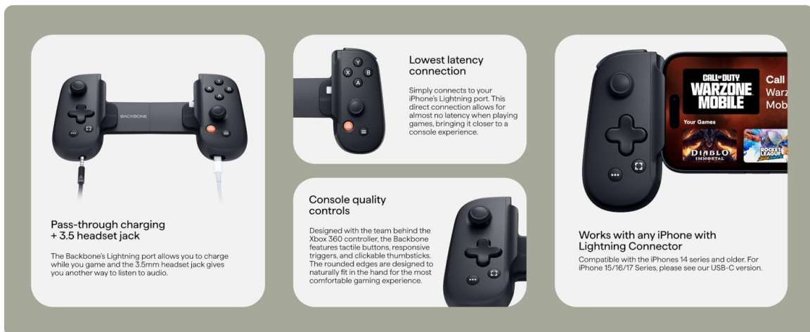
Image: A visual guide demonstrating the connection of an iPhone to the Backbone One controller, emphasizing the Lightning port and the adjustable design for various phone sizes.