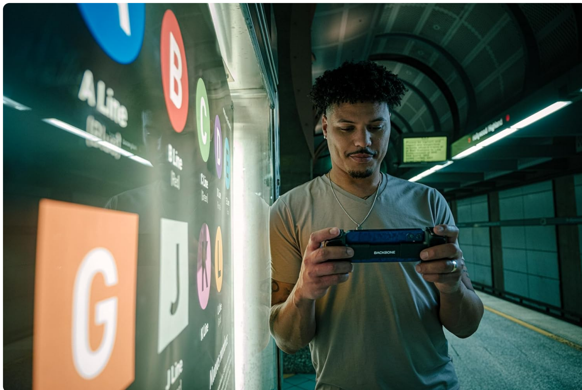
Image: The BACKBONE One Mobile Gaming Controller in black, with an iPhone securely attached, ready for gameplay.

The BACKBONE One Mobile Gaming Controller (Lightning Gen 2 Black) transforms your iPhone 14 & older (Lightning connector) into a portable gaming console. Designed for precision and comfort, this controller enhances your mobile gaming experience across various platforms and games. Enjoy a console-like experience with tactile controls and seamless integration.