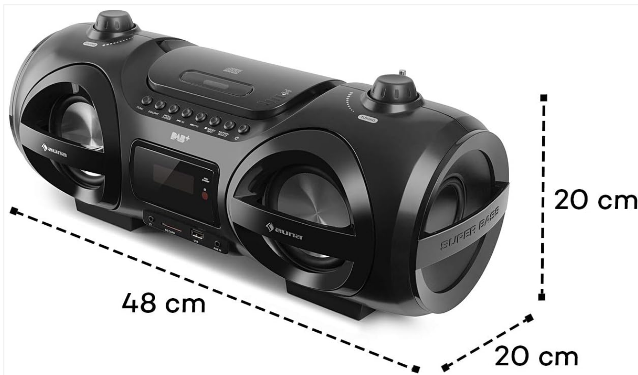
Dimensions of the Auna Soundblaster DAB Boombox.