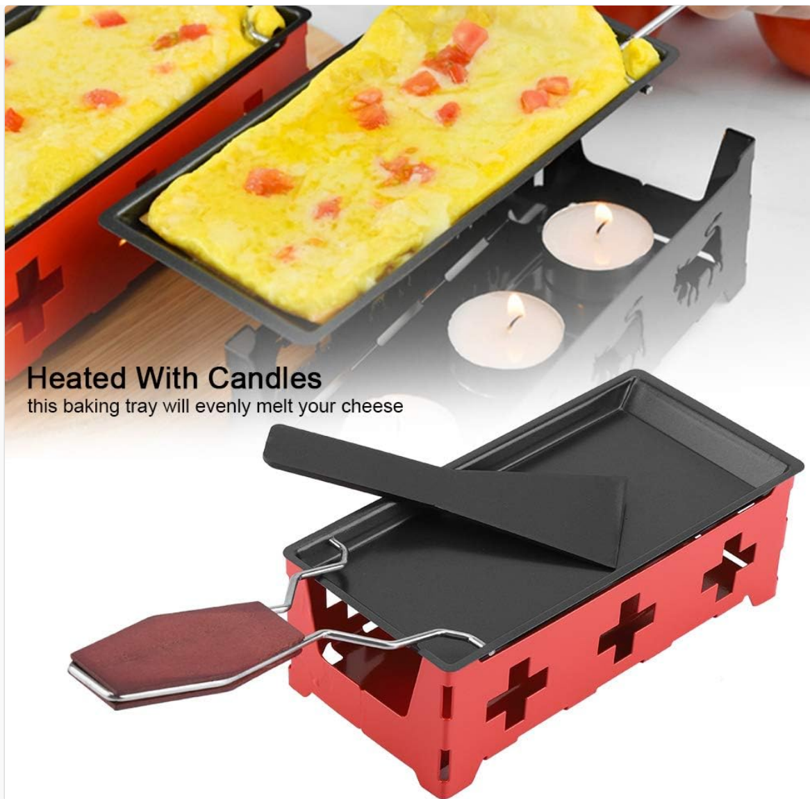
Heated With Candles this baking tray will evenly melt your cheese