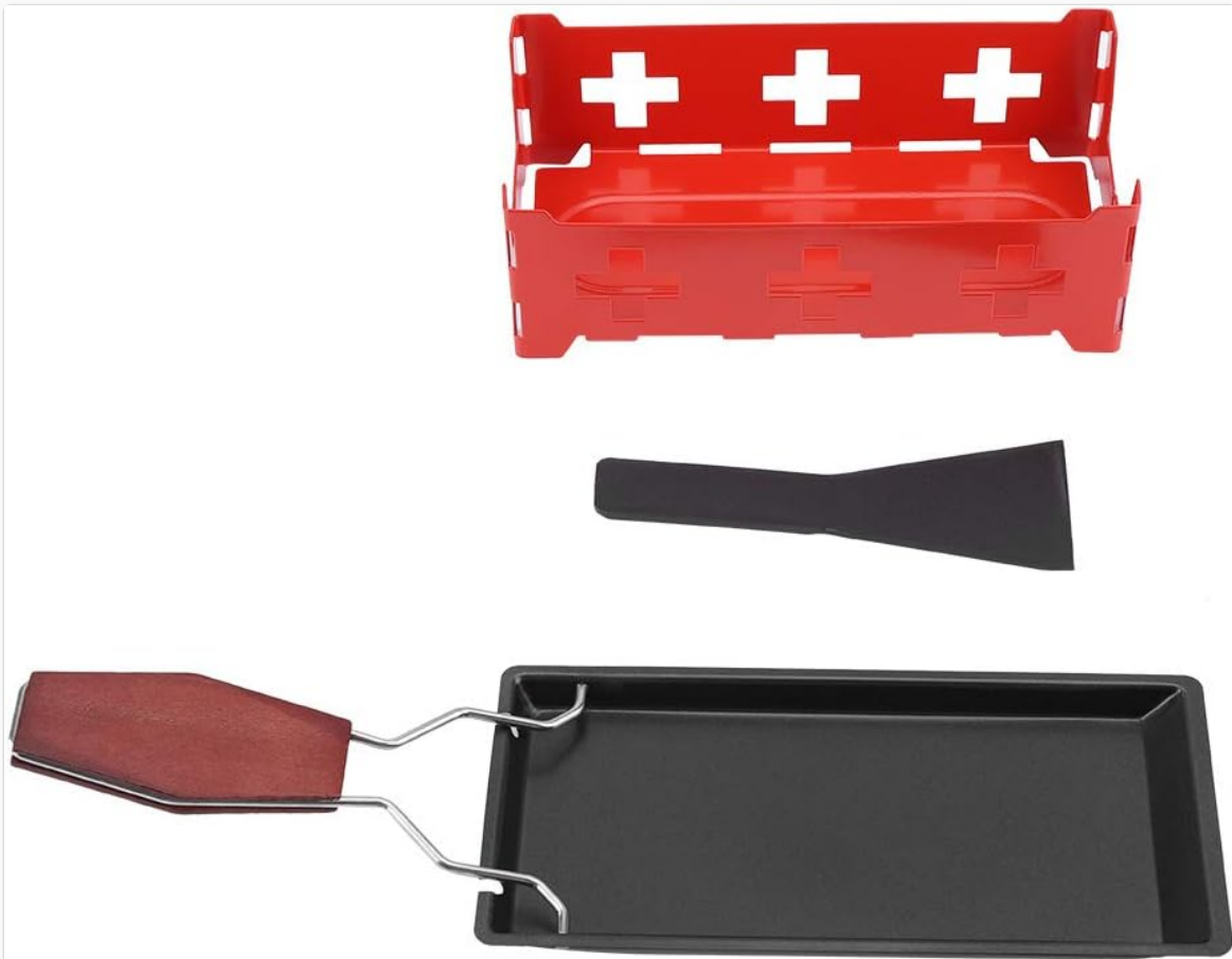
Image 3.1: All components of the JADPES Mini Raclette Set, including the red stove base, black non-stick baking tray with a wooden handle, and a small black spatula.