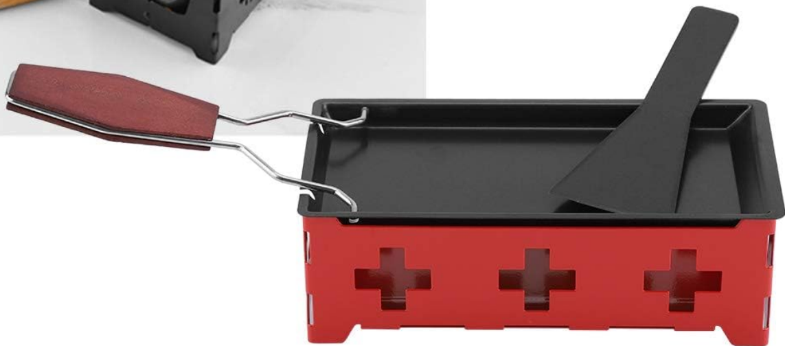
Image 6.1: A close-up view highlighting the non-stick coating of the raclette baking tray, emphasizing its smooth surface for easy cleaning.

Non-stick coating design convenient to use and clean