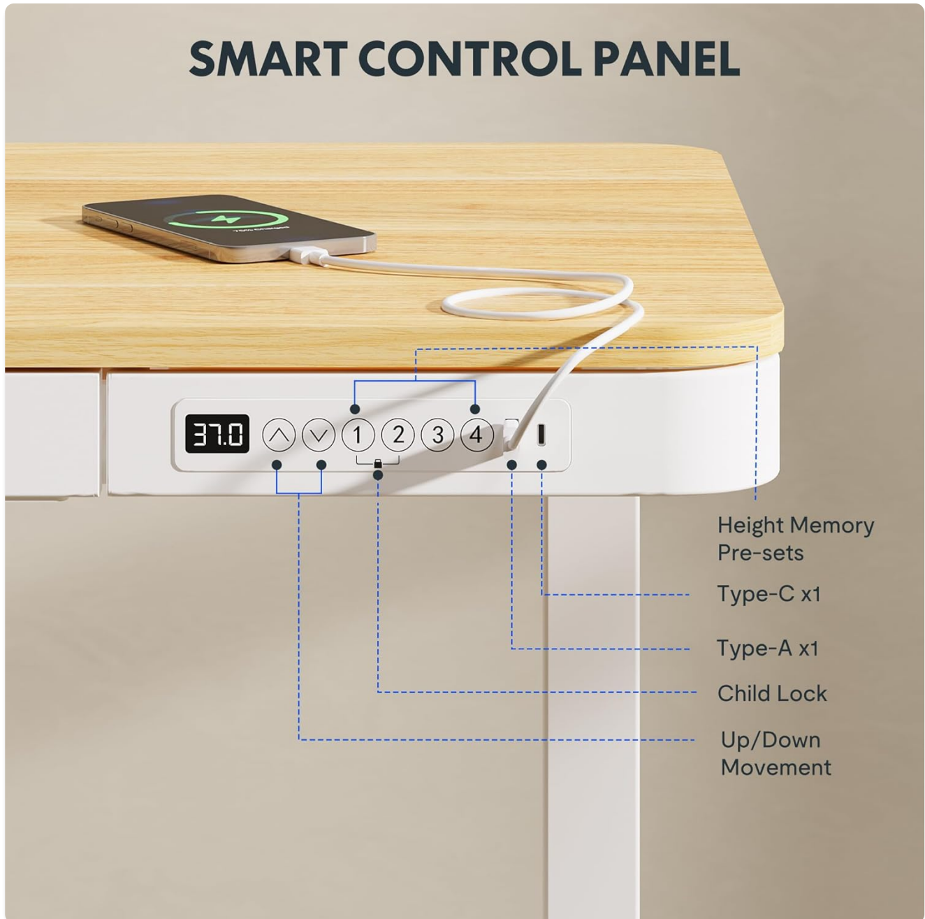
Figure 4.1: Smart Control Panel for height adjustment and charging.