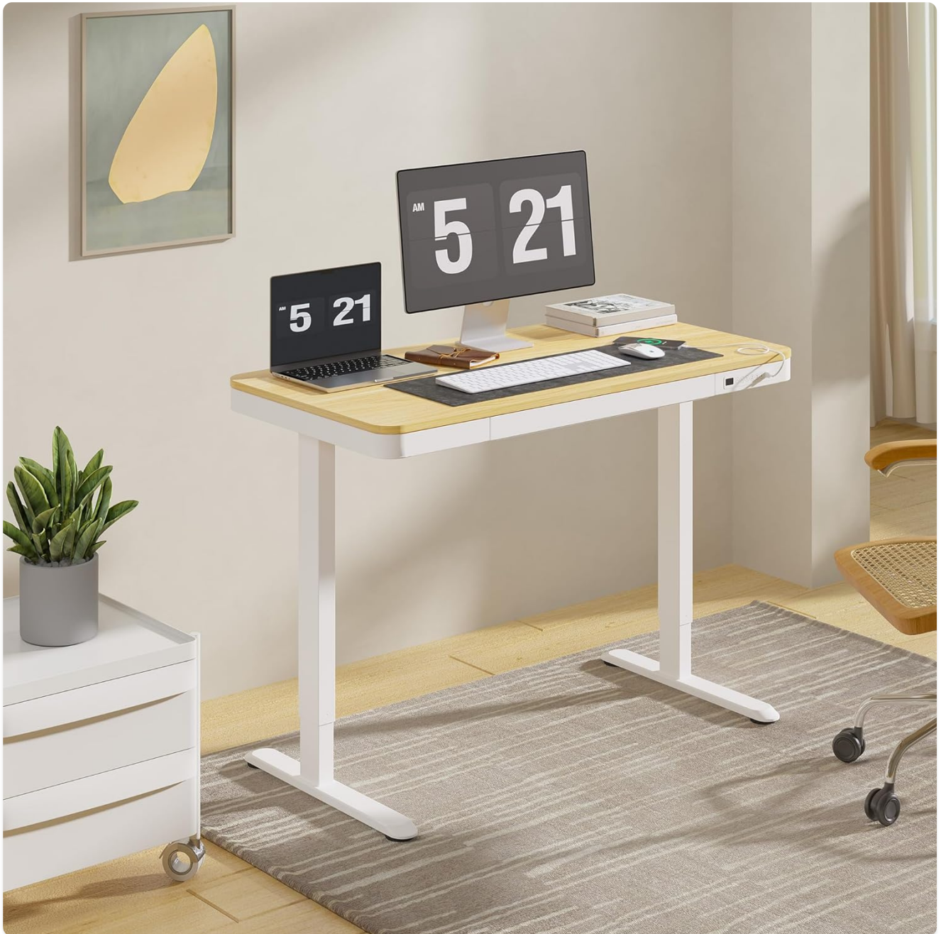
Figure 3.1: Assembled FLEXISPOT Comhar EW8 Electric Standing Desk.