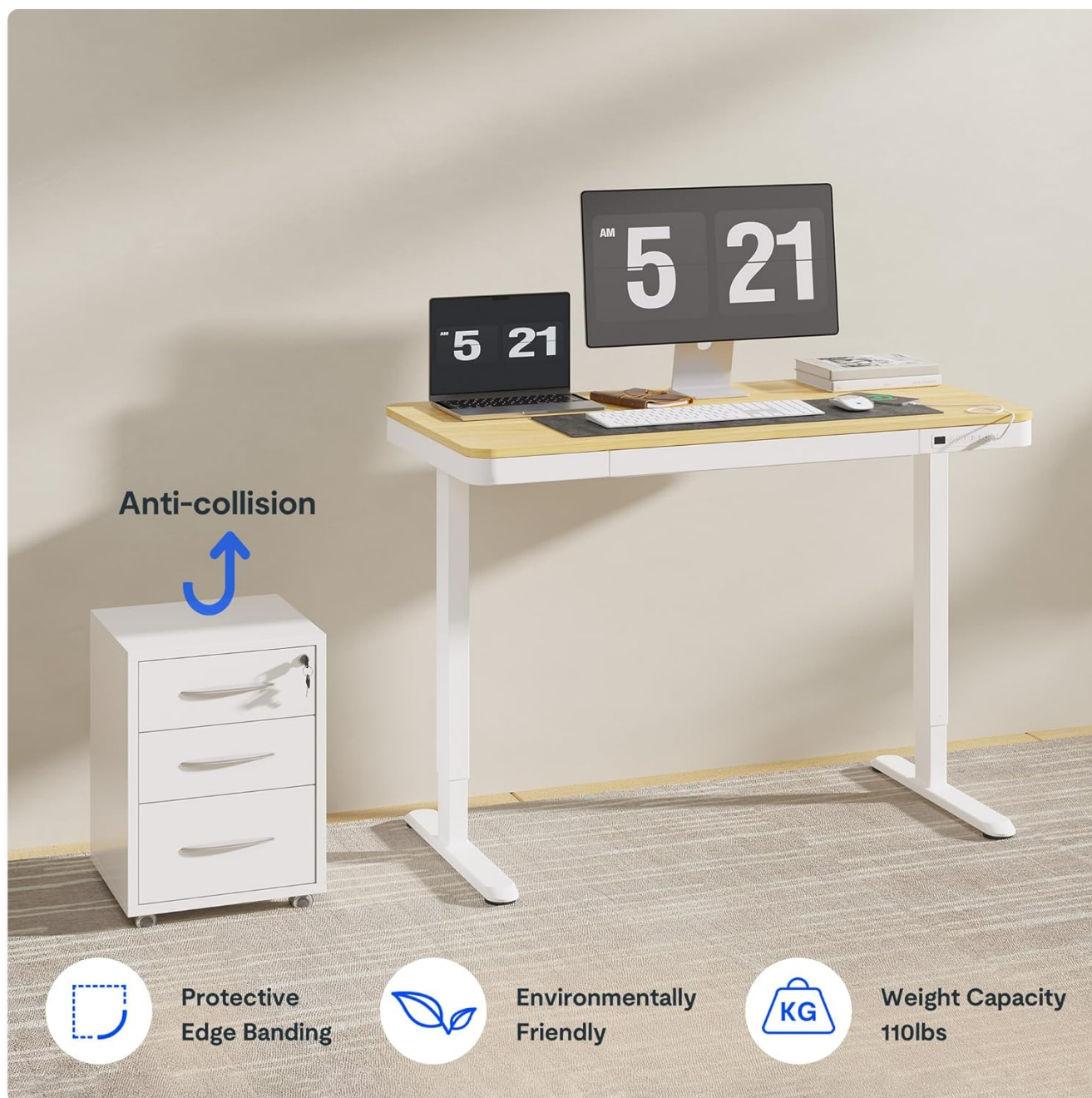
Figure 4.2: Anti-collision technology in action.