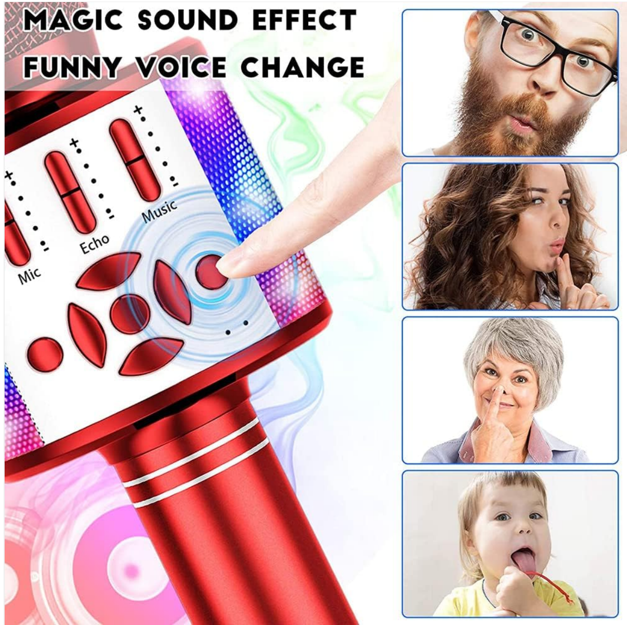
Image 5.1: Activating the magic sound effect for voice alteration.