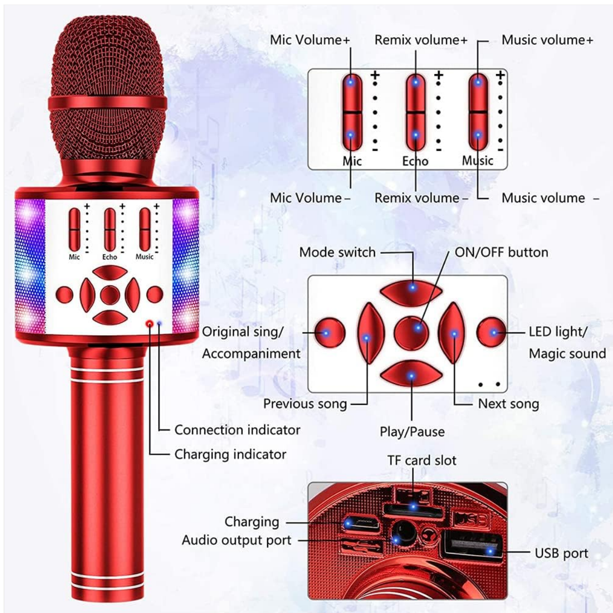
Image 3.1: Detailed diagram of the microphone's control panel and ports.