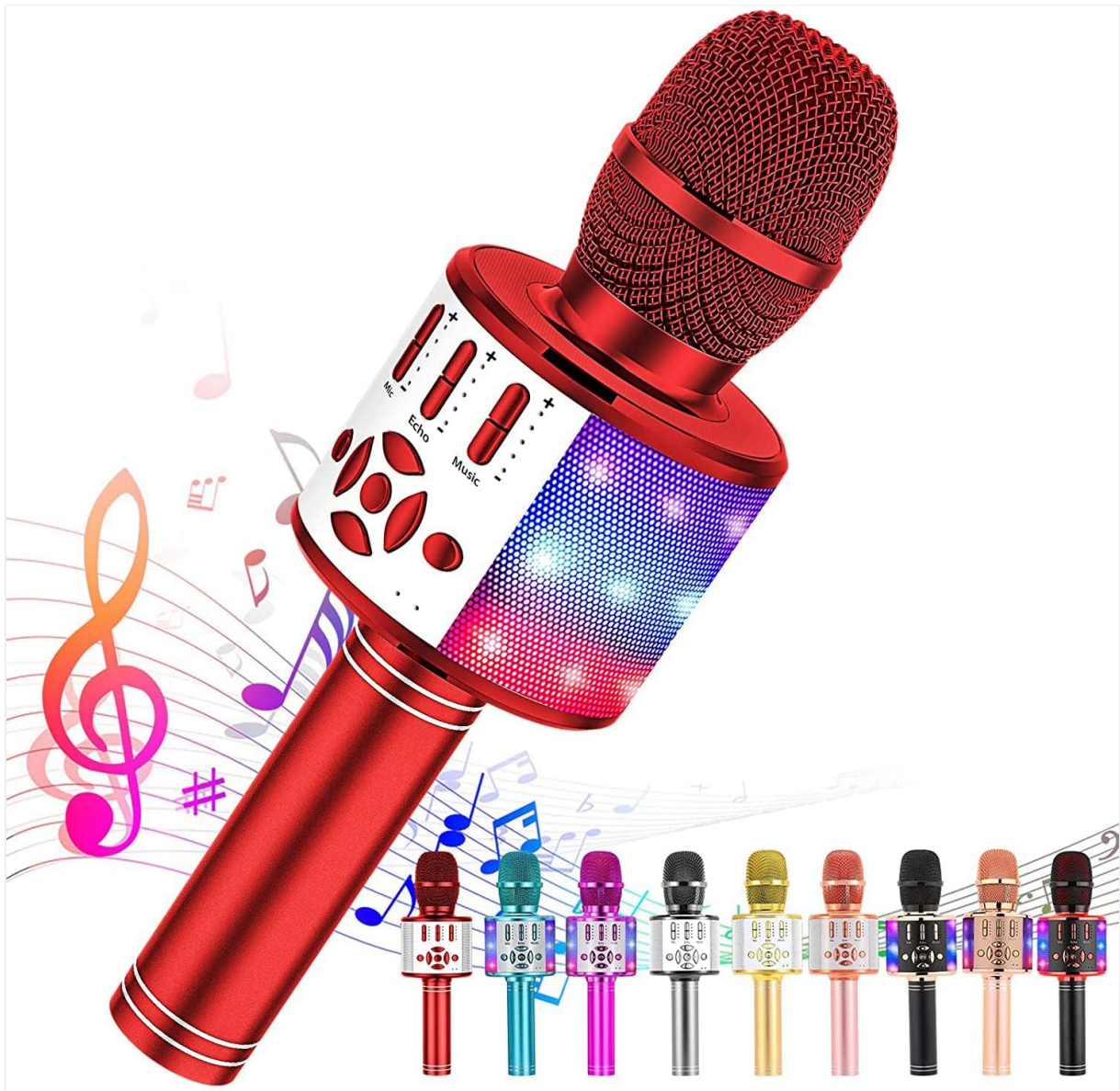
Image 1.1: The Ankuka 4-in-1 Portable Bluetooth Karaoke Microphone, showcasing its design and LED lights.