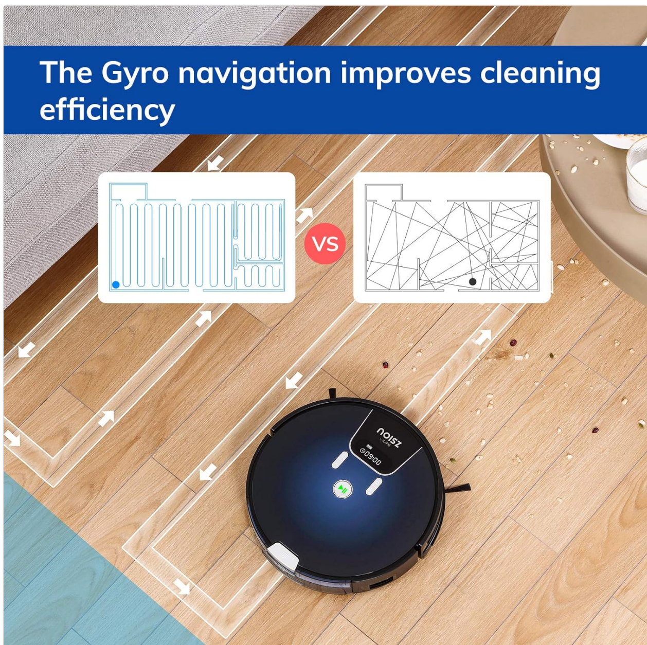
Figure 2: The robot utilizes gyroscope navigation for efficient, row-by-row cleaning.