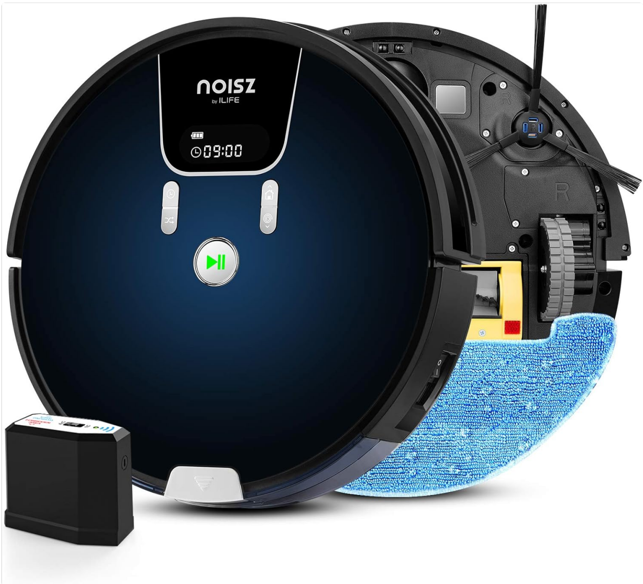
Figure 1: ILIFE NOISZ S8 Pro Robot Vacuum and Mop with its charging dock and a mop pad.