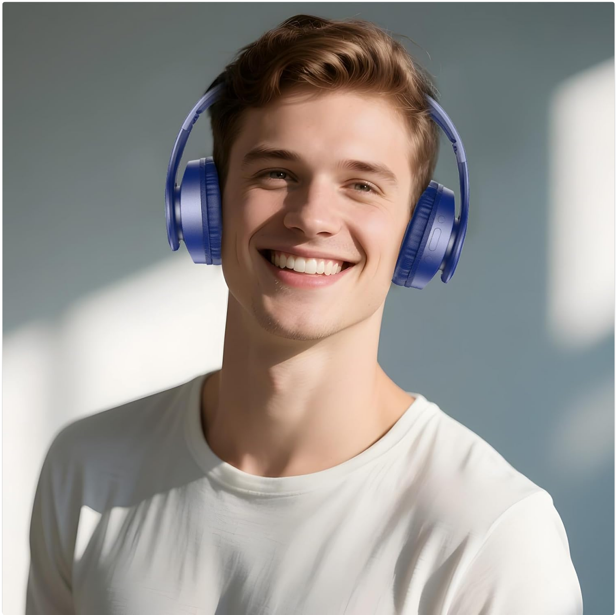
Figure 4: Detail of the soft memory-protein earmuffs, designed for extended comfort.

Your browser does not support the video tag.