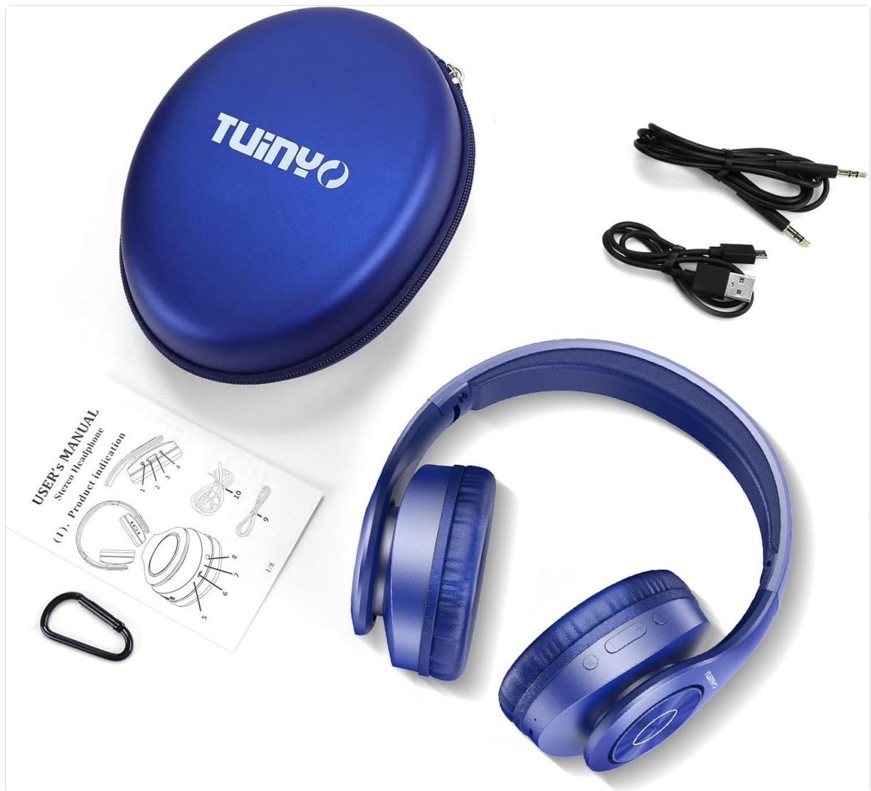
Figure 1: Included accessories with the TUINYO TP 19 headphones.