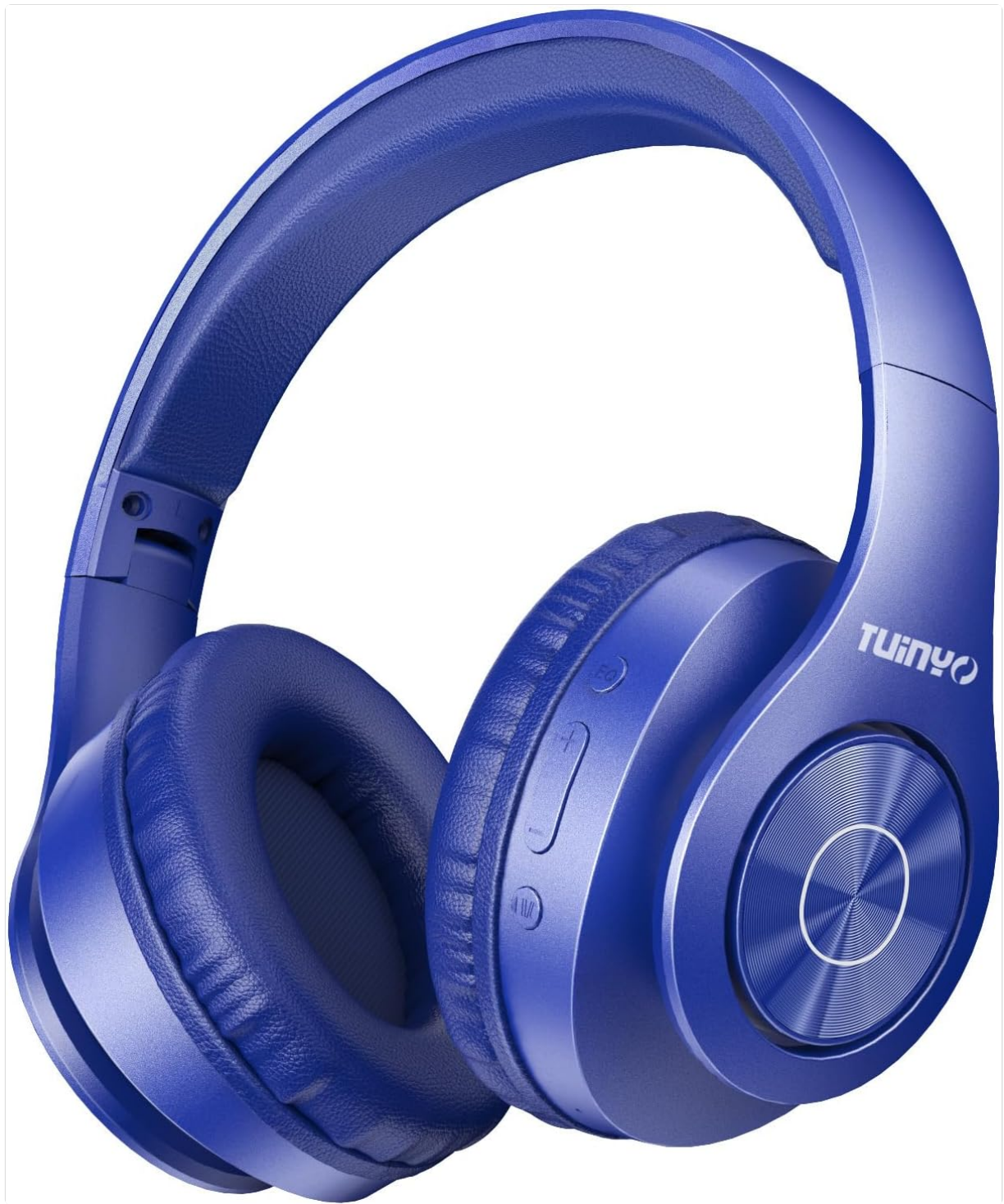
Figure 2: Front view of the TUINYO TP 19 headphones, showcasing the over-ear design and metallic accents.