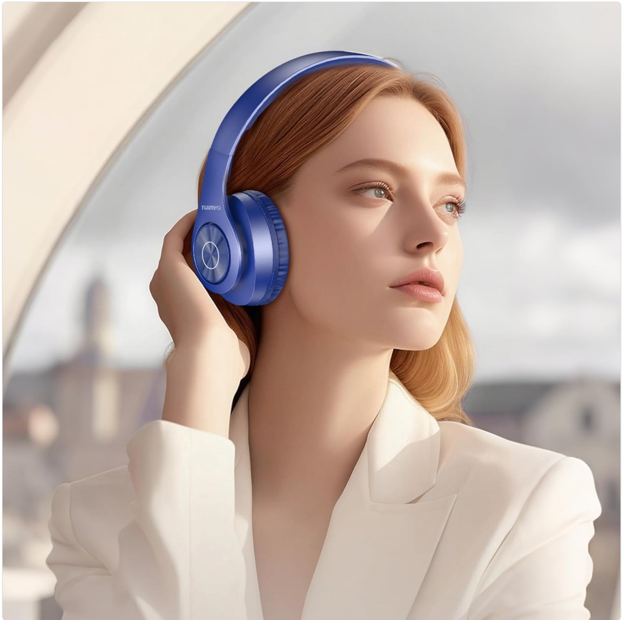
Figure 3: Side view highlighting the control buttons (power, volume, multi-function) and ports on the earcup.