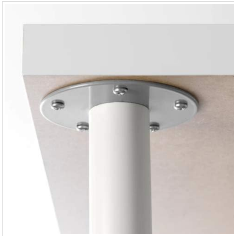
Figure 4.1: Illustration of the ADILS leg's mounting plate securely attached to the underside of a table top using screws.