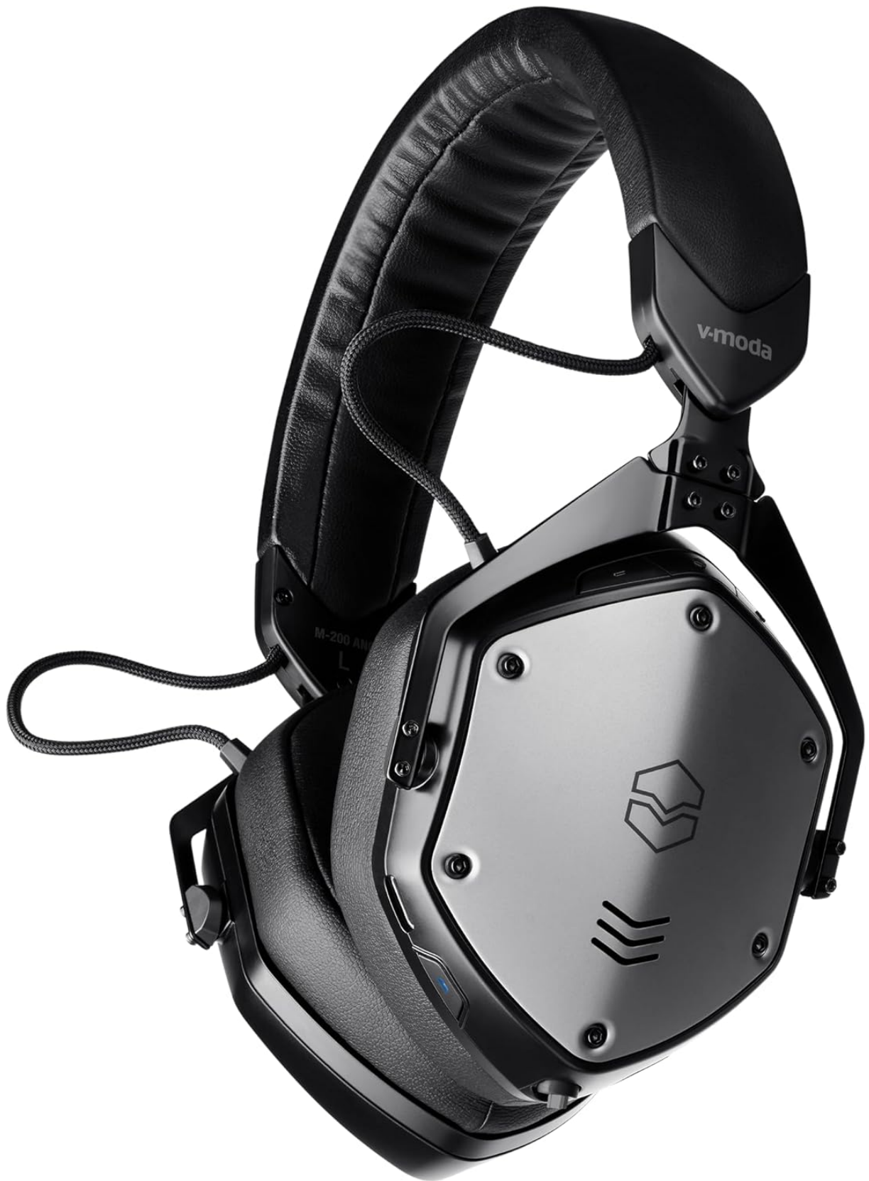
Image: The V-Moda M-200 ANC headphones, showcasing their design and matte black finish.

Key features include customizable audio via the V-MODA app's EQ tool, 10 levels of hybrid active noise cancellation, a durable metal build with a flexible headband, and a "Voice In" smart feature for momentary volume reduction and ANC pause.