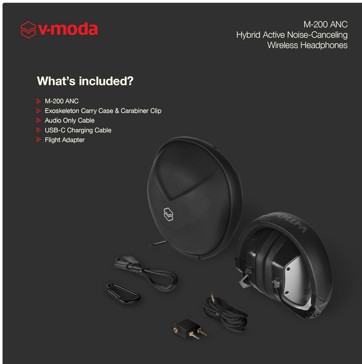
Image: All components included with the V-Moda M-200 ANC headphones, neatly arranged.