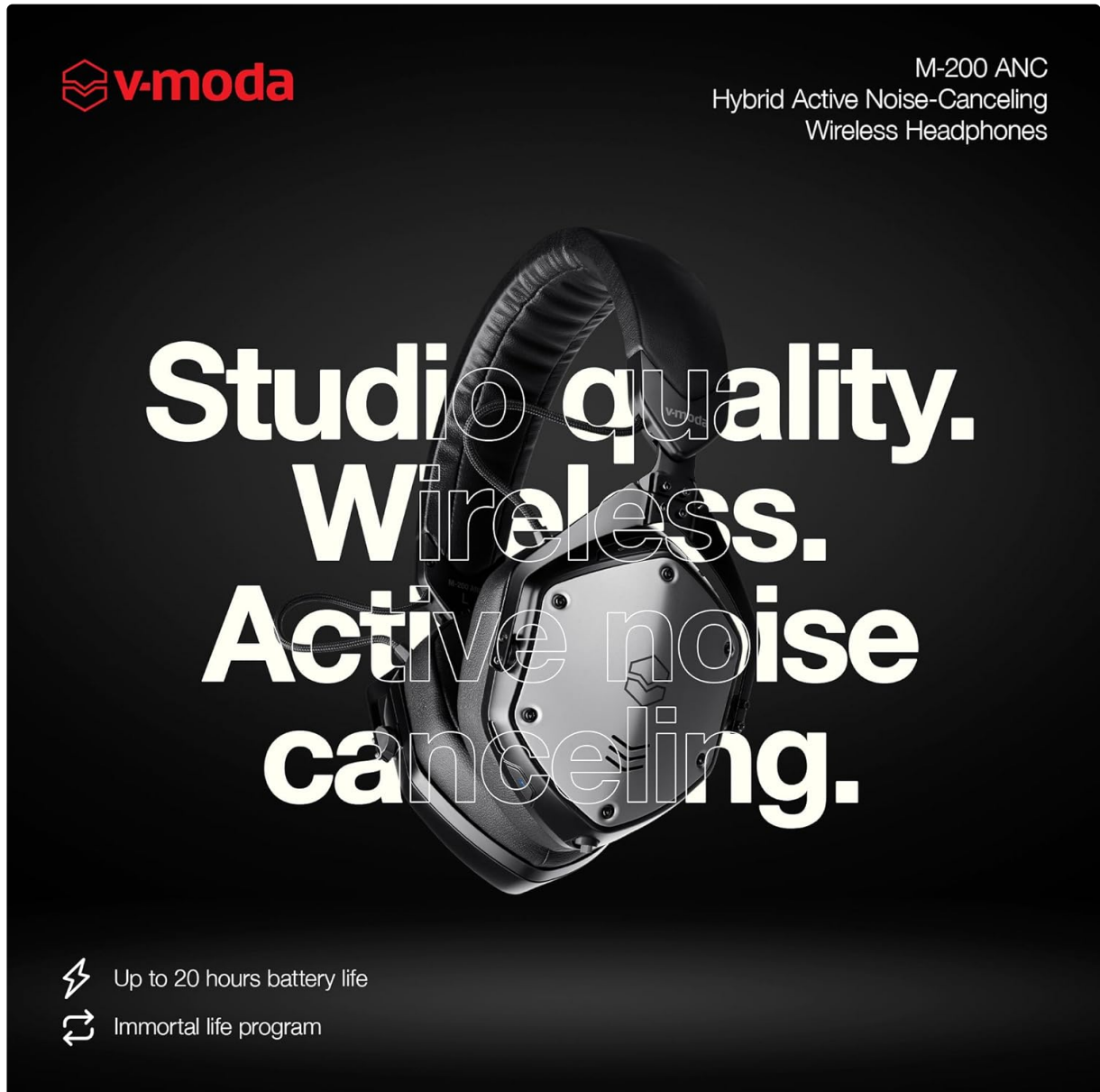
Image: Highlights the studio quality, wireless capability, and active noise canceling features of the M-200 ANC headphones.

Video: An overview of the V-Moda M-200 ANC headphones, highlighting features like hybrid active noise cancellation, 20-hour battery life, easy controls, Voice-In function, and app-based EQ adjustments. It also shows the headphones being folded into their exoskeleton case.