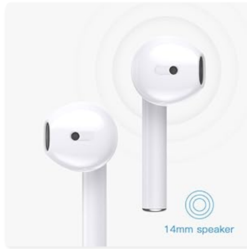
Image: Smart in-ear sensing for automatic pause and play.