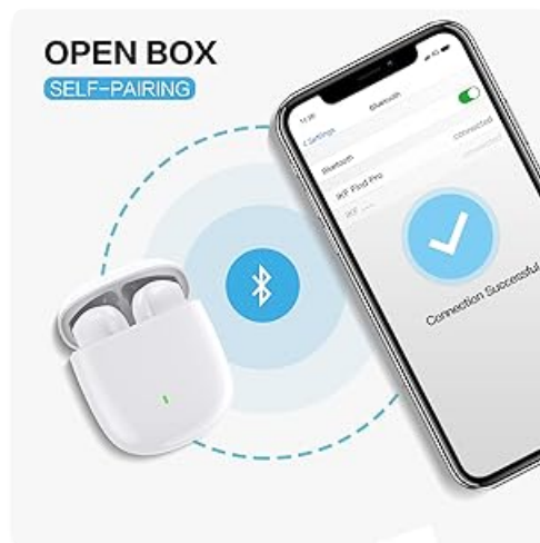
Image: Automatic pairing process when opening the charging case.