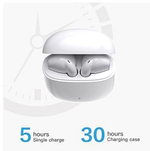
Image: Battery life indication for earbuds and charging case.

The earbuds offer approximately 5 hours of continuous use on a single charge. With the charging case, the total playtime extends to about 25-30 hours.