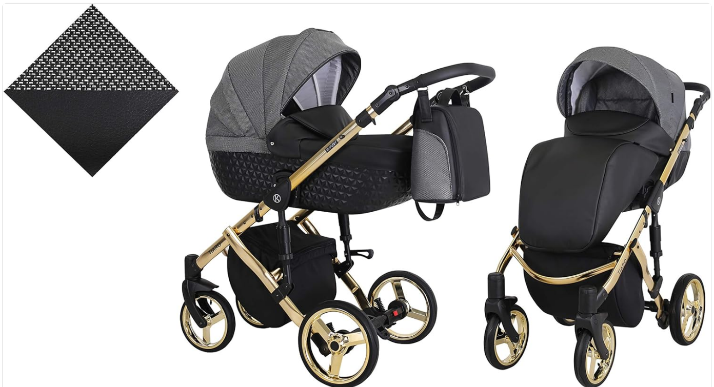
Image 1.1: The Kunert Tiaro Premium 2-in-1 Stroller, illustrating its dual functionality as a bassinet and a stroller seat on a gold-colored frame with black and grey fabric components.

Thank you for choosing the Kunert Tiaro Premium 2-in-1 Stroller. This versatile system is designed to provide comfort and safety for your child from infancy through toddlerhood, functioning as both a comfortable bassinet and a practical stroller. Please read this manual carefully before assembly and use to ensure proper operation and to maximize the lifespan of your product. Keep this manual for future reference.