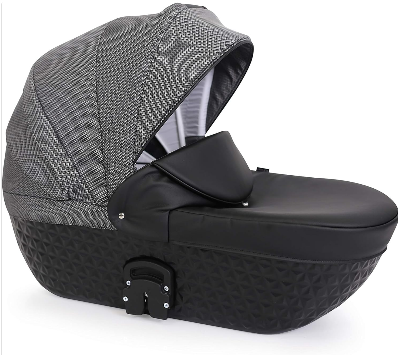
Image 3.2: A detailed view of the bassinet component, highlighting its design and attachment points.