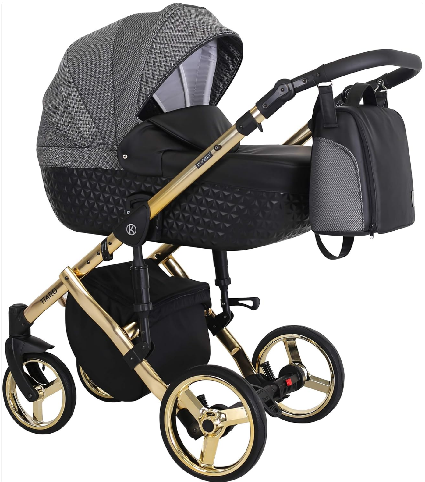
Image 3.1: The stroller frame with wheels attached and the bassinet unit mounted, ready for use.