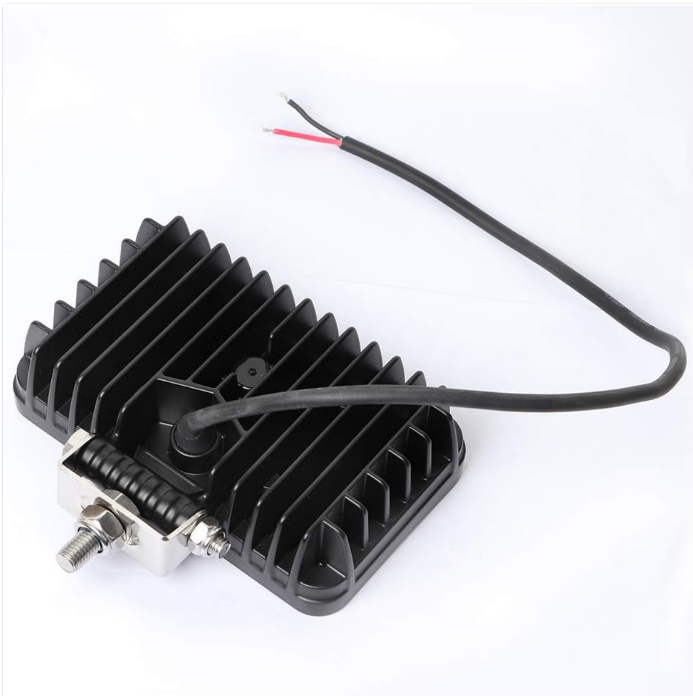
Image: Front and rear views of the EXZEIT LED Work Light, showing the power cable and heatsink design.