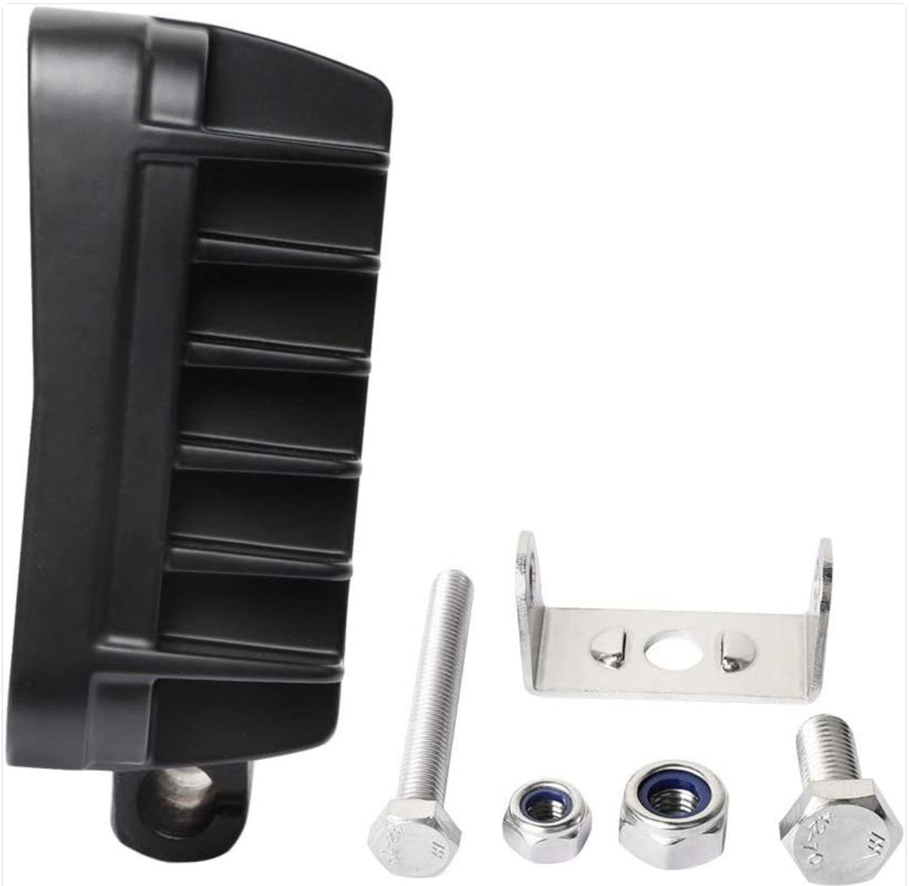
Image: Included mounting hardware and a single light unit.