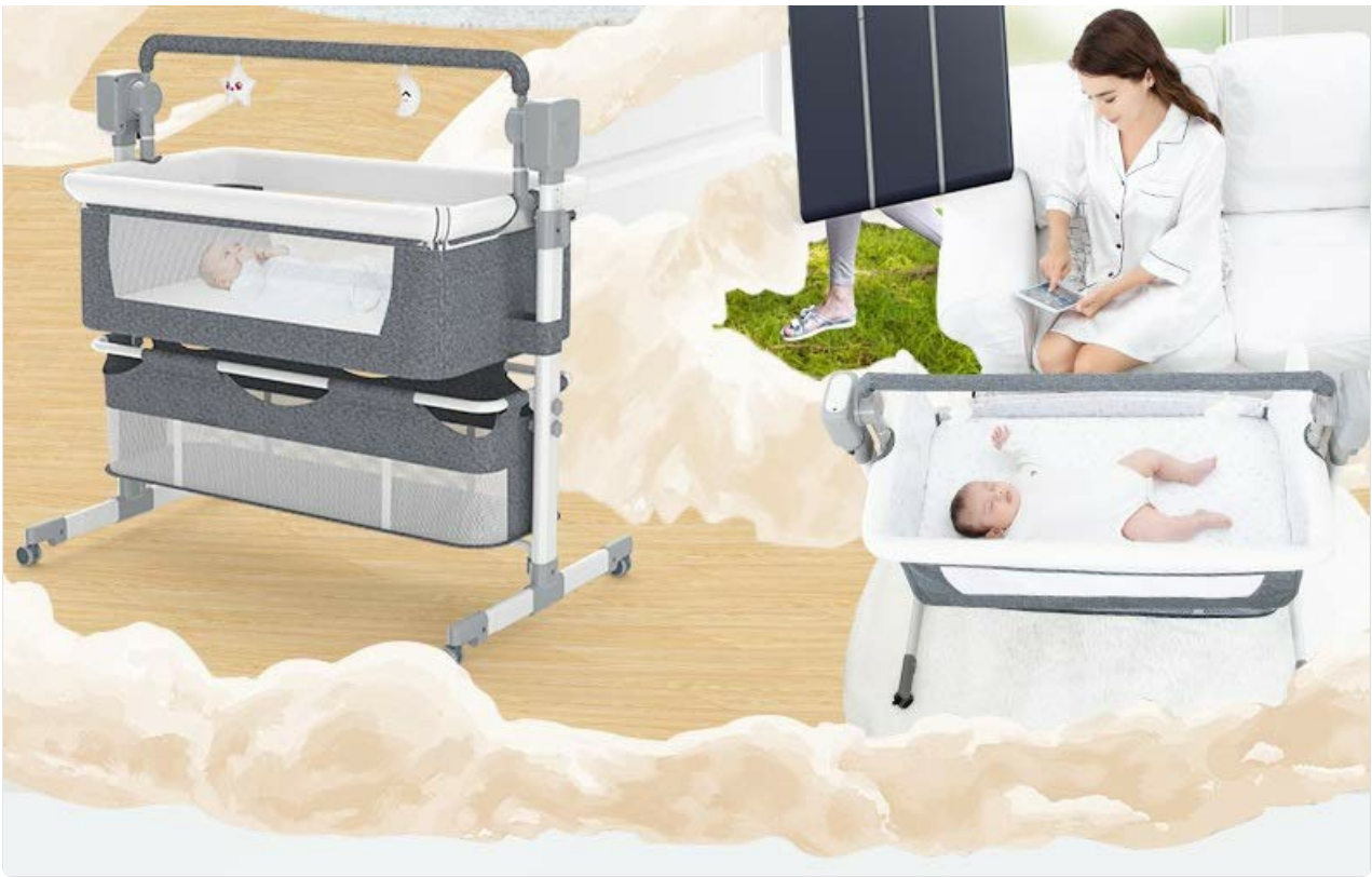
Figure 2: Cradle Cot in Use. This image shows the assembled cradle cot positioned in a room, highlighting its readiness for use after basic setup.