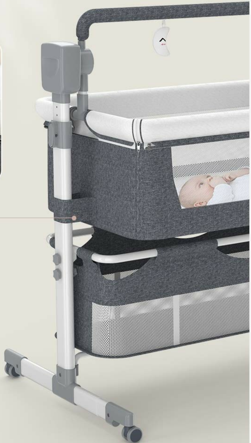
Figure 4: Height Adjustment. This image details the height adjustment feature, indicating the three possible height settings for the cradle cot.