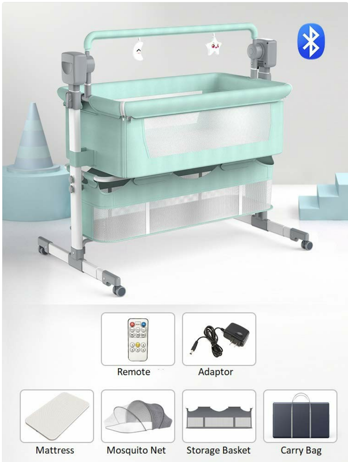
Figure 1: Included Components. This image displays the main cradle cot unit along with its accessories: a remote control, power adaptor, mattress, mosquito net, a detachable storage basket, and a carry bag for portability.