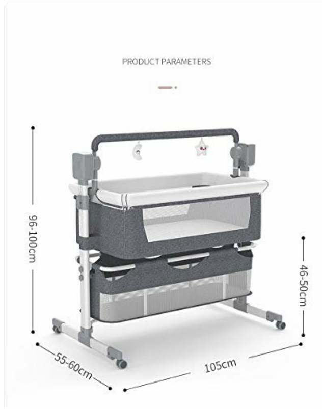
Figure 7: Product Dimensions. This diagram provides the overall measurements of the cradle cot, including its length, width, and adjustable height range.

Detailed specifications for the StarAndDaisy EC1 Automatic Baby Cradle Cot: