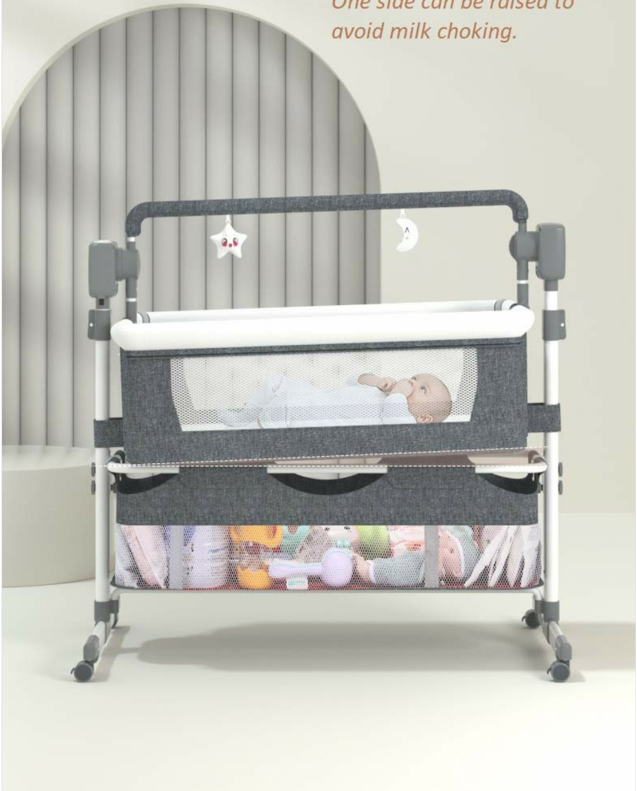
Figure 6: Anti-Milk Choking Feature. This image shows the cradle cot with one end slightly elevated, a design feature intended to help prevent milk reflux in infants.

One side can be raised to avoid milk choking.