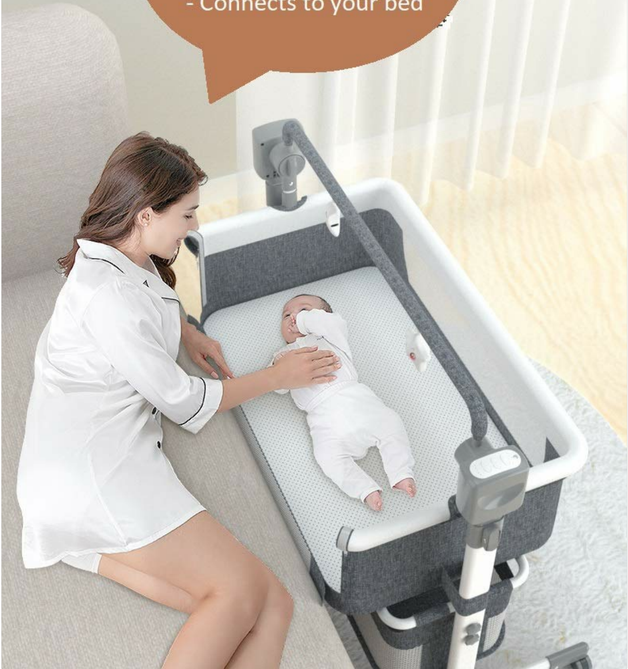
Figure 3: Automatic Cradle Mode. This image illustrates a parent observing their baby in the cradle cot, which is in automatic cradling