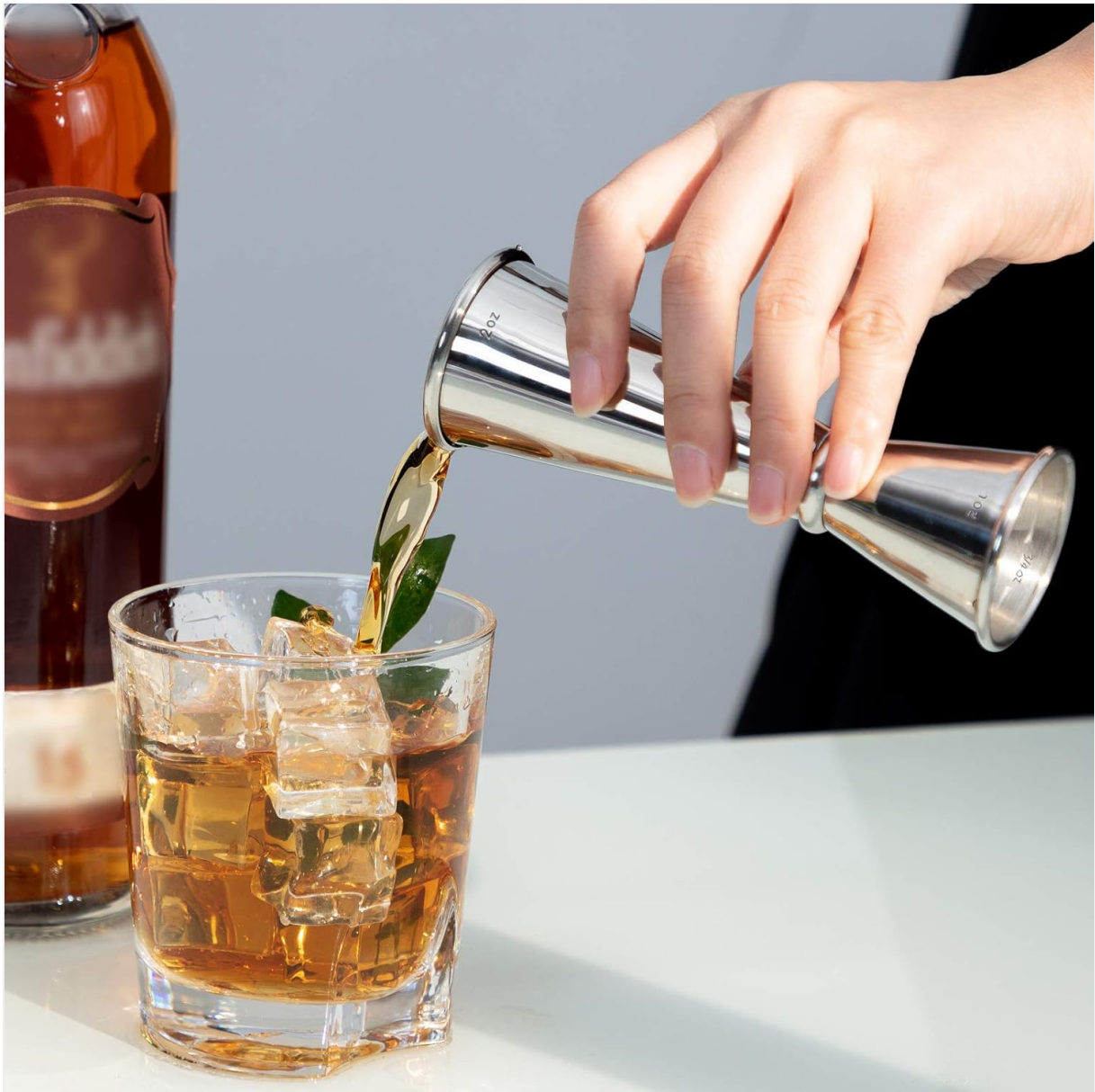
Image: A hand demonstrating the use of the BRIOUT Double Cocktail Jigger, pouring a measured amount of liquid into a glass filled with ice. A bottle is visible in the background.