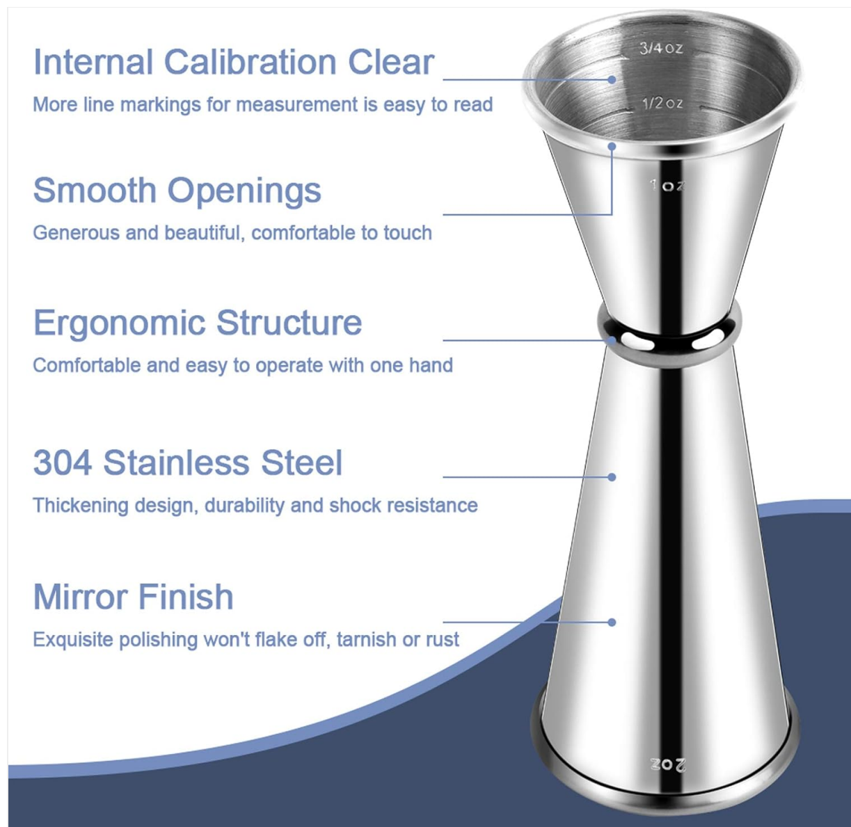
Image: The BRIOUT Double Cocktail Jigger showcasing its internal calibration lines for 1/2 oz, 3/4 oz, 1 oz, 1-1/2 oz, and 2 oz measurements. The jigger is made of 304 stainless steel with a mirror finish and ergonomic structure.

Always ensure the jigger is level when measuring to achieve the most accurate results.