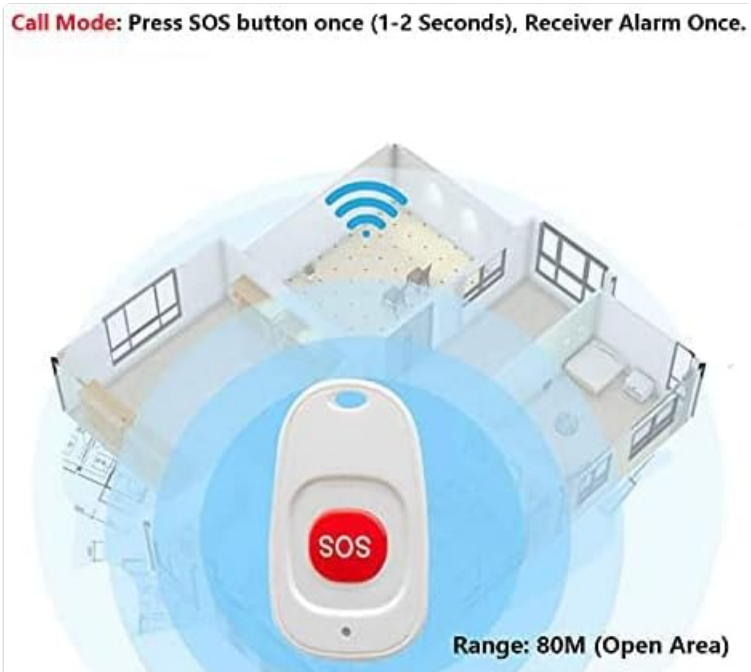
Image 3.1: Detailed diagram illustrating the various components of both the receiver and the SOS call button.