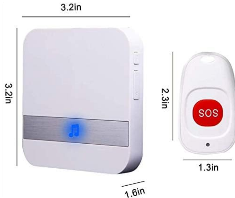
Image 1.2: Visual representation of the system's key features, including 80-meter range, adjustable volume, 52 melodies, memory function, and one-click call capability.