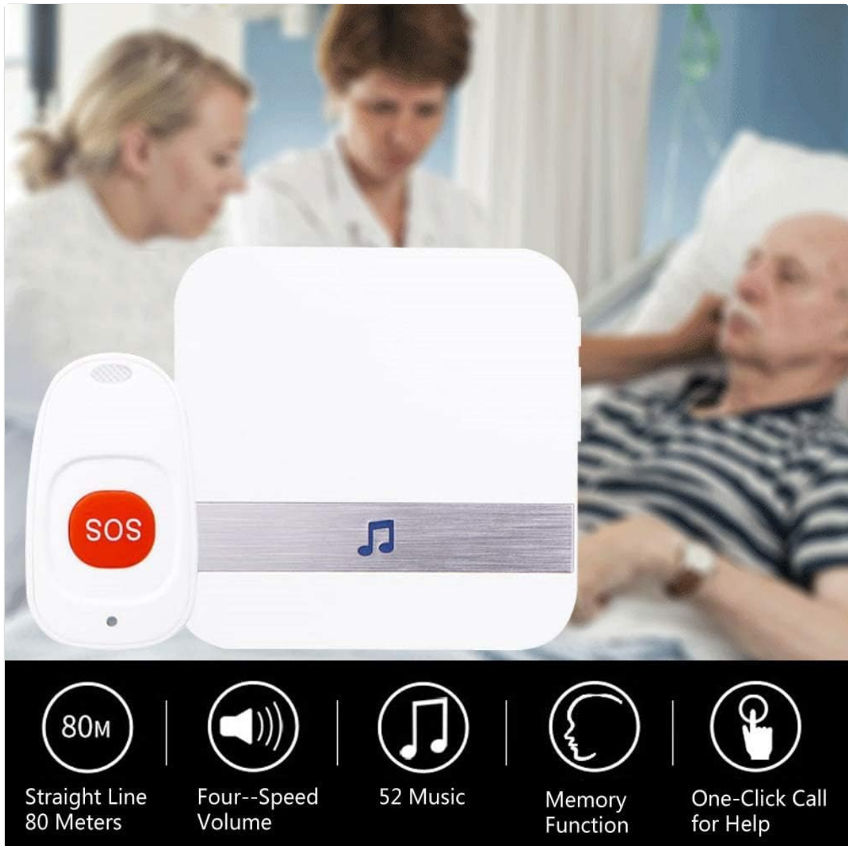
Image 3.2: Visual representation of the product dimensions for both the receiver and the SOS call button.