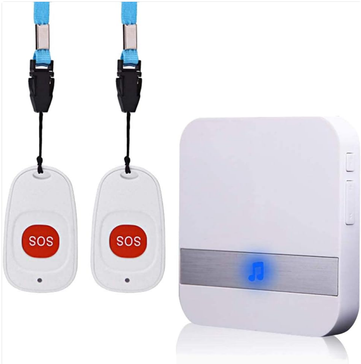
Image 1.1: The ALEENFOON Wireless Patient Pager Alarm System, showing the main receiver unit and two portable SOS call buttons.