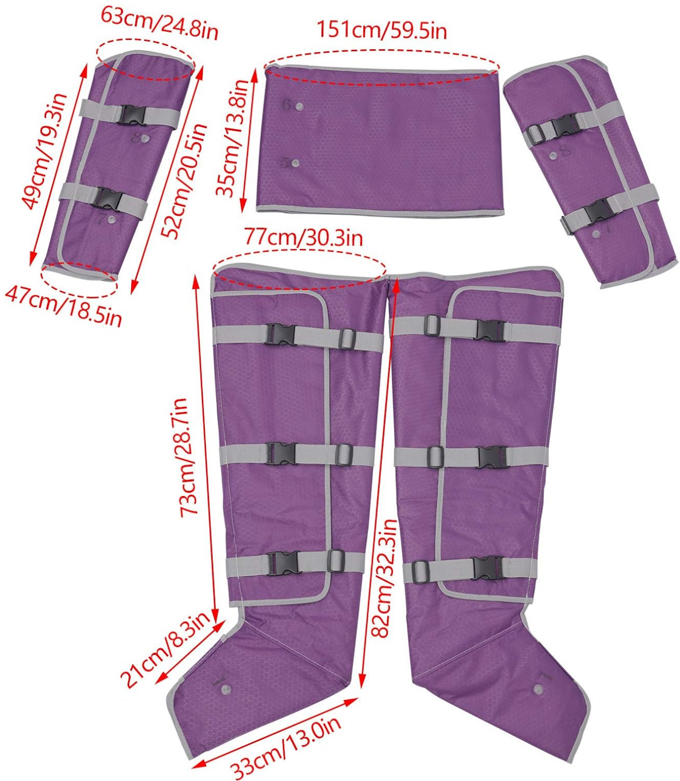
Figure 4: Dimensions of the DYRABREST Pressotherapy control unit and suit components. This image provides measurements for the control unit and various parts of the purple air pressure suit.