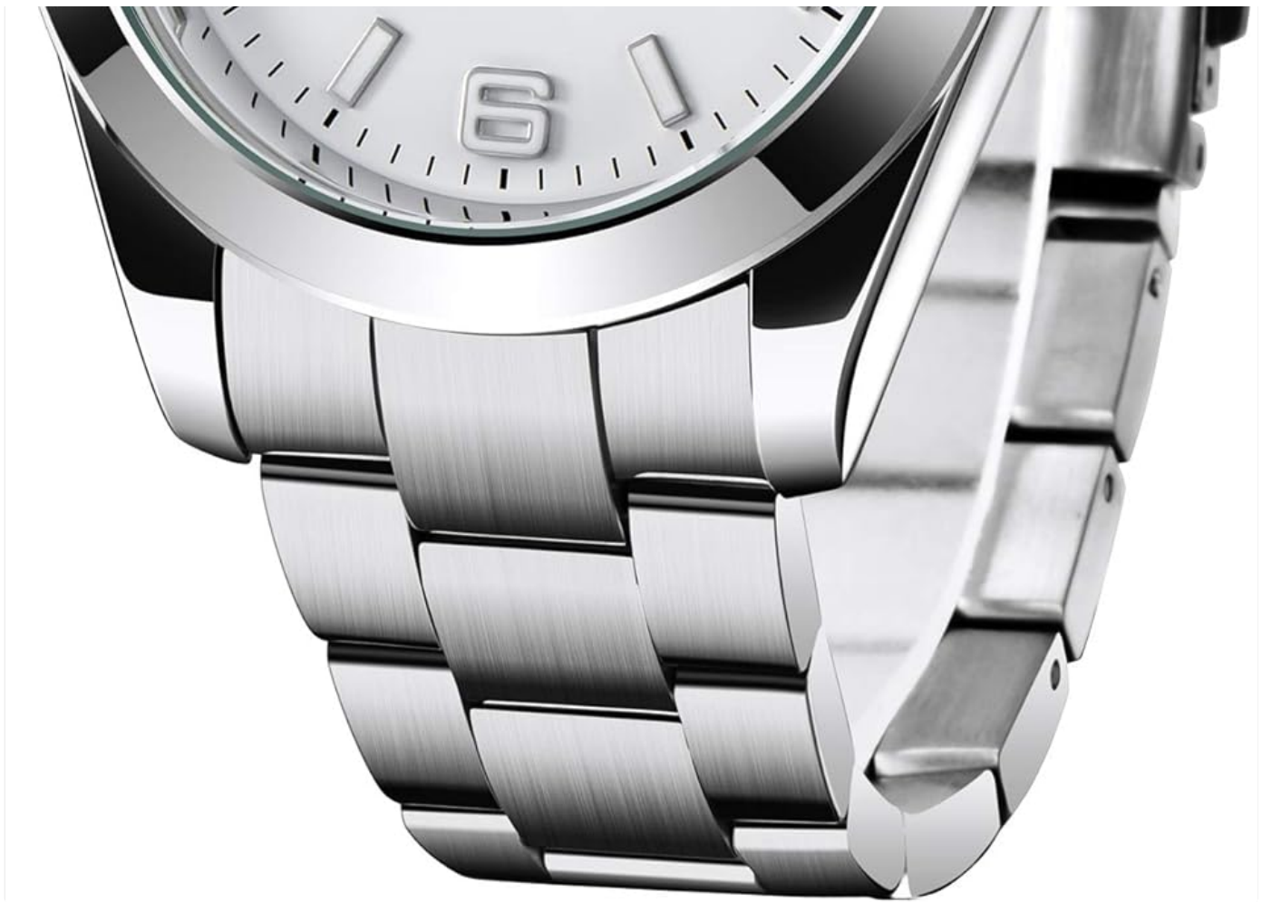
Image: Front view of the BENYAR 5177 watch, showcasing its white dial, luminous markers, and polished stainless steel case and bracelet.