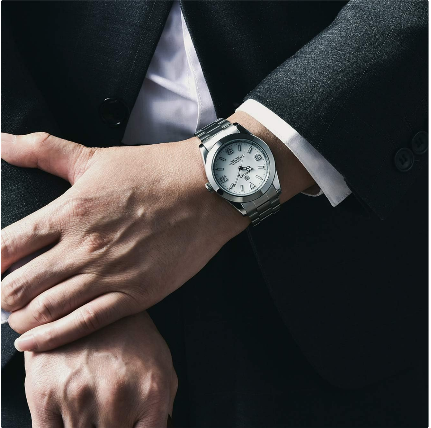
Image: The BENYAR 5177 watch being worn on a wrist, demonstrating its fit and appearance.

remove or add links for a perfect fit. The folding buckle with the BENYAR logo provides a secure closure.