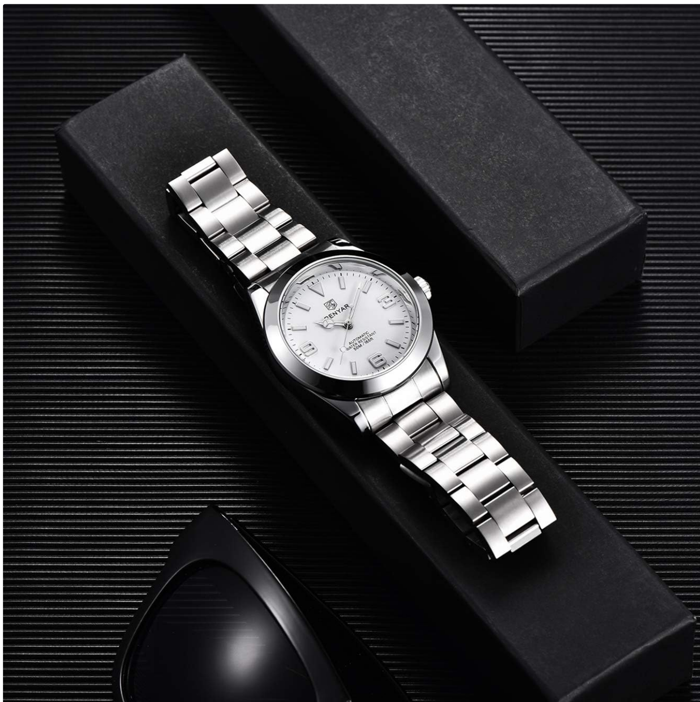
Image: The BENYAR 5177 watch shown with its original packaging, emphasizing product presentation.