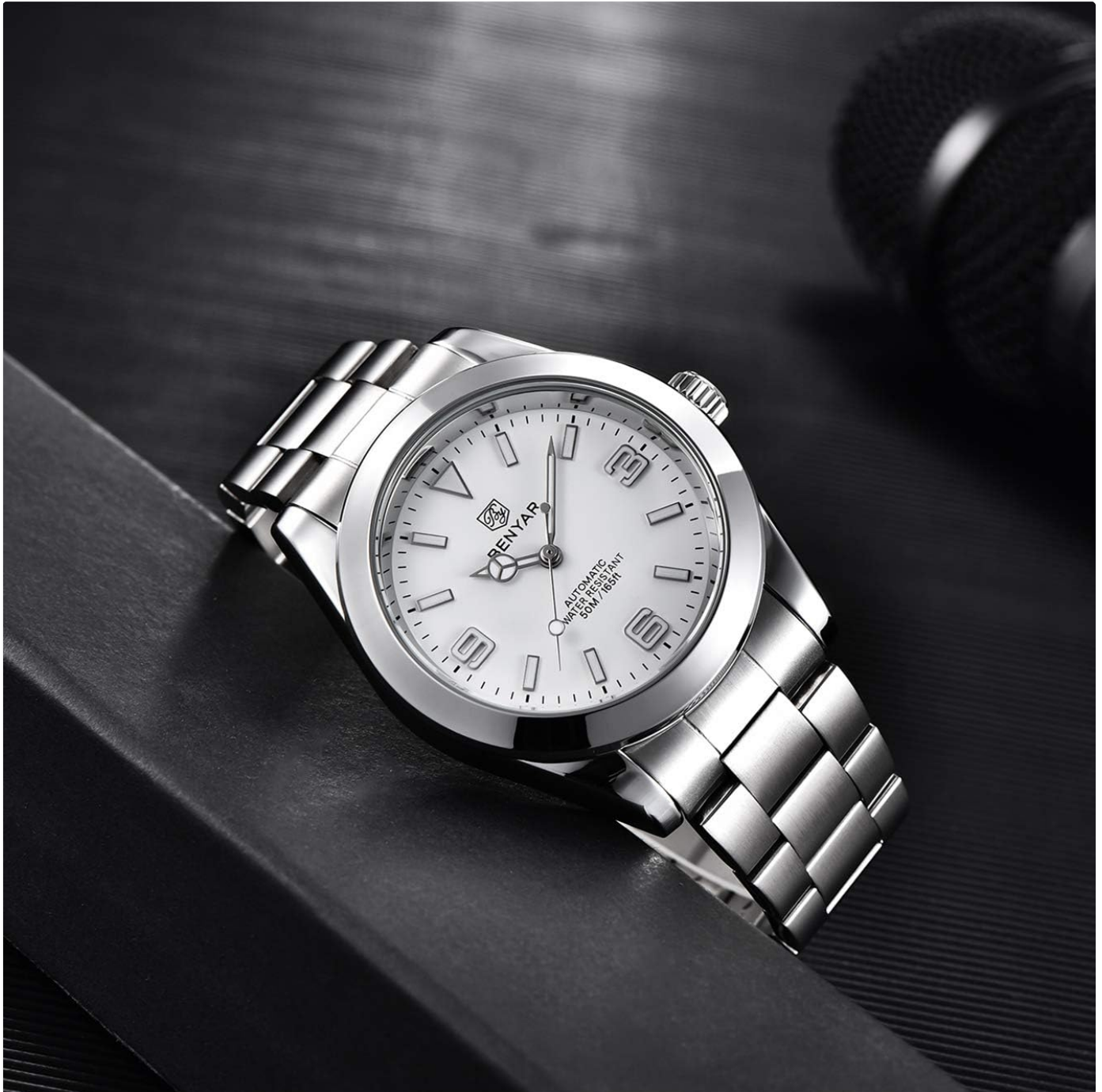
Image: The BENYAR 5177 watch displayed on a dark surface, highlighting its polished finish.