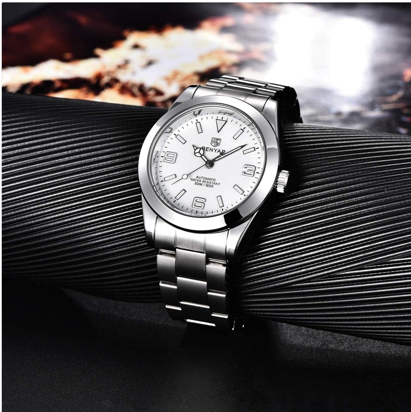
Image: A detailed view of the BENYAR 5177 watch, highlighting its craftsmanship and materials.