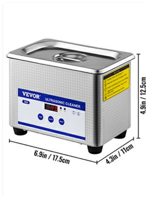
Image 9.1: Dimensional overview of the ultrasonic cleaner, indicating its length, width, and height for reference.