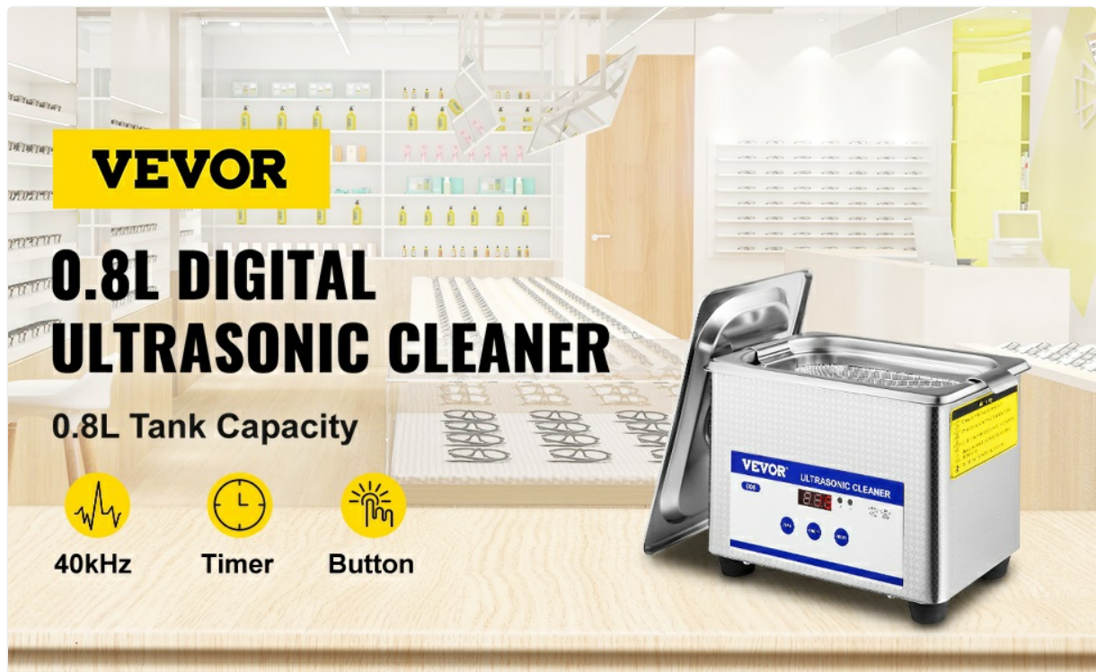
Image 1.1: The VEVOR 0.8L Professional Ultrasonic Cleaner, highlighting its key features including 40kHz frequency, timer, and digital display.

This manual provides comprehensive instructions for the safe and effective operation, maintenance, and troubleshooting of your VEVOR 0.8L Professional Ultrasonic Cleaner, model i6trshv. Please read this manual thoroughly before first use and retain it for future reference.