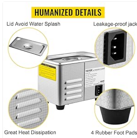
Image 4.2: Detailed view of the unit's design elements, including the lid for splash prevention, the secure power input, heat dissipation features, and stable rubber feet.