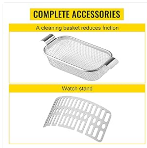
Image 3.1: The ultrasonic cleaner unit shown with its cleaning basket and watch stand accessories.