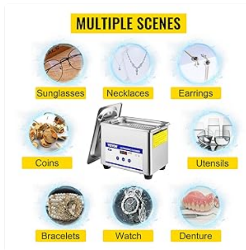
Image 6.3: A display of multiple applications for the ultrasonic cleaner, demonstrating its versatility for cleaning items such as eyewear, jewelry, coins, and dental appliances.