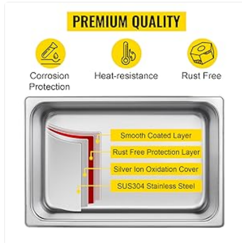
Image 4.1: Illustration of the premium quality SUS304 stainless steel tank construction, emphasizing its corrosion protection, heat resistance, and rust-free characteristics.