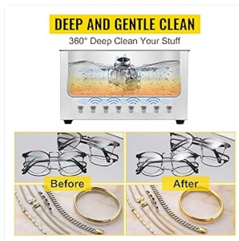
Image 6.2: Visual comparison illustrating the effectiveness of the ultrasonic cleaner on items like glasses and jewelry, showing a significant improvement after cleaning.