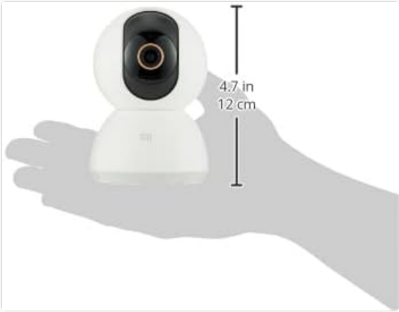
Image: Xiaomi Mi 360° Home Security Camera 2K showing its approximate dimensions.