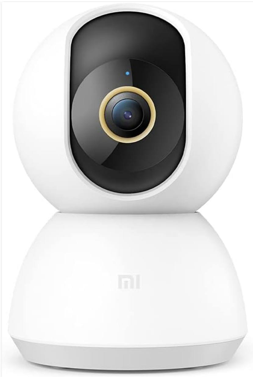
Image: Front view of the Xiaomi Mi 360° Home Security Camera 2K, highlighting its design and lens.