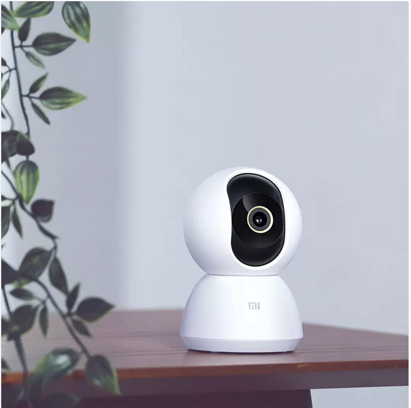
Image: The camera positioned on a surface, ready for use.