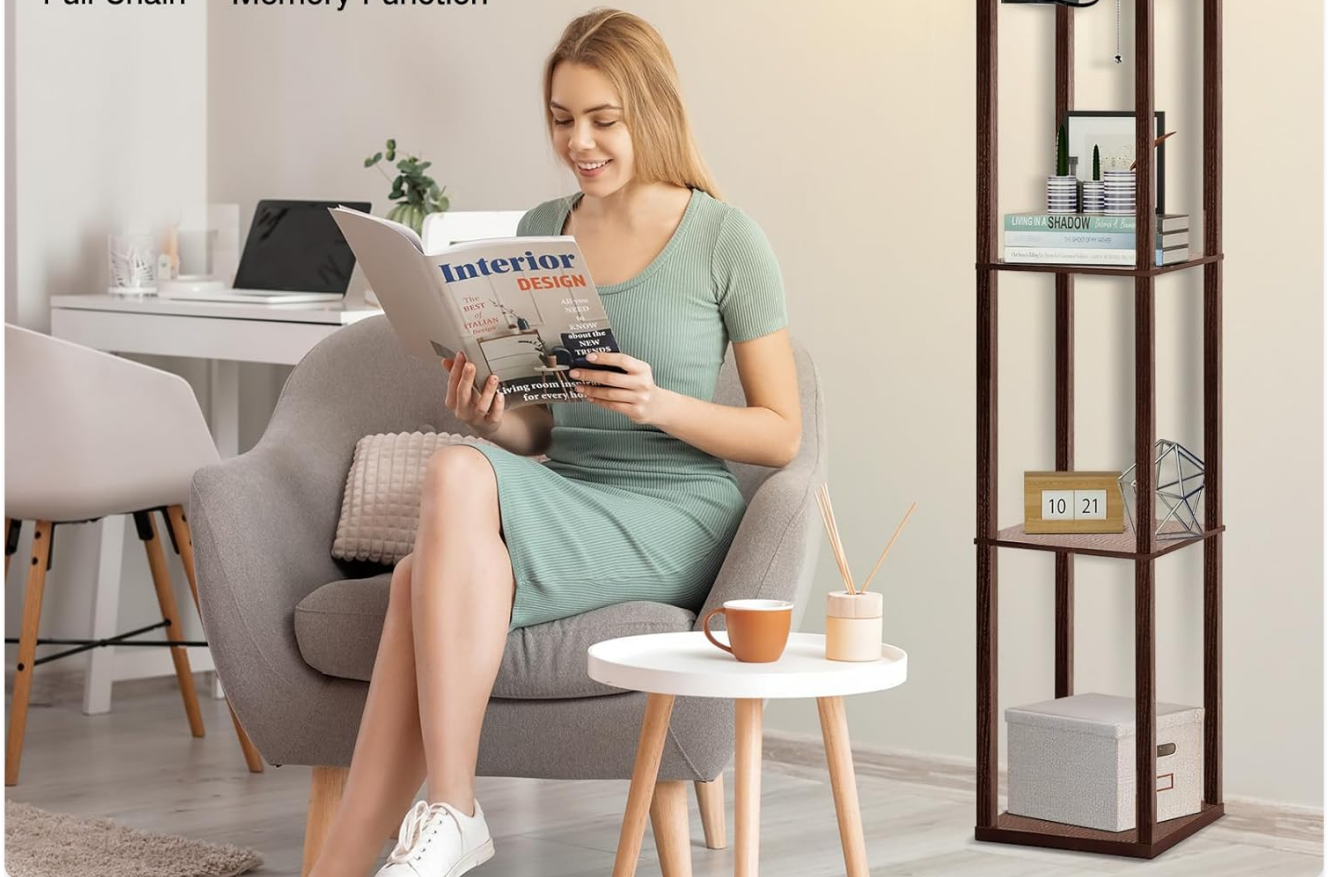
Image: A person reading next to the floor lamp, illustrating the pull chain switch and memory function for easy control.