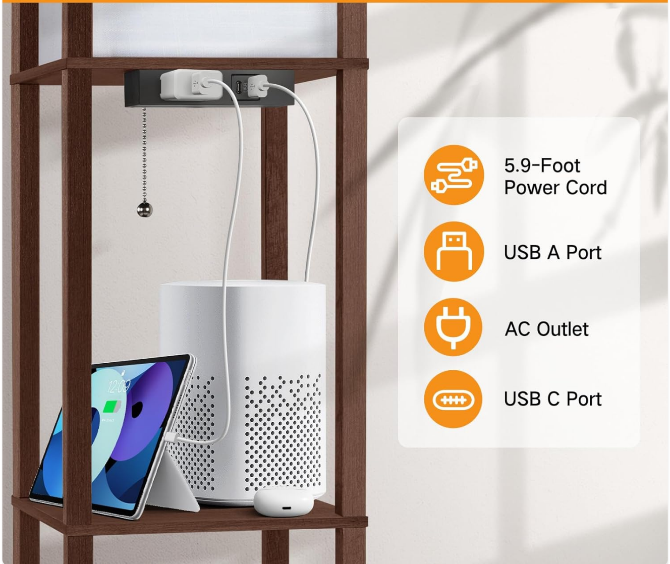
Image: A close-up of the integrated charging station with a Type-C port, USB port, and AC outlet, showing devices being charged.

Quickly charge your 3 devices simultaneously whether the lamp is on or off.