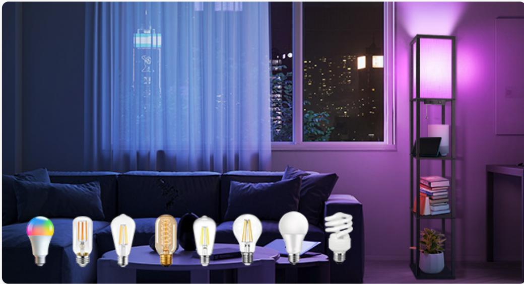
Image: Various E26 standard bulbs, illustrating the compatibility of the lamp with different bulb types.