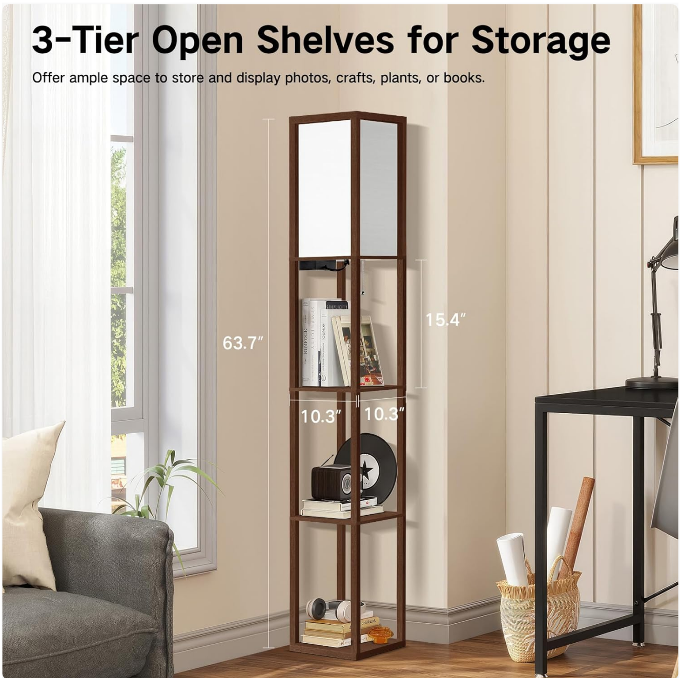
Image: The assembled floor lamp showcasing its three open shelves, ideal for storage and display.

Offer ample space to store and display photos, crafts, plants, or books.