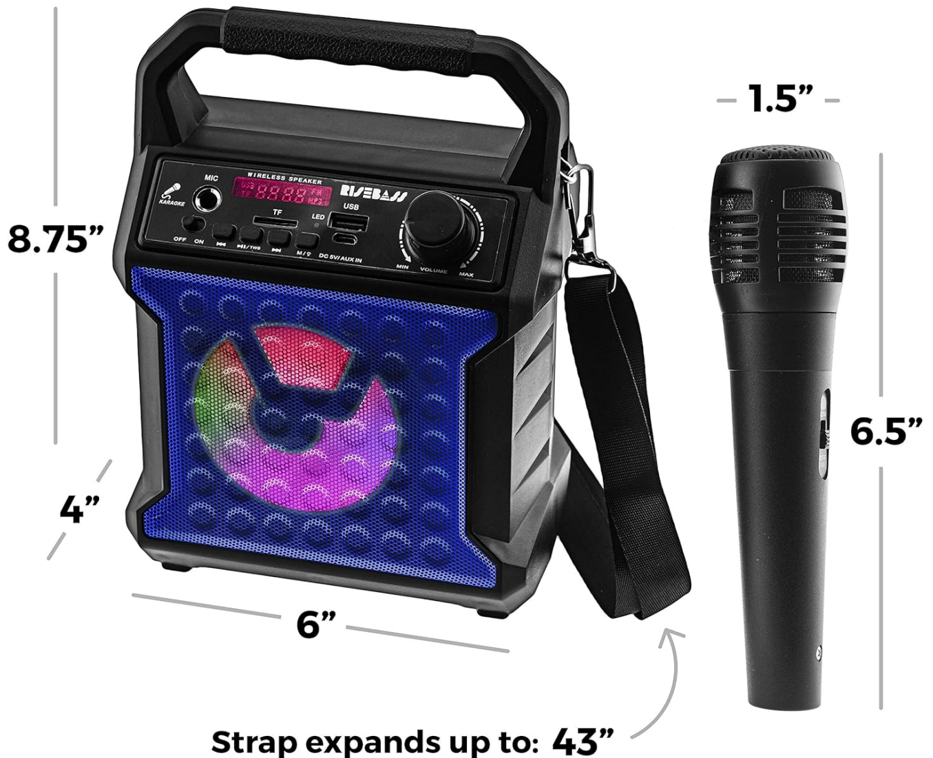
Image: Product dimensions of the karaoke machine (8.75" H x 6" W x 4" D) and microphone (6.5" H x 1.5" D).