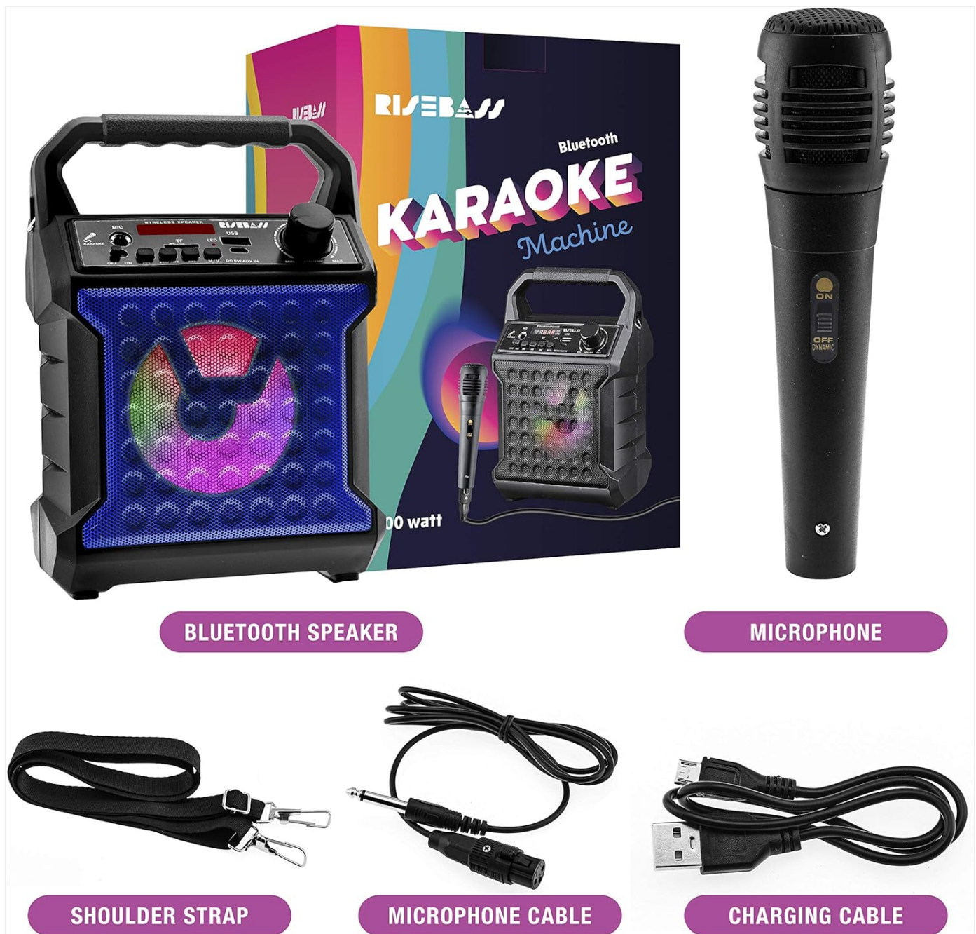
Image: The package contents, showing the main unit, microphone, shoulder strap, microphone cable, and charging cable.