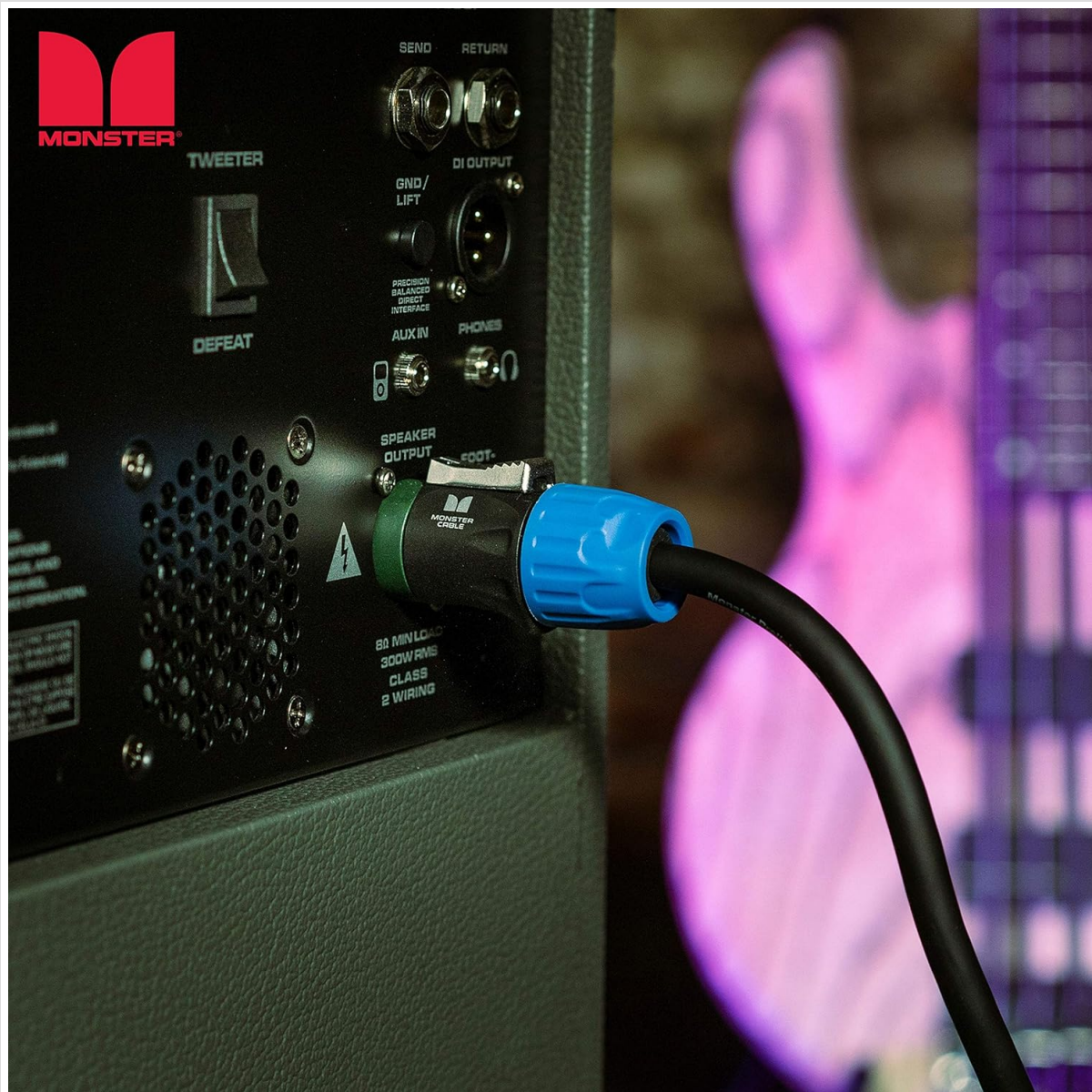
Image: The Monster Prolink Performer 600 Speakon cable properly connected to a speaker output, demonstrating a secure and ready-to-use setup.