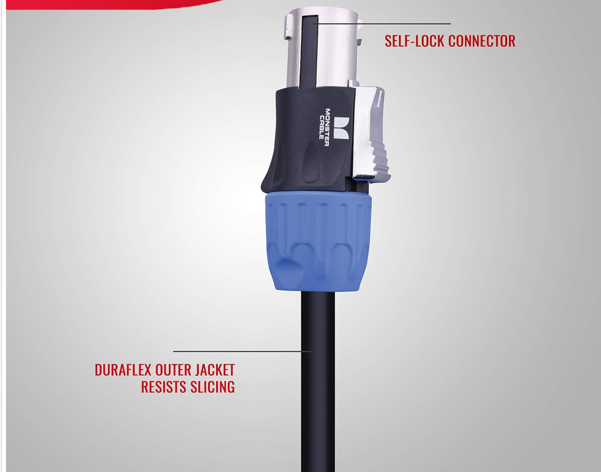
Image: Detail of the Monster Prolink Performer 600 Speakon connector, highlighting the self-lock mechanism and the Duraflex outer jacket for enhanced durability and performance.

Get high-fidelity and clear signal transfers from your speaker system whether.