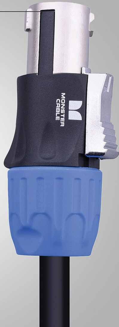
Image: A close-up view of two Monster Prolink Performer 600 Speakon connectors, illustrating the self-locking twist-lock design for secure connections.

Built with Monster's custom self-locking twist-lock connector for effortless plugging or unplugging.