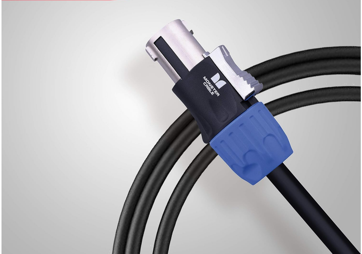
Image: The Monster Prolink Performer 600 cable demonstrating its long-lasting quality with the robust Duraflex outer jacket.

Features our Duraflex outer jacket, which resists slicing and abrasions