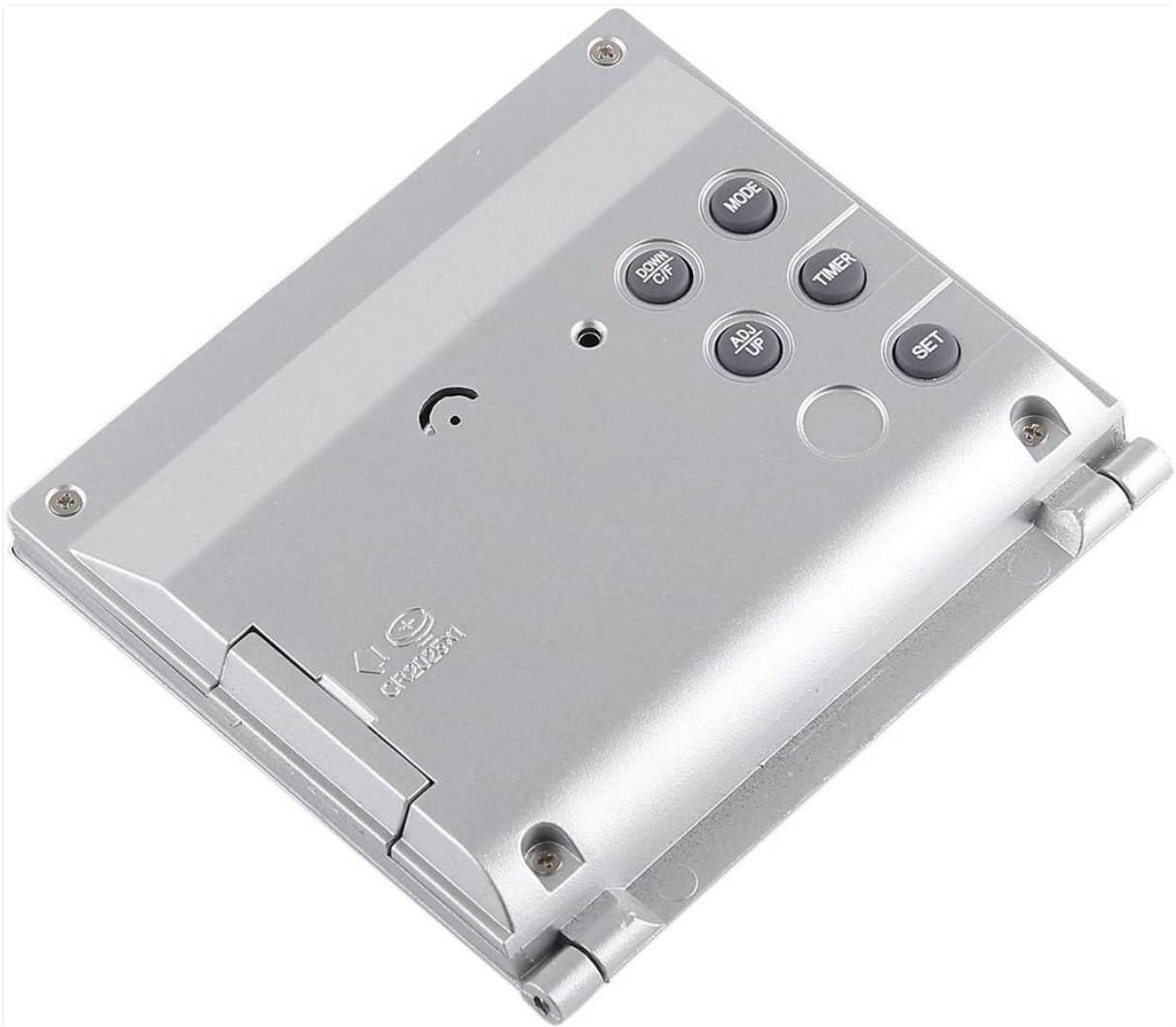
Image: A close-up view of the control buttons located on the rear panel of the MT-033 digital clock, including MODE, SET, ADJ/UP, DOWN/C/F, and TIMER.