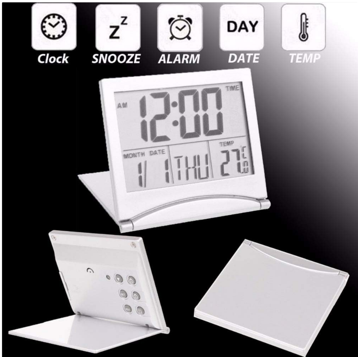
Image: The MT-033 digital alarm clock displaying time, date, and temperature, accompanied by icons representing its clock, snooze, alarm, date, and temperature features.