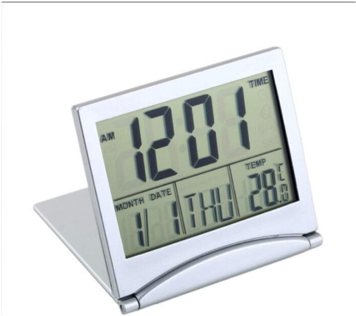
Image: The MT-033 digital alarm clock in its open, standing position, clearly displaying the time, date, and temperature on its LCD screen.