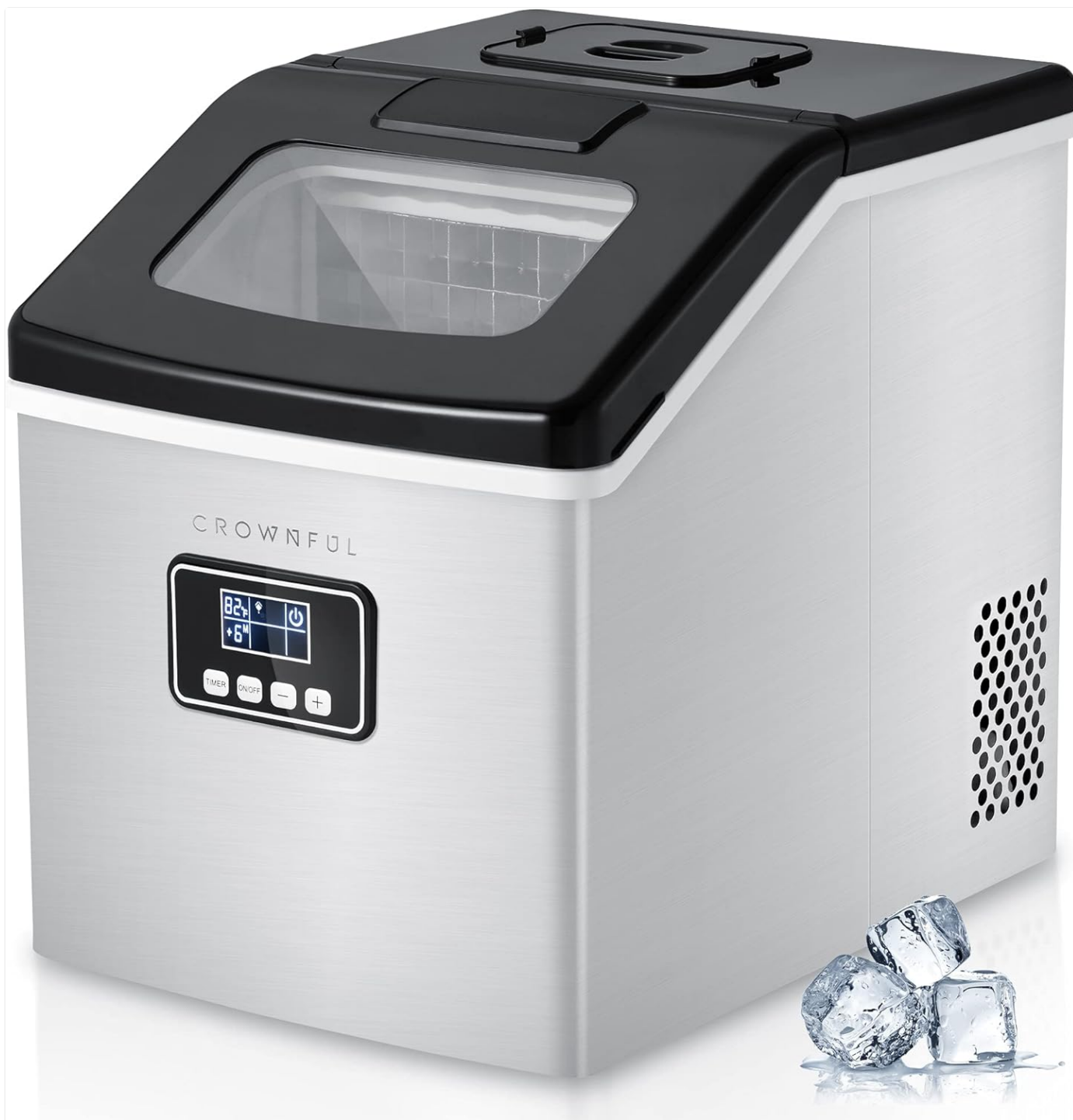
Image: The CROWNFUL Ice Maker Machine, a sleek silver unit with a black lid and an LCD control panel on the front.