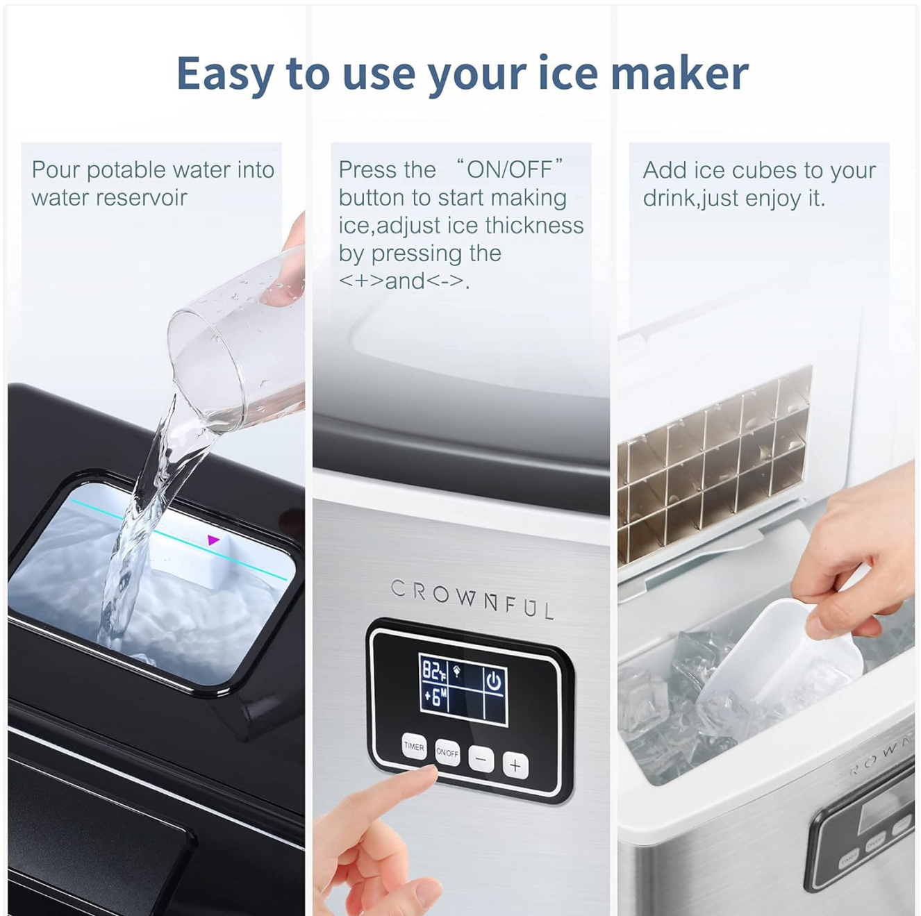
Image: A hand pouring water into the ice maker's water reservoir, demonstrating the ease of filling.