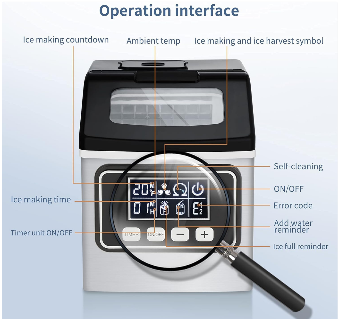
Image: Detailed view of the LCD control panel with indicators for ice making countdown, ambient temperature, ice making/harvest symbol, self-cleaning, ON/OFF, error code, add water reminder, and ice full reminder.