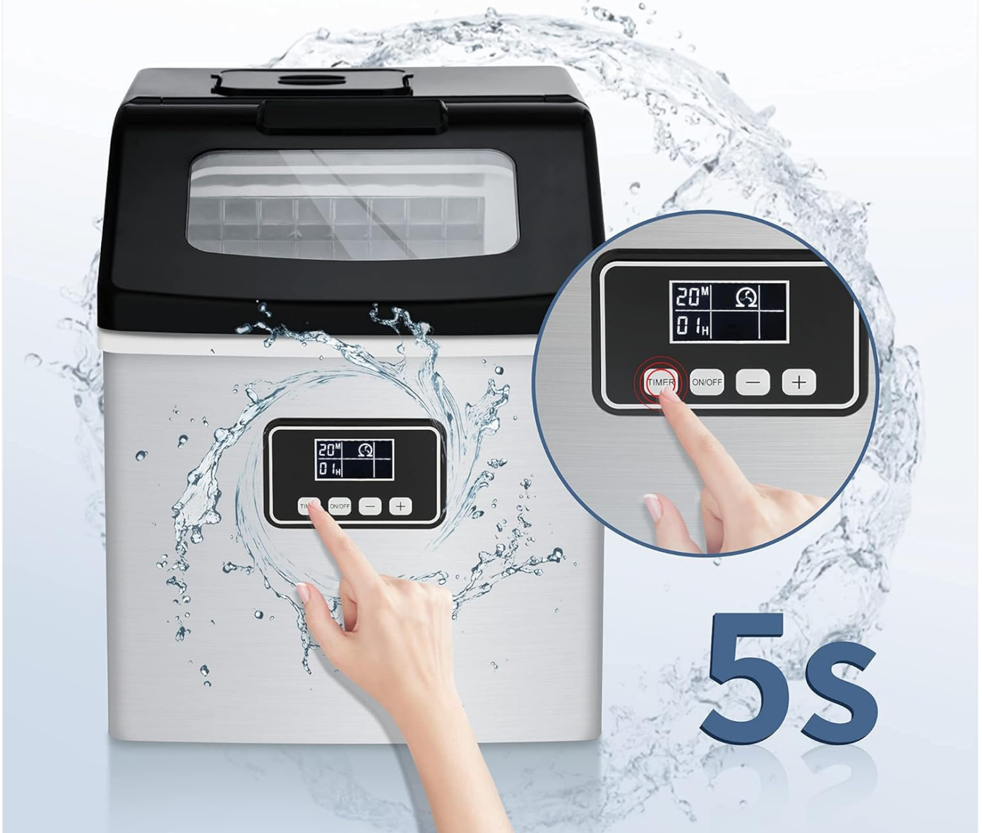
Image: A hand pressing the TIMER button for 5 seconds to initiate the auto self-cleaning function, with water splashing inside the unit.

Deeply cleans the ice maker's interior without manual labor. Less effort, saves time.