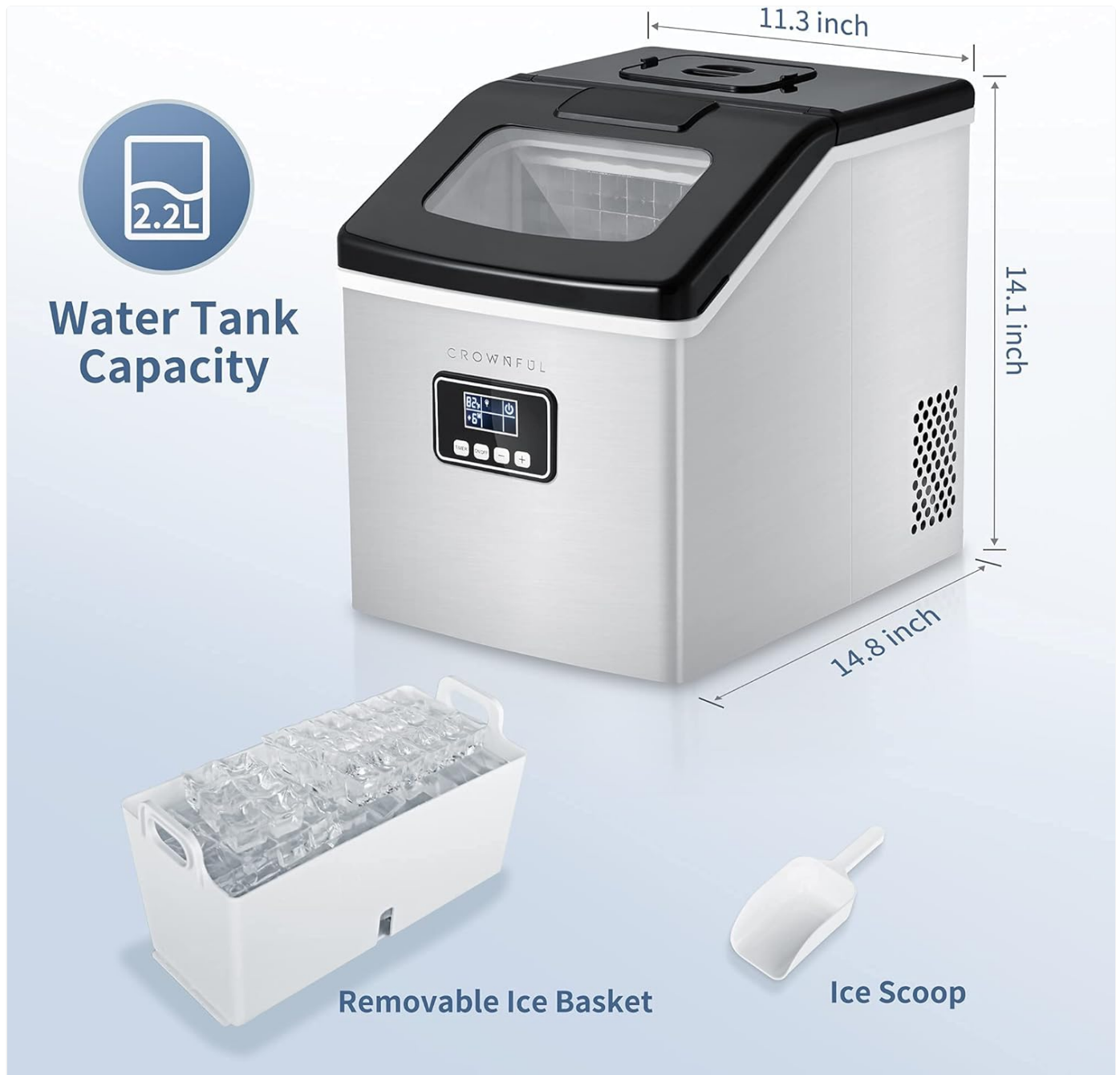
Image: The ice maker with its removable ice basket and ice scoop, illustrating the 2.2L water tank capacity and overall dimensions.